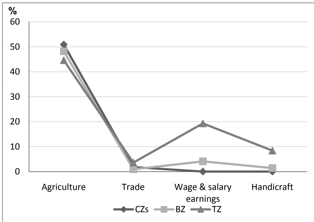
Fig. 2. Ratio of main occupation in different zones (Data appendix used for the compilation of the graph are available from the authors)

decreased significantly from the TZ to the CZs. Likewise, the threat on the forest resources in the TZ may be less than that in two other zones.