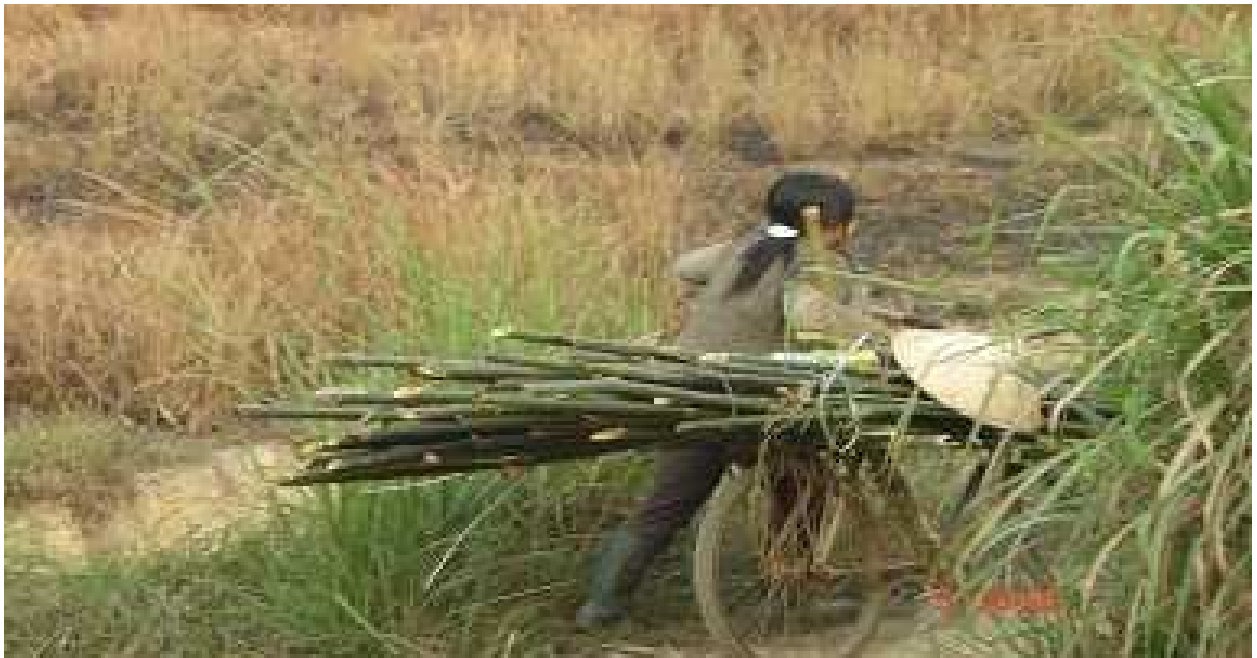
Fig. A2. A young woman carrying bamboo poles by bicycle