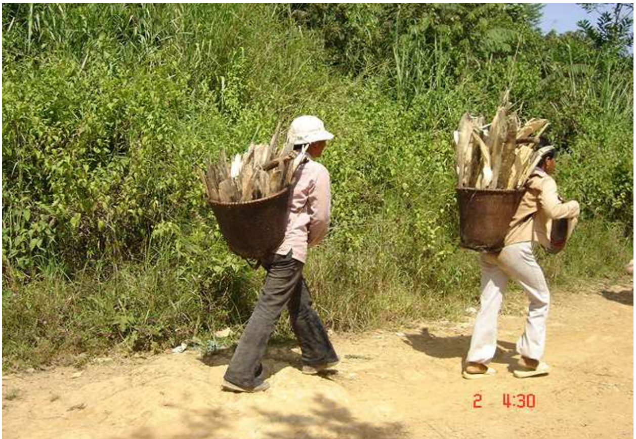
Fig. A3. Young women carrying fuel wood from the forest