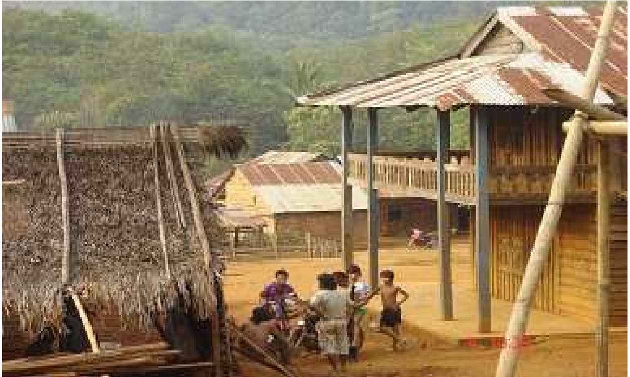
Fig. A6. A surveyed hamlet with cashew plantations in the CZ in Cat Loc Sector Source: Photo by Dinh Thanh Sang, field survey, 2010