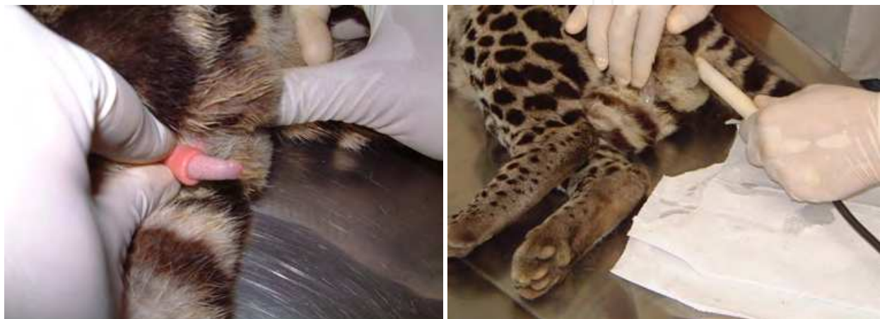
Fig. 1. Ocelot's penis exposed before semen collection; the penis' spines can be observed (left). Ocelot's electroejaculation procedure (right).

semen should be evaluated for motility and progressive sperm motility. Motility is expressed in percentages, with 0% being the value for immobile spermatozoa and 100% for maximum spermatozoa performance. The sperm type of movement is evaluated by the progressive sperm motility in scale from 0 to 5 (0 - no motility, 1 - poor lateral movement with some progression, 2 - moderate lateral movement with occasional progression, 3 - slow progression, 4 - progression, 5 - rapid progression) (Howard, 1993).