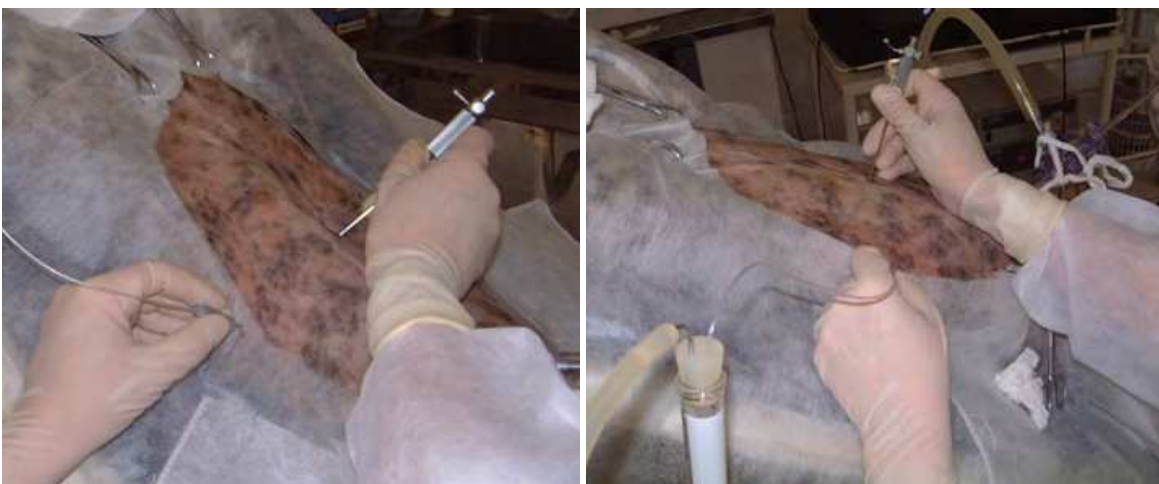
Fig. 4. Follicular aspiration using video-laparoscopy and Verres needle in ocelot (left). Aspiration follicular system (right).

The oocytes from carnivores are dark and contain lipidic drops. The maturation status is characterized in I, II and III according morphological aspects. Oocytes I are of excellent quality, characterized by a uniformly dark cytoplasm, nucleus with a distinct corona radiata, and an expansive cumulus cell mass. Oocytes II are of regular quality, characterized by a non-uniformly cytoplasm, nucleus with an indistinct corona radiata, and a non-expansive cumulus cell mass. Oocytes III are degenerated and characterized by an abnormal cytoplasm, nucleus without corona radiata or cumulus cell mass (Goodrowe et al., 1988; Johnston et al., 1989).