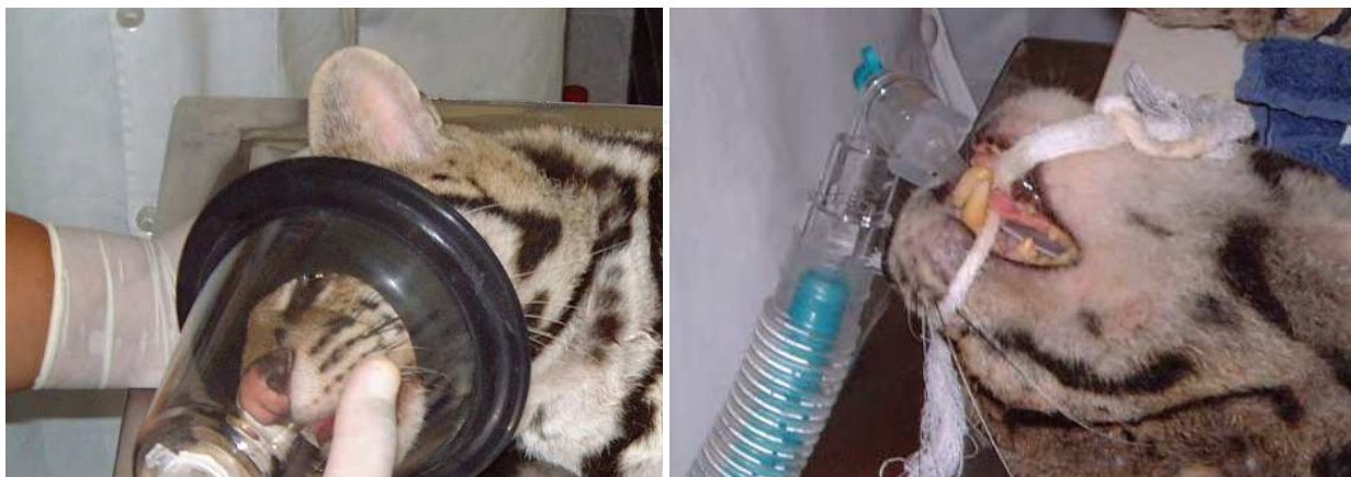
Fig. 2. Anesthesia with isoflurane gas mask (left) and intubation (right).

According to ovarian stimulation protocols, the animals should be inseminated within 24 to 48 hours after hCG or pLH administration, or after the ovulation process. Inhalatory anesthesia is necessary to perform this procedure (Figure 2).