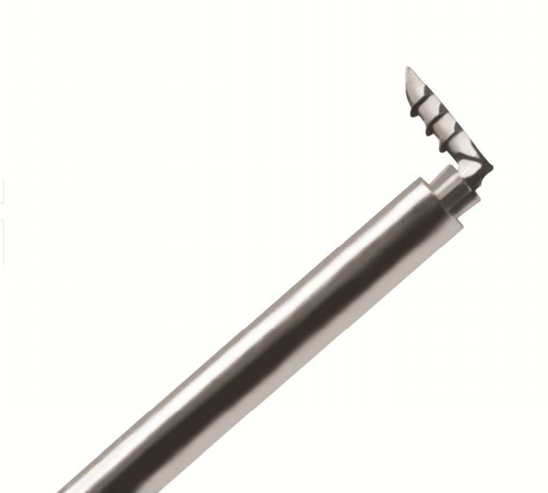
Fig. 2. iStent® trabecular bypass in iStent inserter