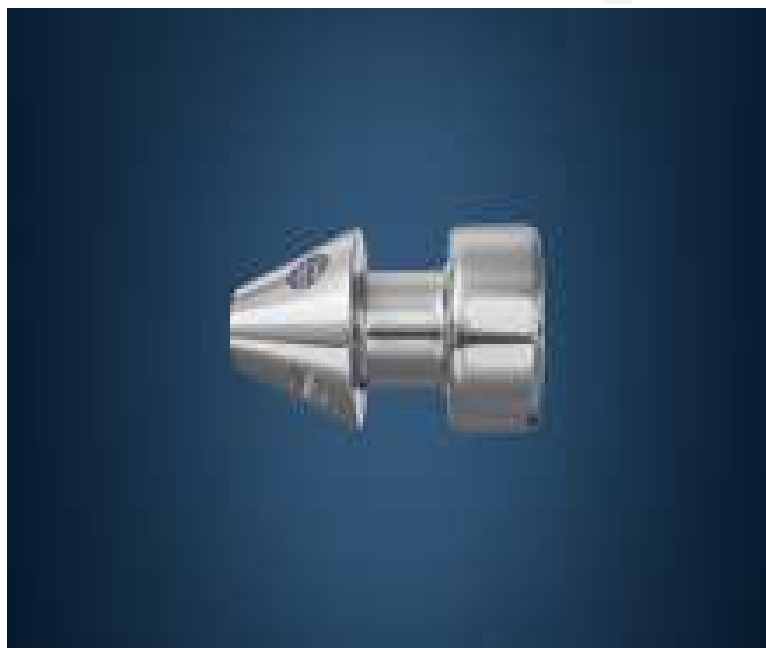
Fig. 7. iStent® inject

This new mechanism of implantation allows for implantation of two stents without exiting the inserter from the eye.