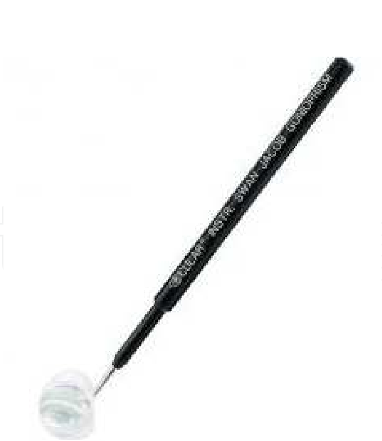
Fig. 3. Swan-Jacob gonioscope