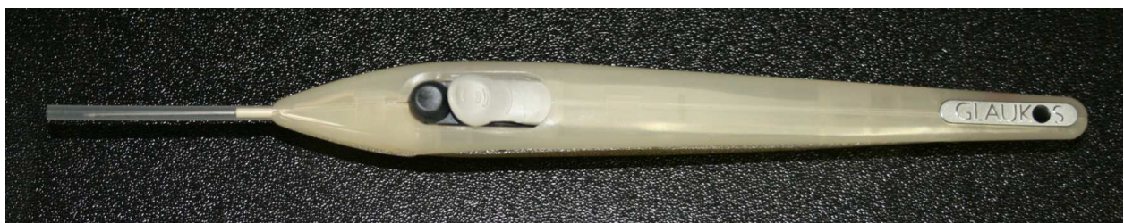
Fig. 8. iStent® inject inserter