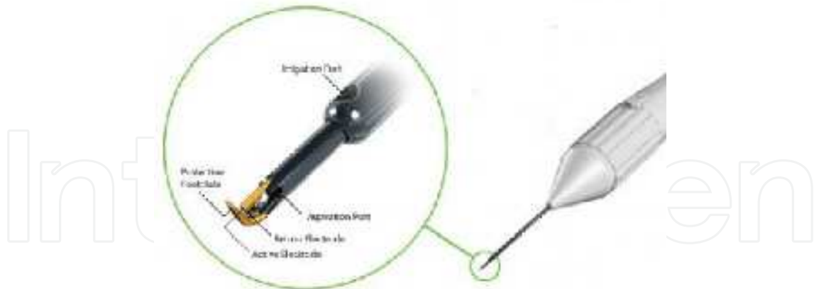
Fig. 9. Trabectome probe and tip

The tip of the handpiece is specially designed with an insulated footplate and is pointed for ease of insertion through the trabecular meshwork into Schlemm's canal. The footplate is coated with proprietary multilayered polymer, which provides thermal stability, mechanical strength, biocompatibility and chemical resistance in laboratory testing. The aspiration port is in close proximity (approximately 0.3 mm) to the cautery electrode and serves to remove debris during ablation. The irrigation is 3 mm from the surgical site and serves the dual purpose of keeping the eye pressurized and further dissipating heat energy. Although the irrigation and aspiration system role is important, the high-frequency electrocautery generator system is the pivotal point of this technology. The generator is a modified 800 EU unit from Aaron/Bovie (St. Petersburg, FL, USA) and operates at a frequency of 550 kHz with adjustable power setting in 0.1-W increment up to 10 W (recommended range 0.5–1.5 W). The target tissue is disrupted and disintegrated by applying heat energy in bursts with a high-peak power and low duty cycle. This ablation approach equates to high-energy bursts, which are bunched into small increments with comparably long time intervals in between. As a result, disruption and disintegration of tissue is achieved rather than a thermal-cooking effect such as that seen in traditional cautery of blood vessels. 7,8