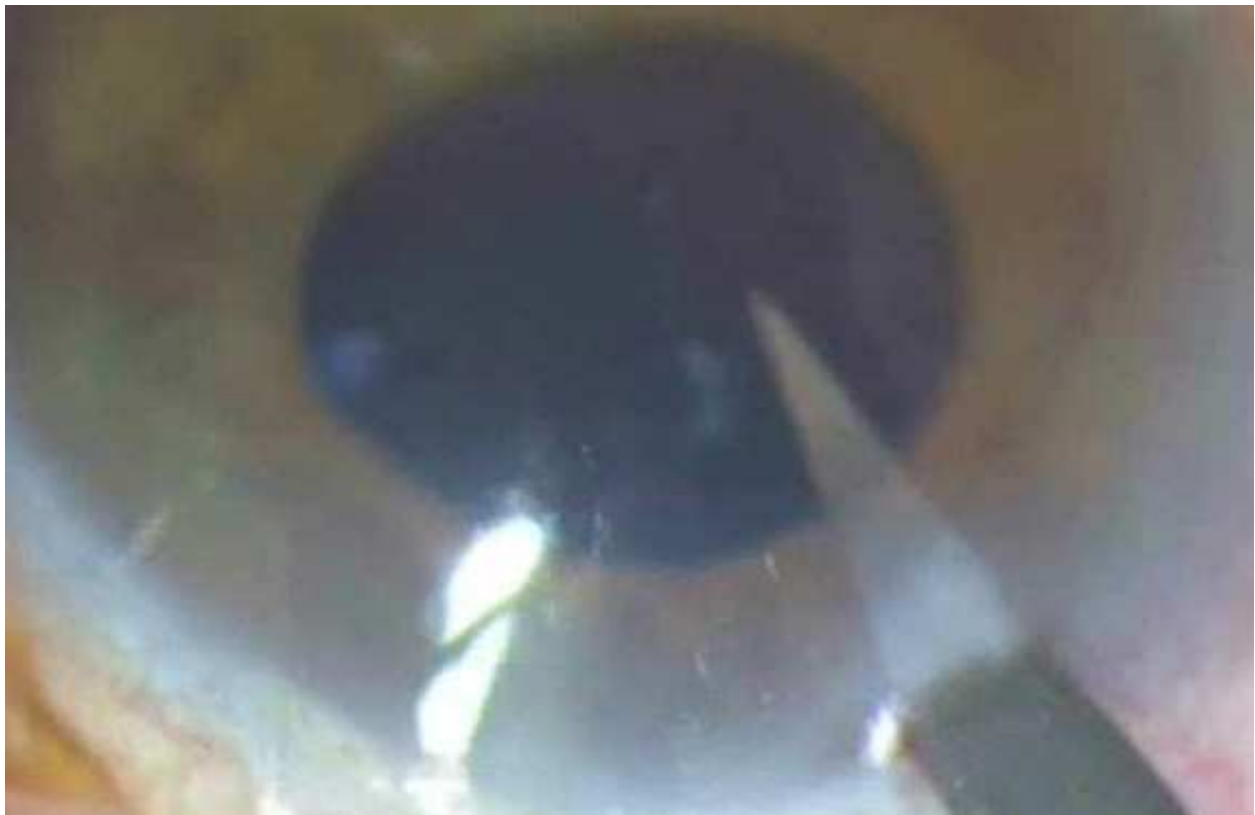
Fig. 4. A paracentesis is performed temporally.