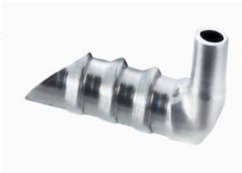
Fig. 1. iStent® trabecular bypass

The iStent® trabecular micro-bypass (Glaukos Corporation, Laguna Hills, CA) is made of titanium and coated with heparin (Duraflo® powder). It is L-shaped and measures 1 mm x 0.33 mm, with a nominal snorkel bore diameter of 120 microns (fig.1). The iStent is designed to fit into Schlemm's canal. The distal portion of the stent is bevelled and sharpened to facilitate penetration into the tissue of the trabecular meshwork. The external surface features three retention arches that impede the movement of the stent once it has been implanted. The implant weighs approximately 0.1 mg. It is delivered preloaded on an insertion device (fig.2) and it is implanted at the level of the trabecular meshwork with the aid of a Swan-Jacob type gonioscope (fig.3). Two versions of the iStent are available; one for the right eye and one for the left eye. The difference lies in the orientation of the rails, designed to facilitate the penetration of the implant into the trabecular meshwork. The distal tip of the implant should point towards the patient's feet at all times.