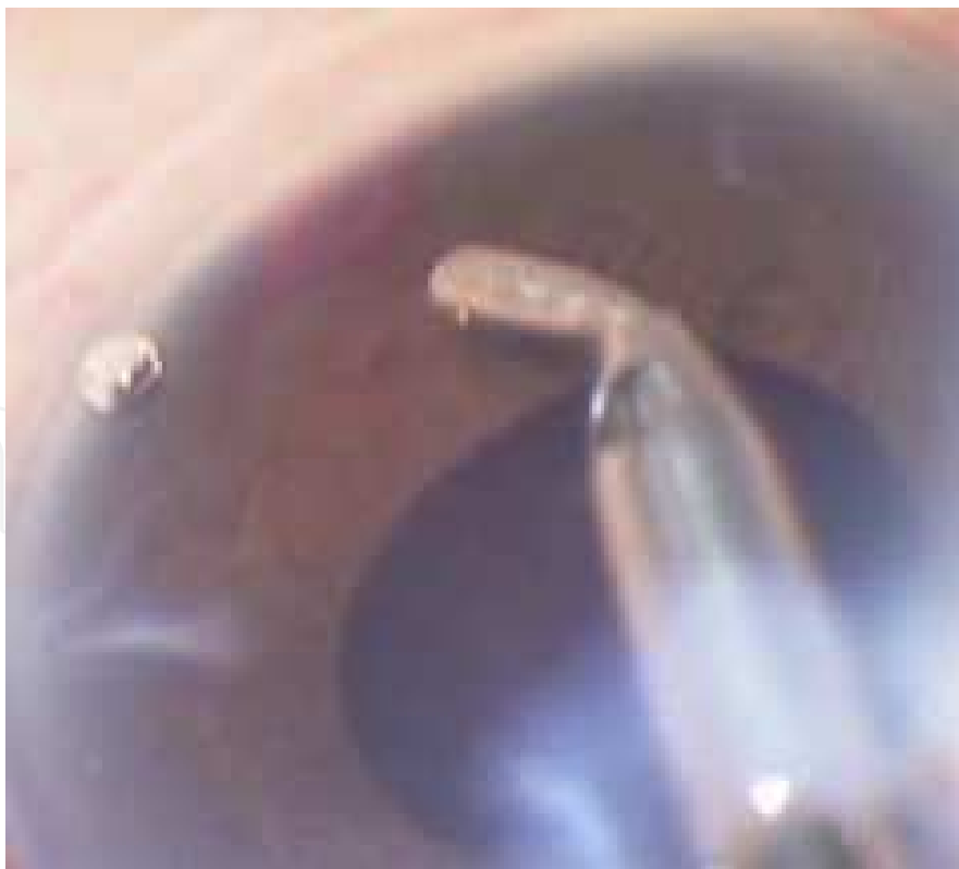
Fig. 6. Residual blood and viscoelastic are washed and aspirated by the anterior chamber with a coaxial I/A tip - the same can be done using a bimanual technique.