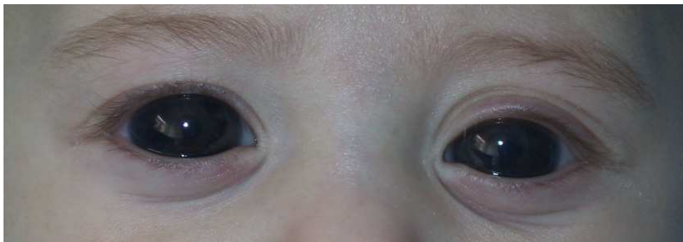
Fig. 4. Buphthalmos in PCG

Primary congenital glaucoma (PCG) is the most common reason for raised intraocular pressure in child. It occurs in 1:10000 births and more commonly in boys. 75% of the cases are bilateral. Although autosomal recessive cases have been described, most cases of PCG are sporadic. Glaucoma develops due to the anomalous development of the anterior chamber angle. Raised intraocular pressure, cloudy cornea, large appearance of the eye (buphthalmos), optic nerve alterations due to high intraocular pressure and special biomicroscopic signs are diagnostic features of PCG.