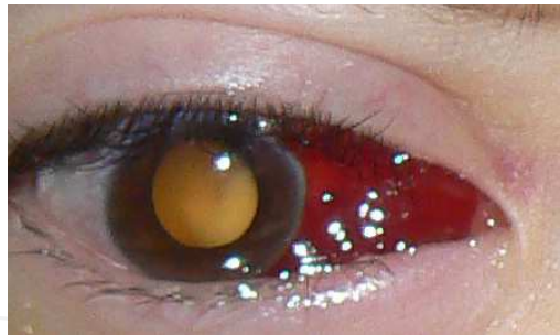
Fig. 8. Leukocoria due to RB