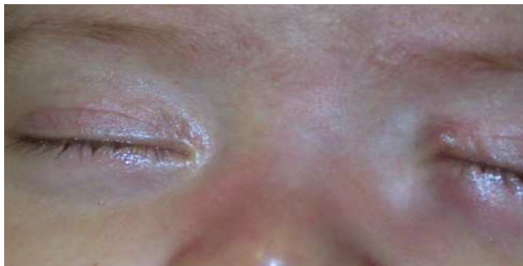
Fig. 2. Left dacryocele

Amniontocele (congenital dacryocele), punctual atresia or fistulae between the sac and the skin are other rare etiologies for epiphora. Amniontocele is characterized by a blue-green distention of the lacrimal sac, observed externally at the level of inner canthus. It is due to an imperforate valve of Hasner. Amniontocele is mostly self limiting within a few days of birth, especially if massage is applied (Rose, 2000).