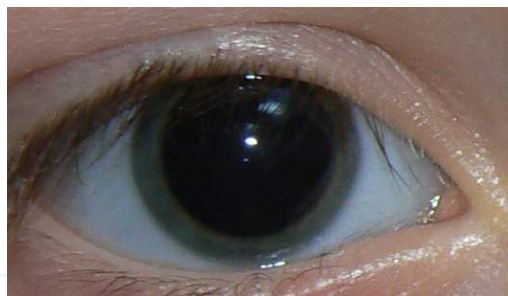
Fig. 9. Blue sclera in a case of EDS

Angioid streaks (blood vessel-like) and visual loss may occur in pseudoxantoma elasticum