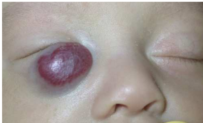
Fig. 1. Capillary hemangioma

Infantile hemangiomas are the most common eyelid tumors in infancy. They have a bright red or purple appearance. Superficial ones typically blanch with pressure. At birth, they may be clinically undetected. However, they typically enlarge in the first 12 months followed by a slow involution during the first decade. Vision loss is related to amblyopia because of induced astigmatism or visual deprivation due to ptosis. Steroid treatment (intralesional and/or oral) is the first line of therapy (Levin, 2003).