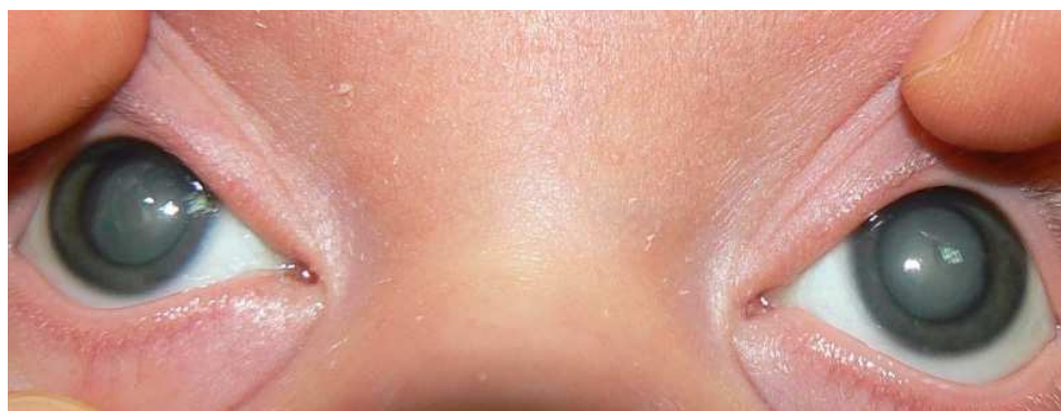
Fig. 3. Bilateral congenital cataract

Cataract is the opacification of the crystalline lens. Cataracts result from protein denaturation, increased molecular weight of proteins, water vesicles between lens fibers, increasing proliferation and migration of the lens epithelium. Childhood cataract occurs worldwide and is an important cause of childhood blindness in many countries. Congenital cataracts occur in about 3 in 10 000 live births. Two-thirds of cases are bilateral. The cause of the cataract can be identified in about half of the cataractous eyes. Unilateral cataracts are usually isolated sporadic incidents, without a family history or systemic disease and effected infants are usually full-term and healthy. Cataract can be associated with ocular abnormalities, trauma, or an intrauterine infection such as rubella. Bilateral cataracts are often inherited and associated with other diseases. They require a full metabolic, infectious, systemic and genetic workup. The common causes are hypoglycemia, trisomy (eg, Down, Edward and Patau syndromes), myotonic dystrophy, infectious diseases (eg, toxoplasmosis, rubella, cytomegalovirus and herpes simplex [TORCH]) and prematurity. Isolated hereditary cataracts account for about 25% of the cases. The mode is most frequently autosomal dominant, but may be autosomal recessive or X-linked (Mickler, 2011).