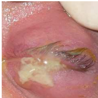
Fig. 7. Gonococcal keratoconjunctivitis

Staphylococcus aureus , staphylococcus epidermidis , and streptococcus pneumonia are the most common organisms that cause infectious keratitis. Bacterial keratitis usually occurs in patients with damaged corneal epithelial integrity. However, Neisseria gonorrhoeae , Corynebacterium diptheriae , Listeria and Haemophilus species may lead to keratitis in the presence of intact epithelium. Bacterial keratitis is characterized by oval shaped corneal infiltrations surrounded by corneal edema, conjunctival hyperemia (injection), ocular pain and photophobia.