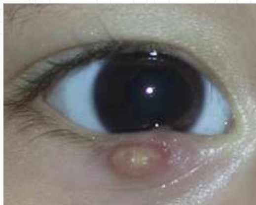
Fig. 5. Stye at lower eyelid

Congenital ptosis is the most important disease of the eyelids in a child. It is usually unilateral and occurs sporadically in most cases. The underlying pathology is the dysplasia of the levator palpebralis muscle. Surgical correction during the preschool years must be performed. If the disease is severe, early surgery to prevent amblyopia may be performed.