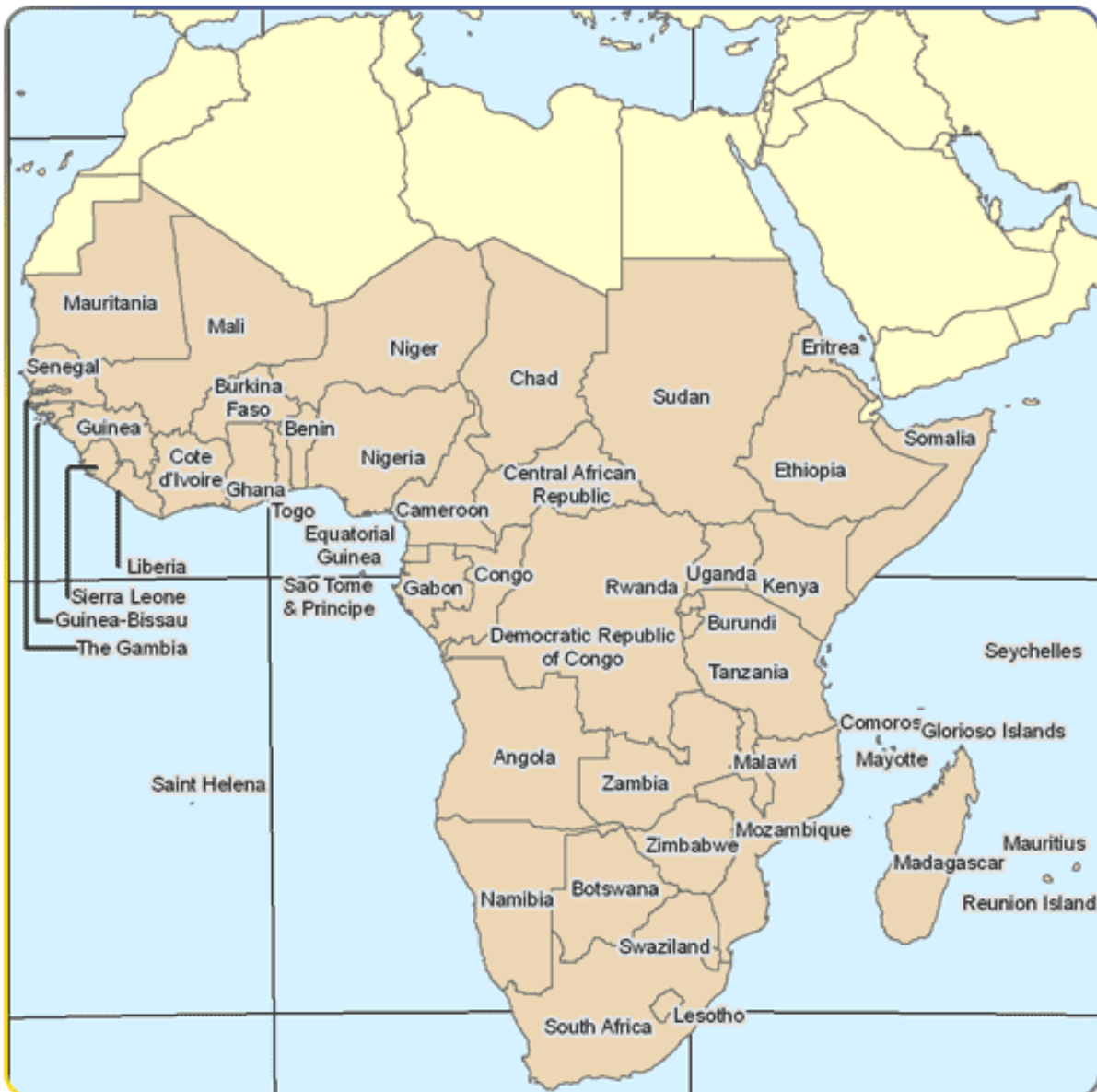
Fig. 1. Map showing the countries of Sub Sahara Africa (NB Southern Sudan became independent July 2011)

hospital and regional based cancer registry figures, reports from specific centres, conference proceedings and a review of work done on cervical cancer in the authors institution The University College Hospital Ibadan Nigeria.