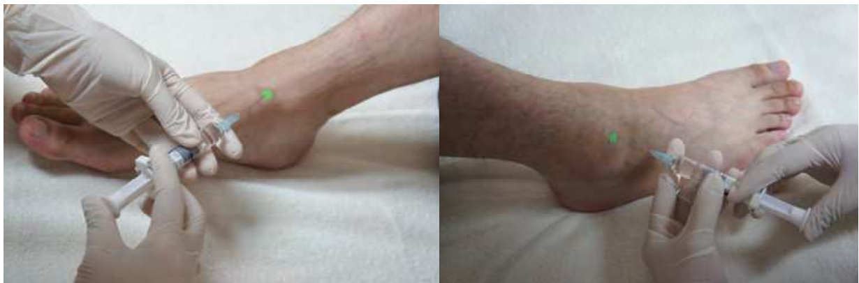
Fig. 1. The two approaches for ankle joint injection: the anterior medial and anterior lateral approaches

Most injection in the ankle joint was performed without any instrumental guide in the literature. One of the limitations of hyaluronate therapy is that it can be difficult to ensure that intraarticular injections are actually given into the joint capsule. In clinical trials with ankle viscosupplementation, only one trial used a fluoroscopic guide for the injection (Cohen et al, 2008). Ultrasound has been used to guide hyaluronate injection in hip and hand OA, however, no ultrasound guide has been used in ankle OA studies. The aim for the future is to encourage the ultrasound-guided intraarticular injection because it is simple, fast, economic and safe; it does not require the use of contrast, allowing the intraarticular injection in patients intolerant to iodized contrasts. It can be repeated without limits, allows an easy visualization of fluid in the articular recess, the correct position of the needle and the distance from the vessels.