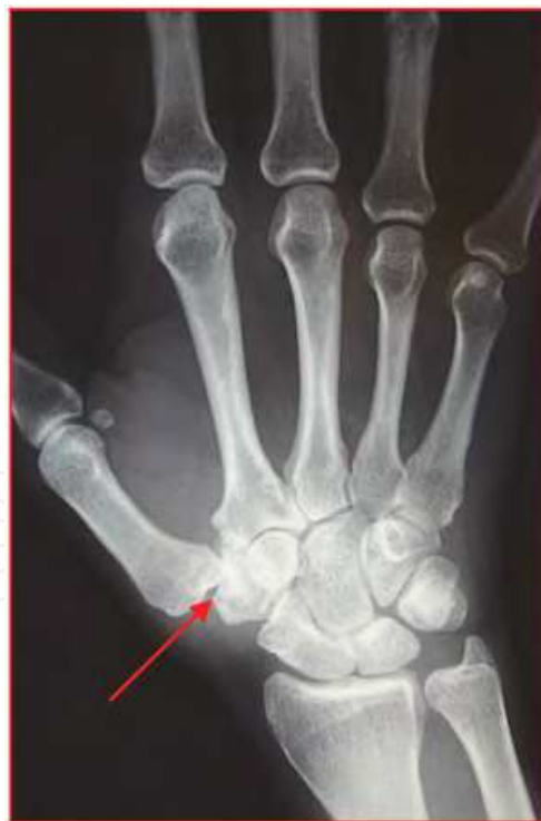
Fig. 6. PA Radiograph of Thumb CMC Arthritis

Initial treatment should focus on behavior modification, NSAIDS, and rest. Also, all patients should undergo a trial of conservative management including occupational therapy, splinting, and steroid injections. Occupational therapy should focus on strengthening the surrounding muscles to support the joint while stretching to maximize range of motion. Splinting can reduce the focal and load stress on the joint. The effectiveness of corticosteroid injections is widely debated with several studies demonstrating conflicting conclusions.(Day, Gelberman et al. 2004; Meenagh, Patton et al. 2004; Khan, Waseem et al. 2009; Swindells, Logan et al. 2010) A combination of these two treatments has shown to be effective in stage I and stage II disease.(Swigart, Eaton et al. 1999) As the disease progresses and the joint undergoes further degenerative changes the results of this treatment modality becomes less predictable. A recent study in 2009 also demonstrated hylan injections as an alternative to corticosteroid with equal efficacy.(Heyworth, Lee et al. 2008)