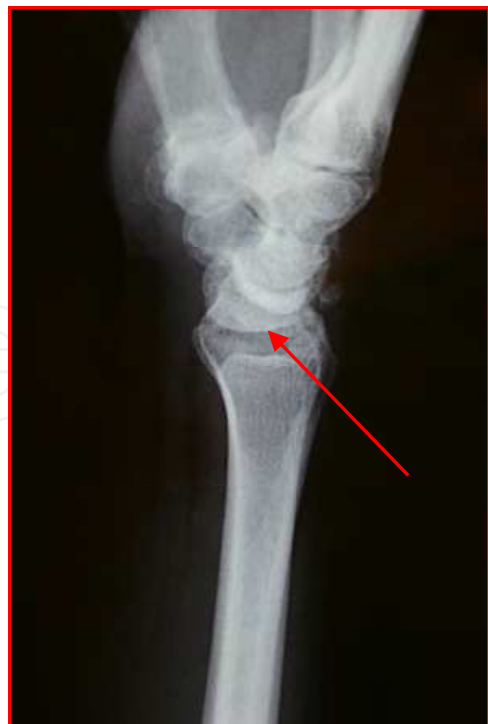
Fig. 3. Lateral Radiograph of SLAC Wrist