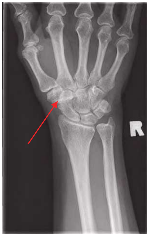
Fig. 8. PA Radiograph of STT Arthritis

As previously mentioned, the differential diagnosis must include thumb CMC arthritis. In a cadaveric study, 46 % of patients with STT arthritis had concomitant thumb CMC arthritis. (North and Rutledge 1983) Many hand surgeons term concomitant STT and thumb CMC arthritis as pantrapezial arthritis. As result of its shared prevalence and clinical presentation, it is important to combine clinical exam with radiographic findings for the definitive diagnosis. De Quervain tenosynovitis can present similarly, but the tenderness would be at the tip of the radial styloid and along the 1 st extensor compartment with a positive Finkelstein's test. Direct trauma to the STT joint as the primary pain generator should be investigated with a thorough and detailed history. Arthroscopy of the STT joint can be performed as a diagnostic procedure and palmar portal has been described as safe and efficacious. (Bare, Graham et al. 2003)