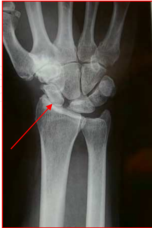
Fig. 2. PA Radiograph SLAC Wrist