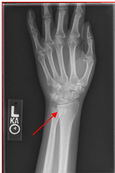
Fig. 4. PA Radiograph of Osteoarthritis of the DRUJ

ligaments (af Ekenstam, Palmer et al. 1984). The blood supply is provided by the anterior interosseous artery, the ulnar artery, and the medullary interosseous arteries. Understandably, those structures with ample blood supply, like the TFCC, are able to heal readily while the avascular structures, like the articular disc, are less able to do so. The annular ligament supports the proximal radioulnar joint and the interosseous membrane serves as a connection between the diaphysis of the radius and ulna.