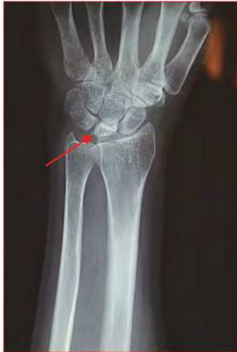
Fig. 9. PA Radiograph of Kienbock Disease

Stage I disease demonstrates mild pain, normal radiographs, and early degenerative changes on MRI. Stage II disease presents with increased pain, edema, and radiographs show increased lunate density. Stage III is divided into IIIA and IIIB. In stage IIIA radiographs show lunate collapse without scapholunate instability while stage IIIB disease shows lunate collapse with scapholunate instability. Stage IV is characteristic of pancarpal arthrosis. (Saunders and Lichtman 2011)