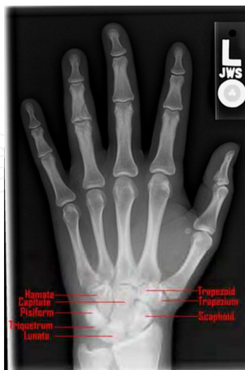
Fig. 1. PA Radiograph of Normal Wrist

Imaging studies are another valuable tool at the physician's disposal that allows him or her to better determine which joints are affected by the degenerative processes. The standard x-ray series should include a posteroanterior (PA), oblique, and lateral view.. A wrist with normal anatomic relationships will show that the radial shaft, capitate, and third metacarpal will line up along the same vertical axis in the PA wrist x-ray. The physician's initial evaluation should focus on the radioscaphoid, radiolunate and capitolunate joints. A secondary evaluation should include assessment of the Carpometacarpal, scapho-trapezium-trapezoid (STT), ulnocarpal and distal radioulnar joint (Weiss and Rodner 2007). The articular surface of the radiocarpal joints can sometimes be better seen with a tangeiental view. Radioscaphoid and STT joints can be seen best with radial and ulnar deviation views. Carpal tunnel and oblique supination views are excellent for the evaluation of the pisotriquetral joint (Peterson and Szabo 2006). As always, to control for normal anatomic variation, all findings should be compared with the contralateral wrist.