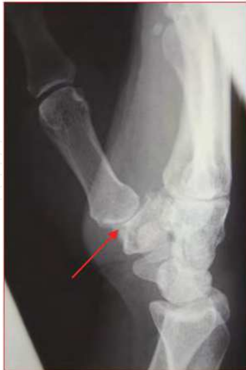
Fig. 7. Lateral Radiograph of Thumb CMC Arthritis

Surgical treatment should be considered when conservative measures have failed to relieve pain and improve day to day thumb function. Various options exist and it is therefore essential to engage the patient in an informed two-way discussion regarding the relative merits and drawbacks of each alternative. Patients with stage 1 or 2 disease have shown good outcomes with arthroscopy, metacarpal extension osteotomy, and volar ligament reconstruction. Arthroscopy is minimally invasive and allows for direct visualization of the articular surface and has been shown to be effective for the treatment of early osteoarthritis of the thumb CMC (Badia and Khanchandani 2007). Likewise, metacarpal extension osteotomy can correct the alignment of the thumb and transfer the load from the diseased palmar compartment to the normal dorsal compartment of the trapezium. (Pellegrini, Parentis et al. 1996) Eaton and Littler have well described a volar ligament reconstruction using part of the FCR tendon and have shown excellent results in 100% of patients with stage 1 and 82%-91% of patients with stage 2 disease. (Eaton, Lane et al. 1984; Freedman, Eaton et al. 2000).