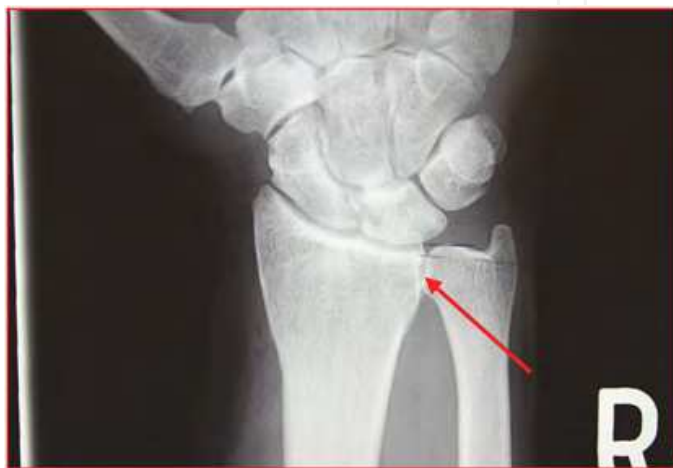
Fig. 5. PA Radiograph of Ulnar Impaction with an Ulnar -sided Lunate Cyst in Setting of DRUJ Arthritis

The differential diagnosis includes piso-triquetral and triquetro-hamate arthritis. The presence of a piano-key sign should be assessed in patients complaining of DRUJ pain (Scheker, 2009). The patient places their palms down on the examination table and pushes. The sign is present if the head of the ulna can be seen moving up and down. Such a finding is indicative of damage to the triangular fibrocartilage and is more common in rheumatoid arthritis as opposed to osteoarthritis. A second maneuver begins with the patient placing their elbows on the examination table with their forearms positioned perpendicular to the table's surface. Shear force is applied to the DRUJ. Any pain or displacement between the radius and ulna will indicate DRUJ instability. A third maneuver to be performed would be to apply shear force by pushing down on the patient's forearms while the patient pronates and supinates. Pain may be indicative of DRUJ incongruity and/or arthritis.