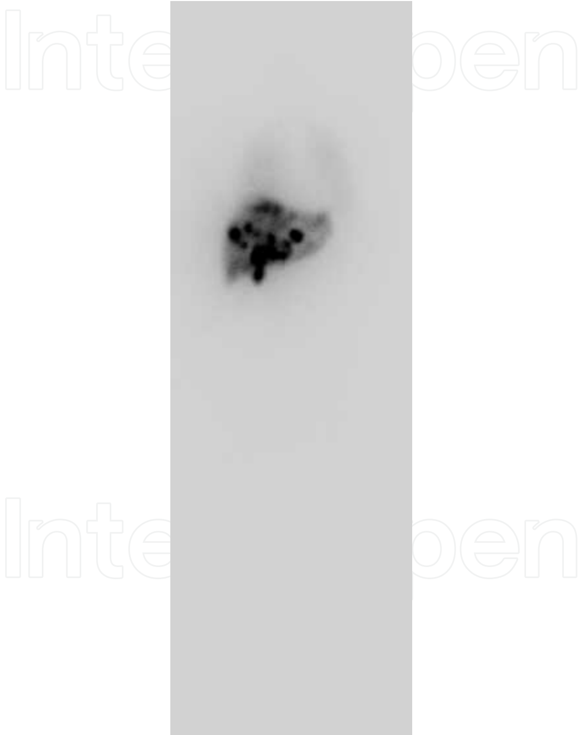
Fig. 1. Quantitative whole body scintigraphy obtained 7 days post therapeutic in a 52-year-old man showing significant activity in the HCCs and only a faint lung uptake.

small amounts of “cold” Lipiodol (Guerbet®). In patients with “normal” hepatic arterial anatomy the catheter can be positioned in the main hepatic artery for nonselective injection of 131 I-Lipiodol. In cases with multiple nodules or variable arterial blood supply, the liver lobe containing the largest tumour mass is treated in the first session and the remaining masses in the following ones.