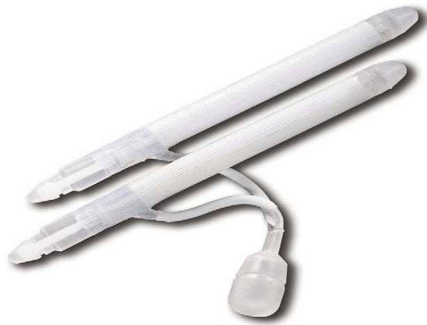
Fig. 1. AMS Ambicor two-piece inflatable penile prosthesis

inflatable. The only two-piece device currently available is AMS Ambicor(Fig.1). When this nondistensible device is deflated, the cylinders collapse and the penis, unlike that with a malleable prosthesis, is not rigid. When the scrotal pump is cycled, a small volume of fluid is transferred from the rear tips of the cylinders into the distal nondistensible chambers filling and then pressurizing them. Different from 3-piece inflatable prosthesis, Ambicor does not increase in size with inflation. Flaccidity and erection are more compromised with this model when compared with 3-piece device due to low, restricted reservoir volume. Also the device is not available with antibiotic impregnated forms as of yet, but has an acceptable short-term mechanical reliability (Levine LA 2001).