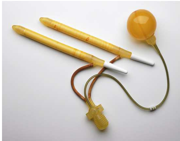
Fig. 3. AMS 700 CX inflatable penile prosthesis