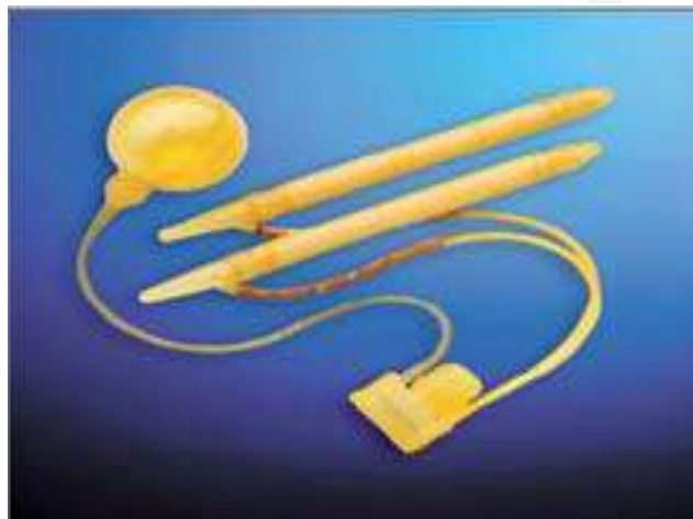
Fig. 5. AMS 700 MS™ series cylinder with InhibiZone® antibiotic surface treatment. AMS = American Medical Systems.

impaired antibiotic penetration due to capsule formation, and decreased wound healing related to scarring. Most bacteria produce a mucin coat or biofilm that is the bacterial colonisation over the device and resistant to systemic antibiotic treatment due to decreased metabolic needs (Silverstein A, et al 2003). Antibiotics or the body's defense mechanisms can not eradicate the bacteria inside the biofilm without removing all prosthetic components and irrigation of the implant spaces (Stewart et al 2001). Both manufacturers developed advances in the designs of prosthesis in order to decrease the incidence of infections by applying coatings to the prosthesis designed to retard bacterial growth. In 2001, AMS introduced InhibiZone™ (Fig. 5) which is a patented antibiotic surface treatment that impregnates minocycline and rifampin into the external silicone surfaces of all the components, except the RTE, giving the orange-like color.