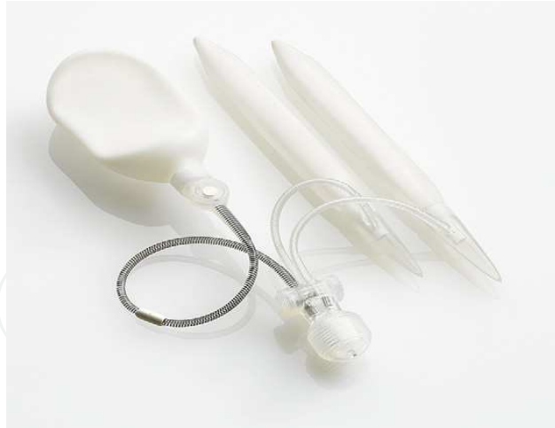
Fig. 2. Hydrophilic-coated Coloplast Titan™ threepiece prosthesis with reservoir lock-out valve to minimize autoinflation