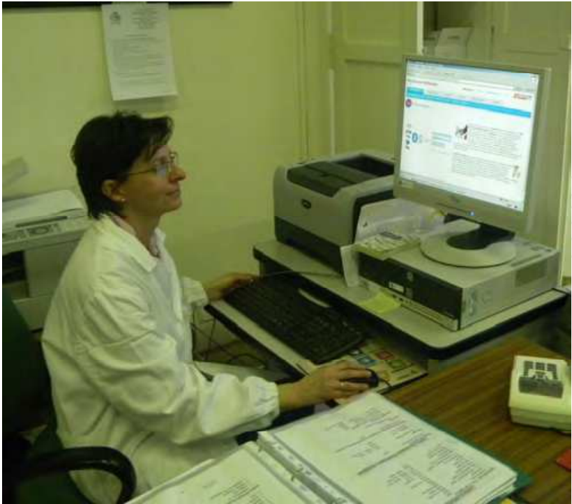
Fig. 4. MyDoctor@Home: Computer work station at HHS office