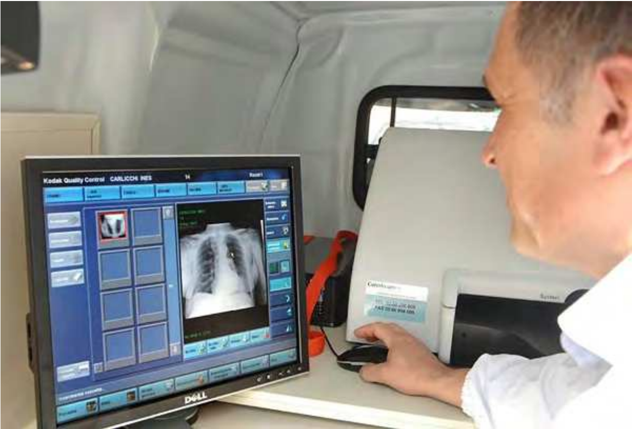
Fig. 6. Mobile tele-radiology station: computed radiography system