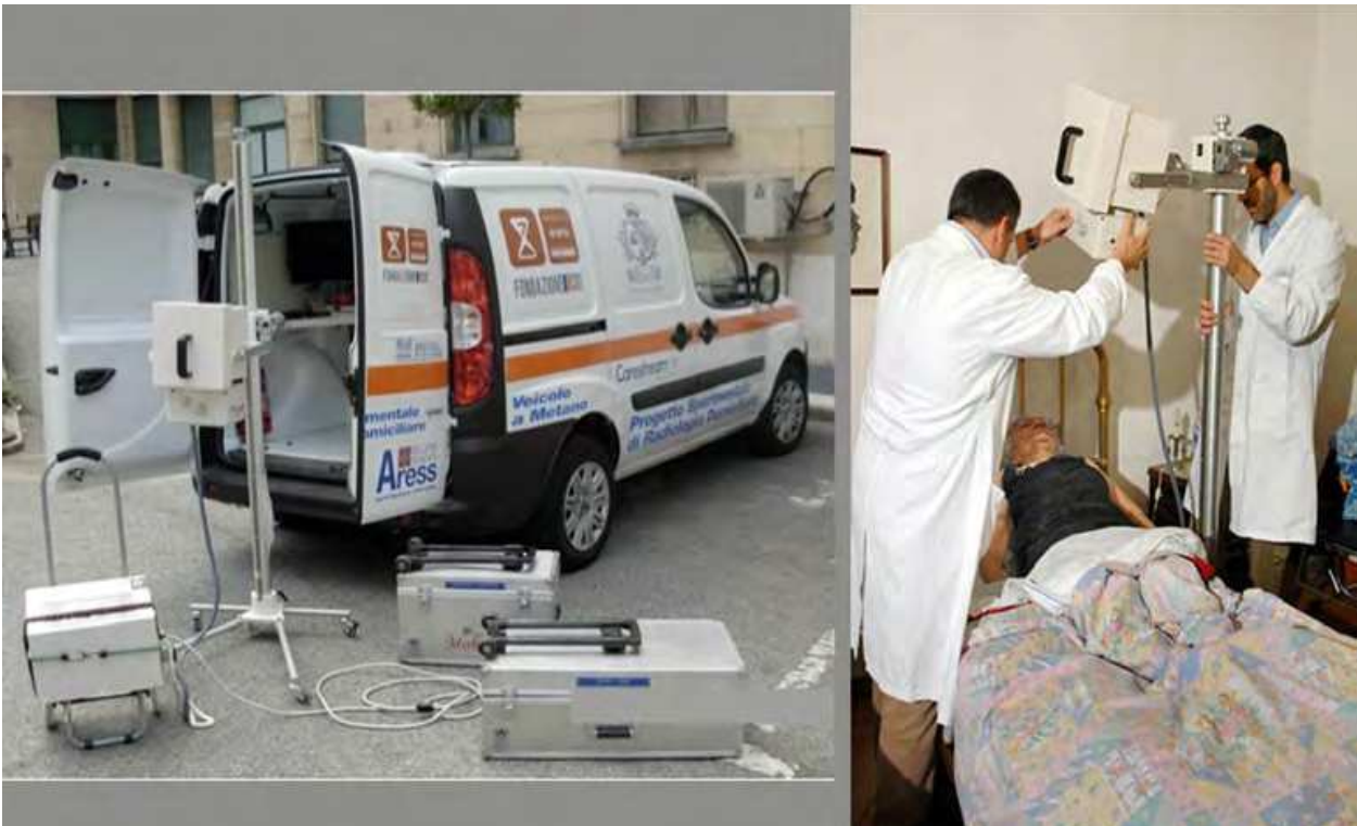
Fig. 5. Mobile tele-radiology station: equipment and Radiology Technicians at patient's home