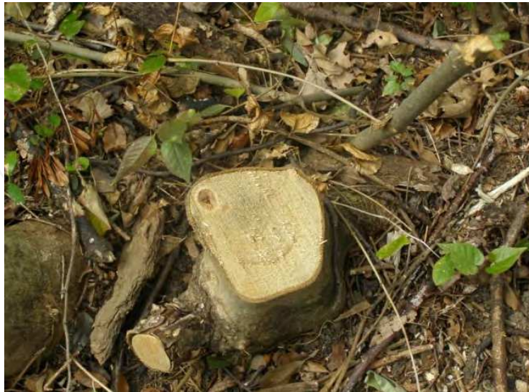
Photo 9. Treated stumps by glyphosate

Triclopyr – is used for oak stump shoots control in the ration of 1:5 or 1:10 for other broadleaved species. The best way is to treat stumps immediately after cutting, but it can be done until the shoots emerge. It can be performed during entire year, except during freezing.