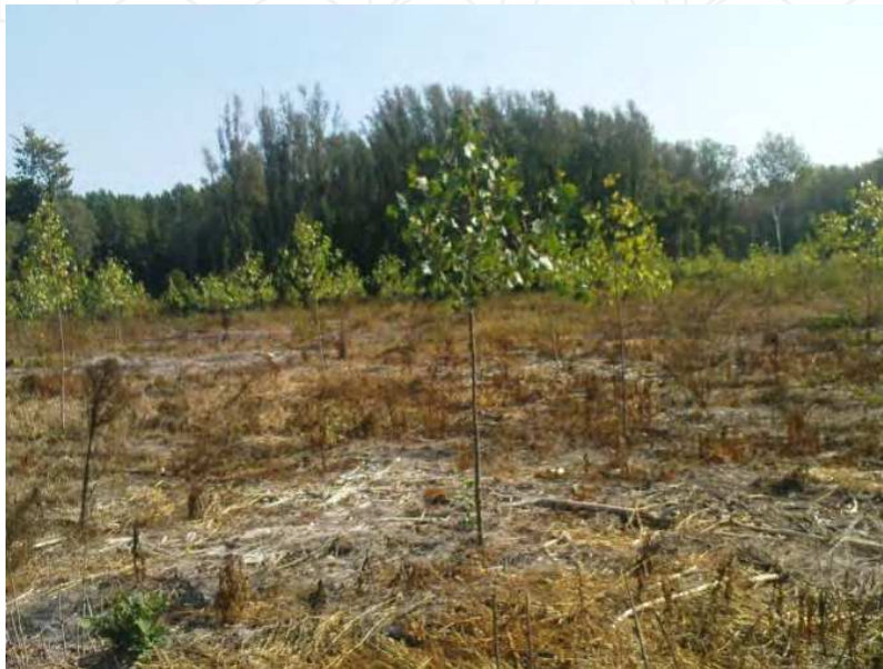
Photo 7. Efficiency of herbicide glyphosate in poplar plantation

Glyphosate – is used for complete weed control during the stage of intensive growth and concentration of 2-3%. Its efficacy on weeds is high due to good translocation into root and rhizomes. Side shoots, if present, should be removed prior to treatment with glyphosate because the preparations based on glyphosate should not reach the leaves of nursery plants (Photo 7 and 8). Glyphosate is used for treating stumps in order to prevent emergence of shoots from stumps. Concentration of 10-15% is applied immediately after cutting, but the treatment may be applied until shoots appear from May through October (Photo 9 and 10).