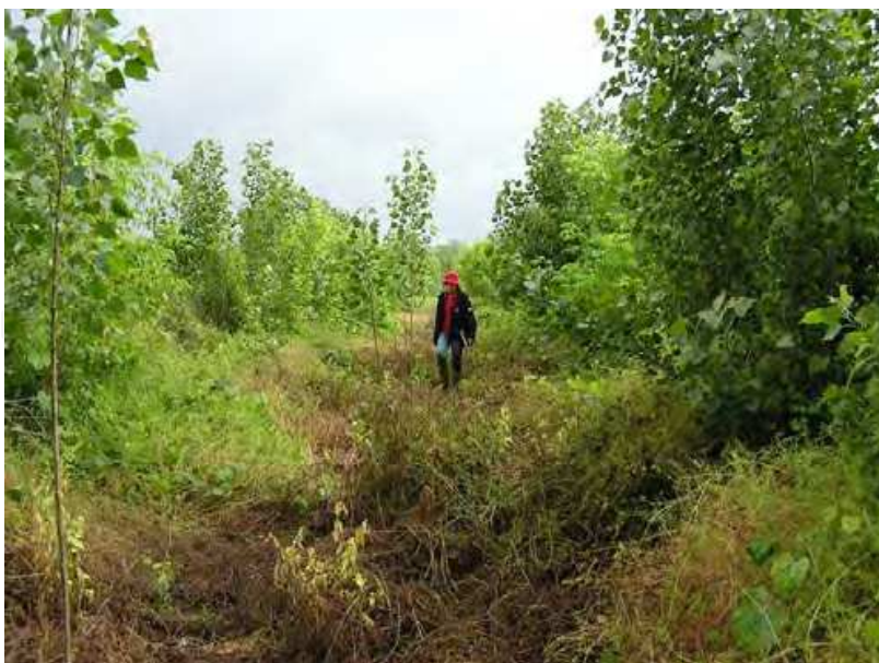
Photo 8. Inter-row application of herbicide glyphosate in the plantation

Glufosinate - ammonium – is used as non-selective, contact herbicide for control of weeds in forest plantations. It is applied in quantity of 4 -7,5 l/ha with water consumption of 400-600 l/ha.