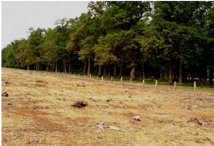
Photo 11. Application herbicides glyphosate after sowing and before emergence of cultivated plants ( Quercus robur )

The most often encountered problem in pedunculate oak forest renovation is Rubus caesius L. (European dewberry) forming impenetrable thickets. Besides blackberry, Crataegus monogyna , C.oxycantha , and Rosa arvensis may also pose a problem although significantly smaller. Also, if the shoots from stumps are not suppressed they can reach the height of up to 1,5 m, and blackberry and other weeds form thick cover, then the chemical control is difficult to perform due to impenetrability and requires a much higher expenditure of funds.