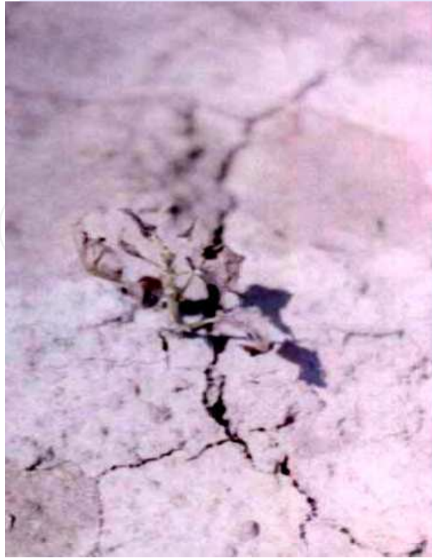
Photo 2. Phytotoxic effect of n poplar seedling ( Populus euramericana , Populus deltoides )