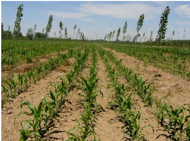
Photo 5. Inter-row sown corn in the poplar plantation