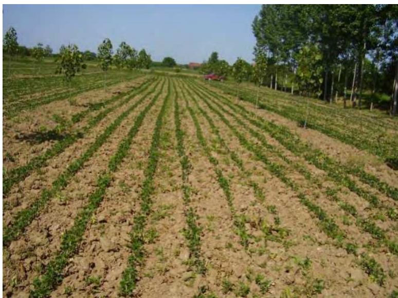
Photo 6. Inter-row sown soybeans in the poplar plantation