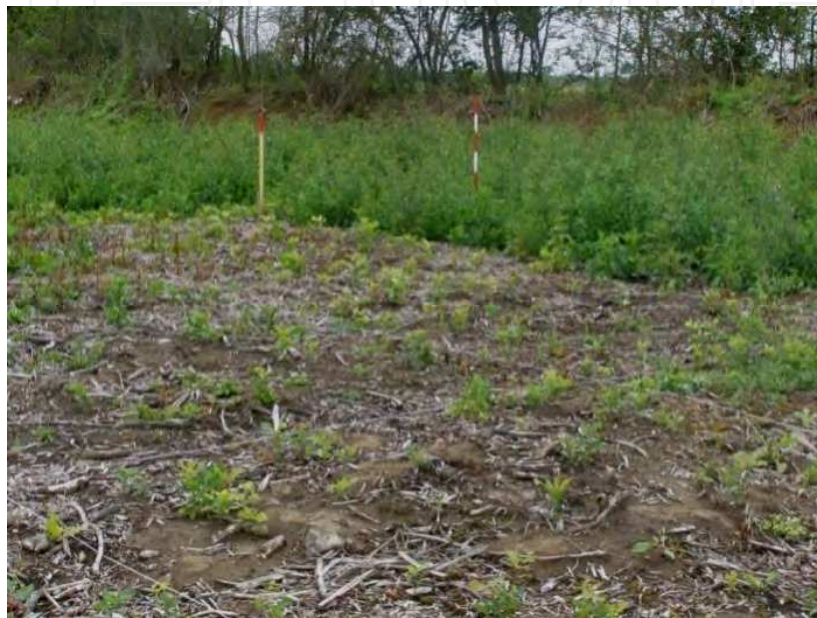
Photo 13. Efficiency of herbicides in artificial regeneration of pedunculate oak forest

Glufosinate - ammonium – is used as a nonselective, contact herbicide for weed control on areas planed for sowing or planting, and on areas where sowing or planting have already been done, and prior to appearance of cultivated or nursery plants. It is applied in quantity of 4 – 7,5 l/ha, with water consumption of 400-600 l/ha.