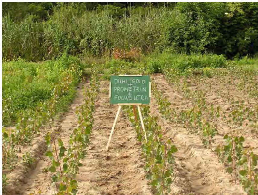
Photo 3. Efficiency of herbicides in nursery production of poplar plants ( Populus euramericana , Populus deltoides )

Pendimethalin – is used for control of many annual grass weeds in production of poplar ( Populus euramericana , Populus deltoides ) nursery plants. It is applied after sowing or planting in quantity of 4 – 6 l/ha depending on soil.