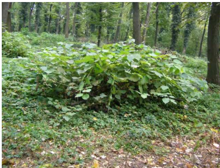
Photo 10. Non treated stumps