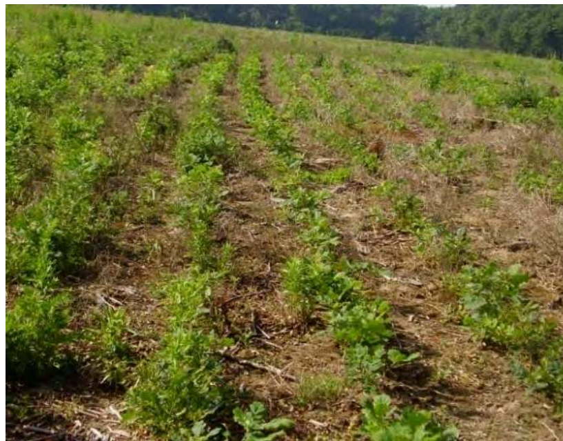
Photo 14. Efficiency of herbicide clopyralid (Lontrel-100) in regeneration of pedunculate oak forest