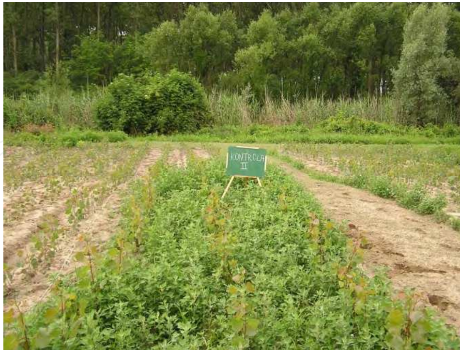
Photo 4. Control plot

S-metolachlor – registered rate is 1,2 – 1,5 l/ha after sowing or planting, and before emergence of weeds and cultivated plants. It is used for control of annual grass and broadleaf weeds in production of poplar ( Populus euramericana , Populus deltoides ), black locust ( Robinia pseudoacacia ), willow ( Salix sp.) and oak ( Quercus robur ) nursery plants.