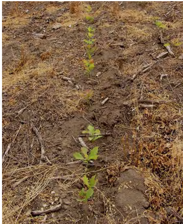
Photo 12. Emergence of oak plants after application of total herbicide