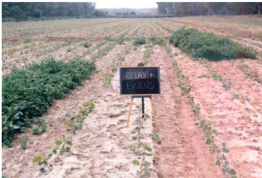
Photo 1. Efficiency of combination of herbicides Acetochlor (Relay plus) and Azafenidin (Evolus 80-WG) in nursery production of poplar ( Populus euramericana , Populus deltoides )

Linuron - is used for soil treatment after sowing or planting, and before emergence of cultivated plants. It is applied in quantity of 2 l/ha in production of poplar ( Populus euramericana , Populus deltoides ), willow ( Salix sp.) and oak ( Quercus robur ).