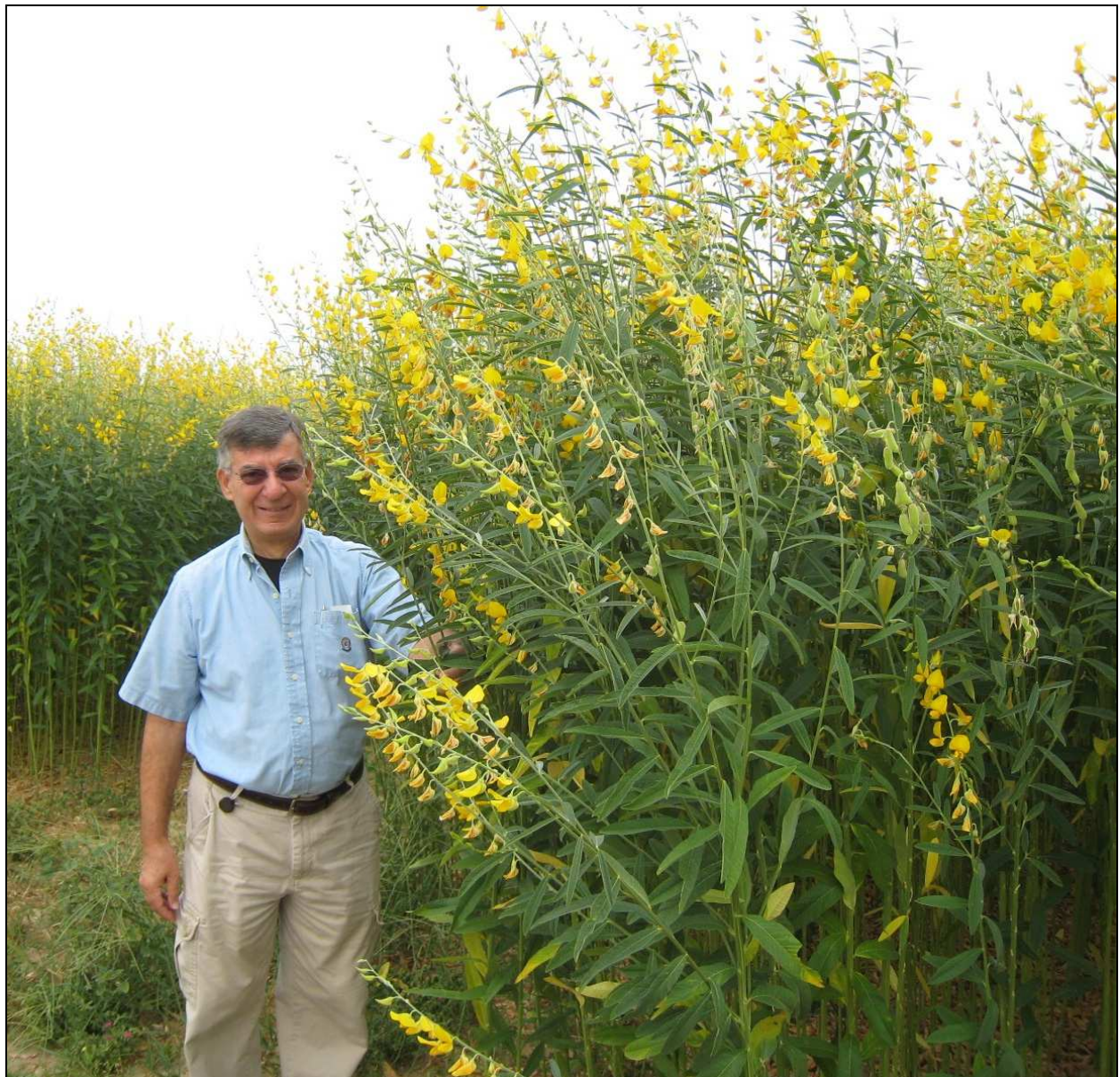
Fig. 2. The vigorous growth of sunn hemp cultivars developed at Auburn University, Alabama, can be seen here, 70 days after planting.