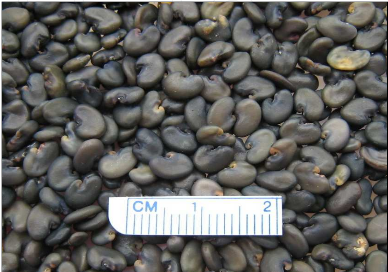
Fig. 3. Sunn hemp seed production can yield 450 to 1000 kg of seed per hectare.

production typically requires a longer season than can be achieved before winter conditions in temperate regions (Li et al. 2009)(sunn hemp seed pictured in Figure 3). The lack of seed production outside of tropical and subtropical climates severely limits seed availability to producers in cooler climates. Moreover, with seed costs ranging from $90 to $130 (US) per hectare, implementation of C. juncea as a cover crop can be an expensive task for growers (Li et al. 2009; Petcher 2009).