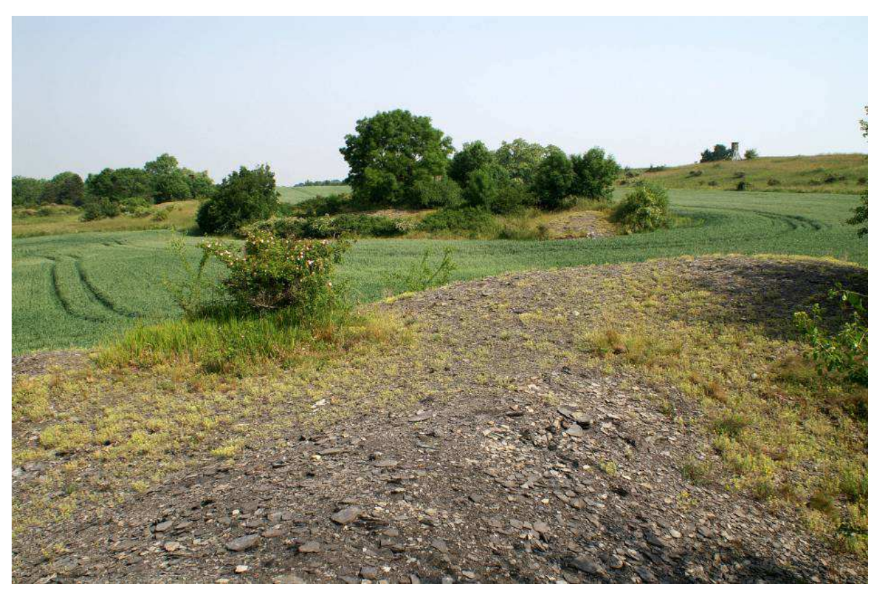
Fig. 4. Spoil heaps of the medieval copper shale mining as secondary metalliferous sites in Central Germany (Dobis, photograph: H. Baumbach, May 2008).

The post-mining landscape consists (state March 2011): in the Mansfeld mining district of 1028 small and 56 large spoil heaps (of which 8 and 12 are slag heaps, respectively), and in the Sangerhausen mining district of 416 small and 9 large spoil heaps (of which 3 and 1 are slag heaps, respectively). Thereby it has to be considered that 60-70 % of the small spoil heaps in the Mansfeld mining district were already destroyed by land burial between 1850 and 1910 (Oertel, 2002). Due to the large amount of metalliferous sites originating in the former copper-mining activities the federal state of Saxony-Anhalt has a particular responsibility towards the preservation of the habitat type 6130. Therefore, three Natura 2000 sites with the habitat type 6130 as the main conservation objective, located in the post-mining landscape of the old mines, have been designated (Tab. 3). The total size of these sites is about 687 ha. From this area 137 hectares (19.9 %) are copper-shale spoil heaps with only 21.8 hectares (3.2 %) of calaminarian grassland. Unfortunately, a comprehensive conservation strategy for these sites is not available to date.