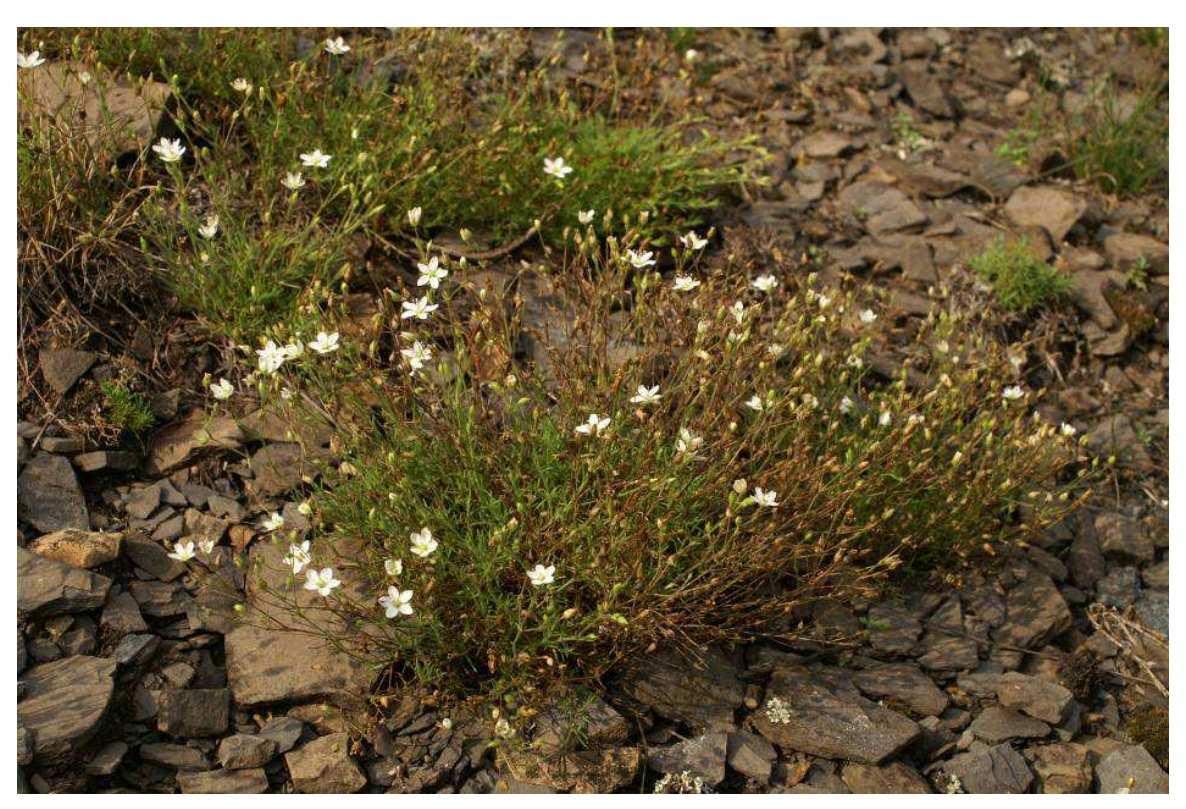
Fig. 2. Minuartia verna , one of the character species of metallicolous vegetation in Central Europe, is critically endangered in some regions due to the loss of habitats.

Minuartia verna is one of the central European character species of metalliferous soil sites that has been considered as glacial relic and therefore paleo-endemics (Schulz, 1912; Schubert, 1954a; Heimans, 1961; Ernst, 1974). Due to the large morphological variation within the Minuartia verna-complex several of the described subspecies and varieties (e. g. Graebner, 1919, Hayek, 1922; Mattfeld, 1922; Halliday, 1964) can only be delineated bio-geographically or edaphically. The necessity of a critical revision of the Minuartia verna-complex has already been postulated by Ernst (1974), nevertheless this revision still is lacking.