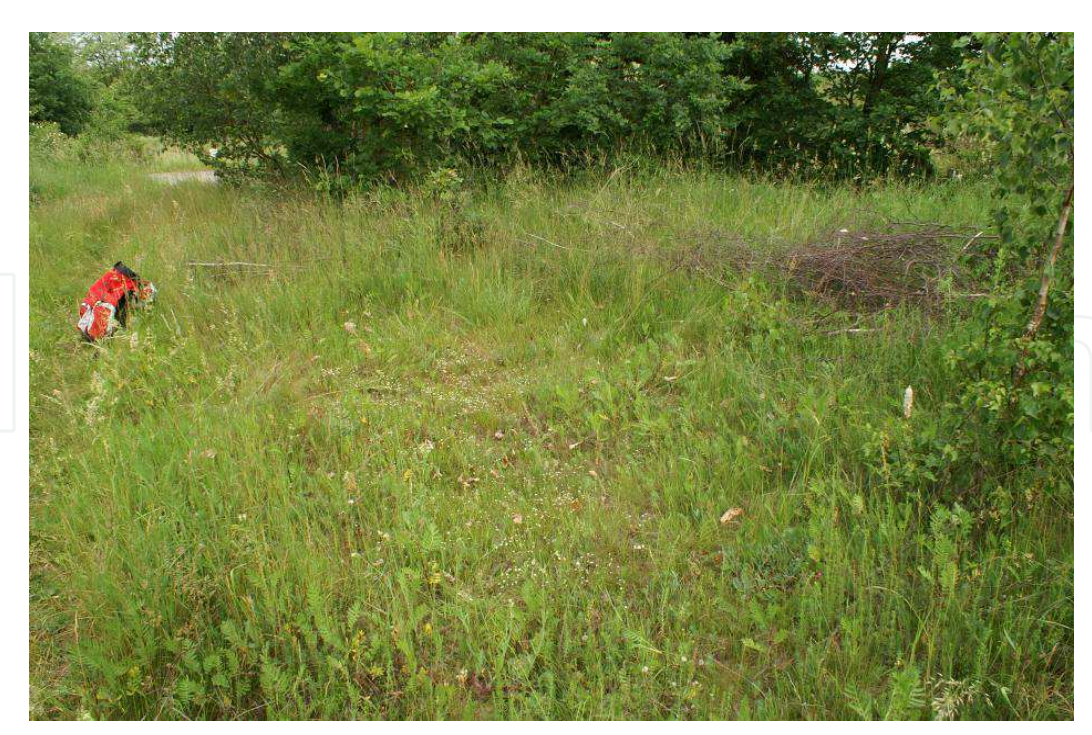
Fig. 5. Primary metalliferous site near Blankenheim (Saxony-Anhalt, Central Germany). This small site is critically endangered by shading and litter input from the surrounding grassland (photograph: H. Baumbach, June 2006).

A third site, located in the east of the village of Blankenheim, was accidentally discovered in 1999 (Fig. 5). The site is subdivided into 5 subareas with a size of only some square metres each (Tab. 4). The soil layer is only 25 cm thick and covers an outcrop of metalliferous sandore. Obviously this site was never disturbed by mining activities because sand-ores were not suitable for smelting. Furthermore, this site is located outside the former active mining area. To date this very small site has no conservational state. It is critically endangered by shading and litter input from the surrounding grassland (Arrhenatheretum) and by accidental destruction. The genotypes of the Minuartia verna -population growing at this site have both characters of the alpine populations and characters of the spoil heap populations (Baumbach, 2005). This indicates that the M. verna -population has survived on this site since the last ice age and is therefore a real paleo-endemic.