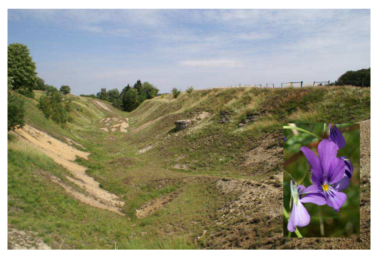
Fig. 3. Old lead-zinc opencast mining near Blankenrode (Germany), type locality of Viola guestphalica (small picture), the Westfalian zinc violet.

Cardaminopsis halleri (L.) HAYEK (Brassicaceae) is a wide-spread pseudo-metallophyte which occurs at metalliferous and non metalliferous sites (meadows, watersides, rocks). The genetic structure of 28 metallicolous and non-metalicolous populations with a total of 625 individuals was studied by Pauwels et al. (2005) using PCR-RFLP on chloroplast DNA (cpDNA). Eleven distinct chlorotypes were found: five were common to non-metallicolous and metallicolous populations, whereas six were only observed in one edaphic type (five in non-metallicolous and one in metallicolous). No difference in chlorotype diversity between edaphic types was detected. Computed on the basis of chlorotype frequencies, the level of population differentiation was high but remained the same when taking into account levels of molecular divergence between chlorotypes. Isolation by distance was largely responsible for population differentiation. As it was the case in Silene vulgaris (Baumbach, 2005) geographically isolated groups of metallicolous populations were more genetically related to their closest non-metallicolous populations than to each other. These results suggest that metallicolous populations have been established separately from distinct non-metallicolous populations without suffering founding events and that the evolution towards increased tolerance observed in the distinct metallicolous population groups occurred independently.