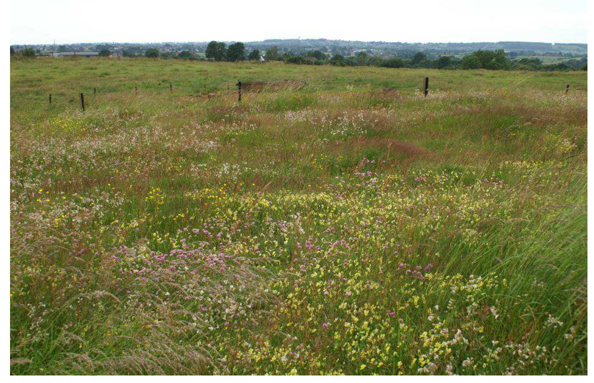
Fig. 1. Metallicolous vegetation with the character species Armeria maritima , Viola calaminaria , Minuartia verna and Silene vulgaris near Rabotrath (Belgium, photograph: H. Baumbach, June 2008).

copper-shale mining region of Mansfeld and Sangerhausen (the eastern Harz Mountains foothills region, Saxony-Anhalt, Central Germany). Despite the legal protection and several conservation efforts, the number of metalliferous soil sites with their unique flora has decreased in several regions substantially. Therefore, I want to encourage a supra-regional conservation strategy for Central European metalliferous sites.