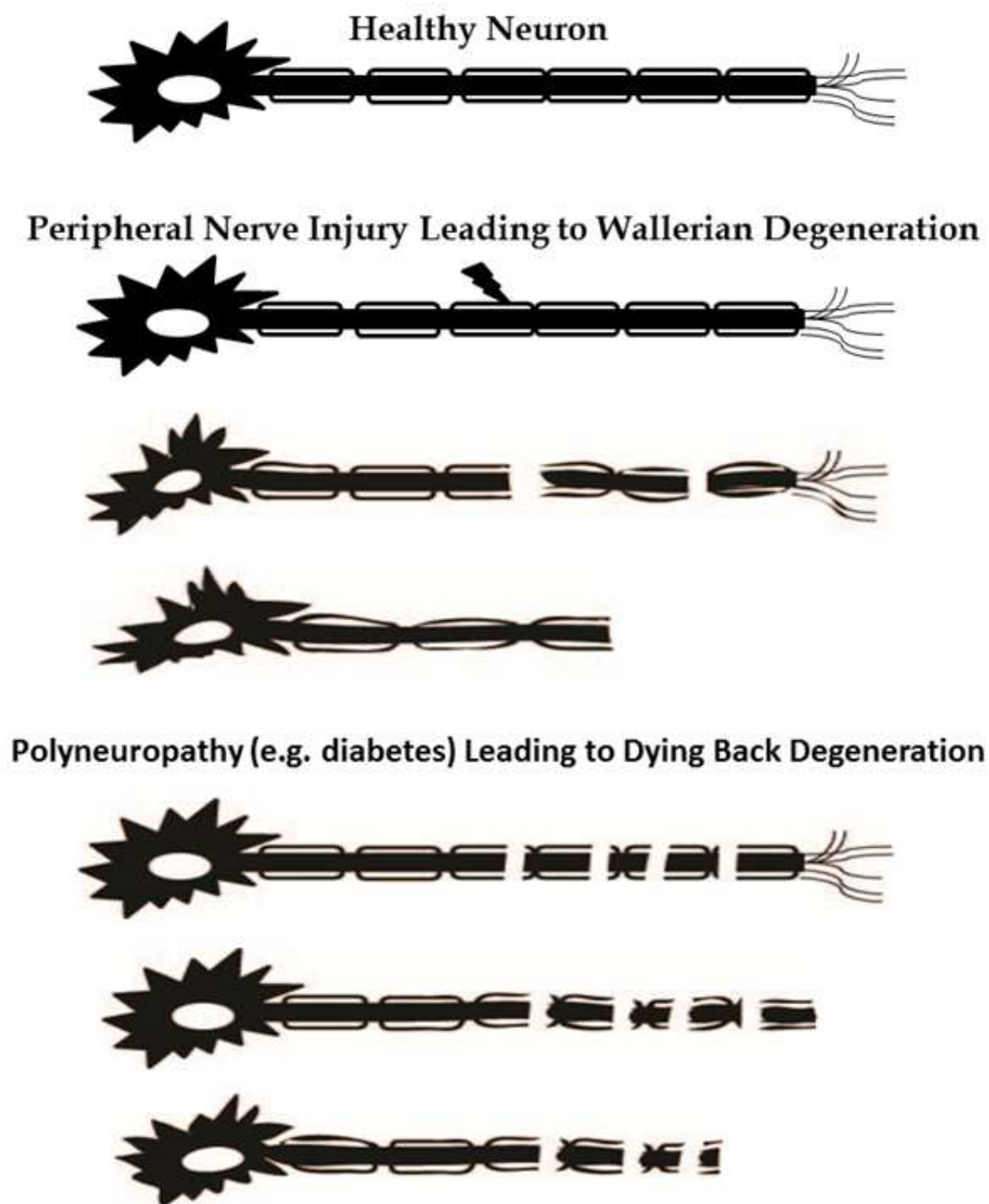
Fig. 1. Comparison of Wallerian and “Dying Back” degeneration in neurons.