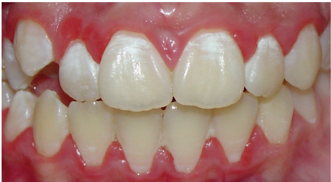
Fig. 4. The clinical appearance of carious lesions known as white spots. Note the opaque aspect of the lesions, the curved shapes close to the gingival margin. These are some of the points to consider that these white lesions are not related to dental fluorosis. In addition, the lesions are limited to gingival margin. The patient has also gingivitis in a clear indication that these are active carious lesions. The final diagnosis is confirmed by the fact that the patient did not live in areas with water fluoridation systems and avoided the use of fluoride toothpaste since childhood

During the examination for dental fluorosis, the enamel surface must be clean and dry. When the enamel surface is dried, the water in the enamel pores will be replaced by air. Hence, even slight enamel opacities can be observed. This procedure, which is used for scoring fluorosis with a fluorosis index (Dean index or Thylstrup and Fejerskov index), can classify dental fluorosis on different degrees, and differentiate fluorosis from other enamel opacities (Murray et al., 1991).