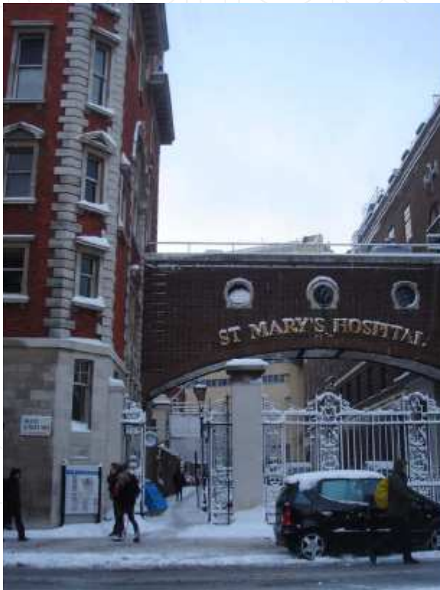
Fig. 2. Actual image of the St.Mary's Hospital in London, UK. Wright directed the former Inoculation Department of this hospital, devoted to administer the vaccines therapeutically.

Therapeutical vaccinations also lead him to the observation of an immediate aggravation of the patient's condition, what he called the "Negative Phase" (Wright 1902).