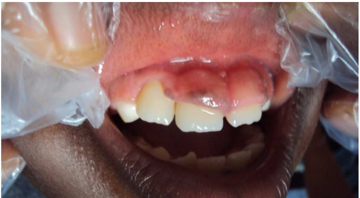
Fig. 7b. Post-operative appearance after excision of hyperplastic mass and removal of plaque