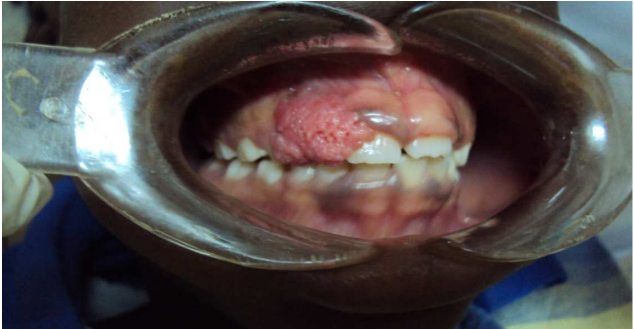
Fig. 7a. Hyperplastic gingivae and generalized gingivitis in a 7 year old boy on carbamazepine for epilepsy

children with severe mental retardation as compared with healthy children, in spite of similar frequencies of dental care (Forsberg, 1985). This has been attributed to their lack of cooperation during tooth brushing at home and during treatment. A lot of patience is required by parents and care givers in order to provide effective home oral hygiene care for this group of individuals. Oral health education is also desirable to create awareness of need for good oral health for all individuals, irrespective of age and mental status.