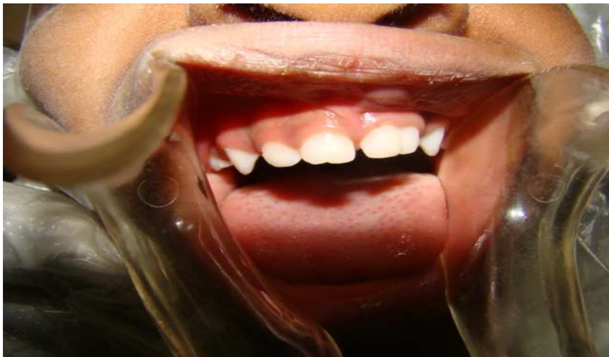
Fig. 1. Gingivitis of the anterior maxillary teeth in a four year old boy

Poor oral hygiene and gingivitis have been reported to be more prevalent in children with cognitive and developmental disabilities. The Oral Hygiene Index (OHI) scores have been found to be higher in children and adolescents with disabilities than in control groups in studies carried out in some developing countries (Oredugba, 2006; Oredugba & Akindayomi, 2008; Nahar et al, 2010). In the study carried out in Bangladesh, as many as 64% of those with disabilities had gingivitis compared with 27.5% of controls. The prevalence of gingivitis has also been found to be influenced by other demographic factors such as place of residence, age and severity of disability and cognition.