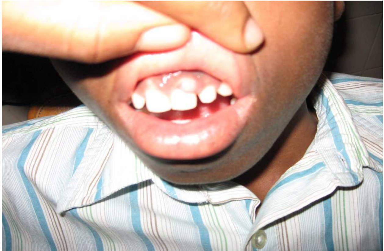
Fig. 2. Gingivitis in a nine year old boy due to mouth breathing

children and wards (Meyer et al, 2010). This is especially so in those with intellectual disabilities and the very young children.