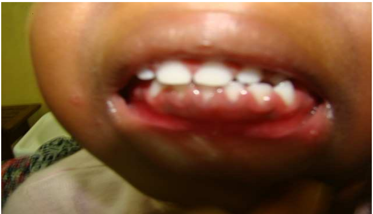
Fig. 3. Acute herpetic gingivostomatitis in a 2 1/2 year old girl

The condition is self limiting and the management is to encourage bed rest, plenty of fluid and maintenance of good oral hygiene through gentle debridement. Analgesics are prescribed to relieve the pain and antibiotics are useful in preventing superimposed bacterial infection. The application of a mild topical anaesthetic gel has been found useful in young children and reduces irritability.