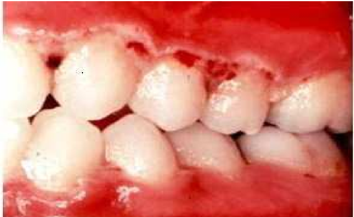
Fig. 5. Advanced stage of acute necrotizing ulcerative gingivitis