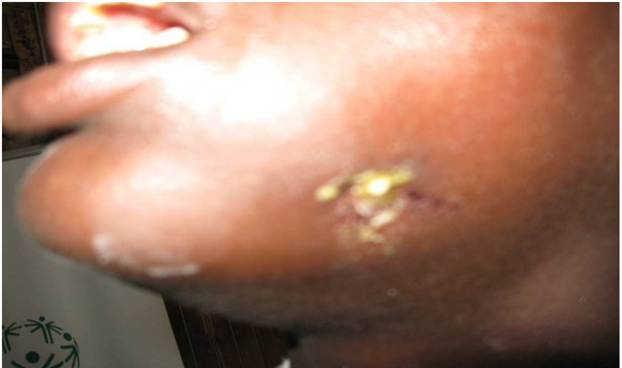
Fig. 6. Cancrum oris in a 14 year old boy

It occurs with low frequency (<1%) in children in developed countries but still seen in higher proportions (2-5%) in children and adolescents in developing countries in Africa, Asia and South America. It is also frequently seen in children and adolescents with