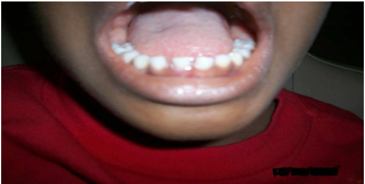
Fig. 8b. Clinical appearance after administration of Factor VIII and removal of plaque