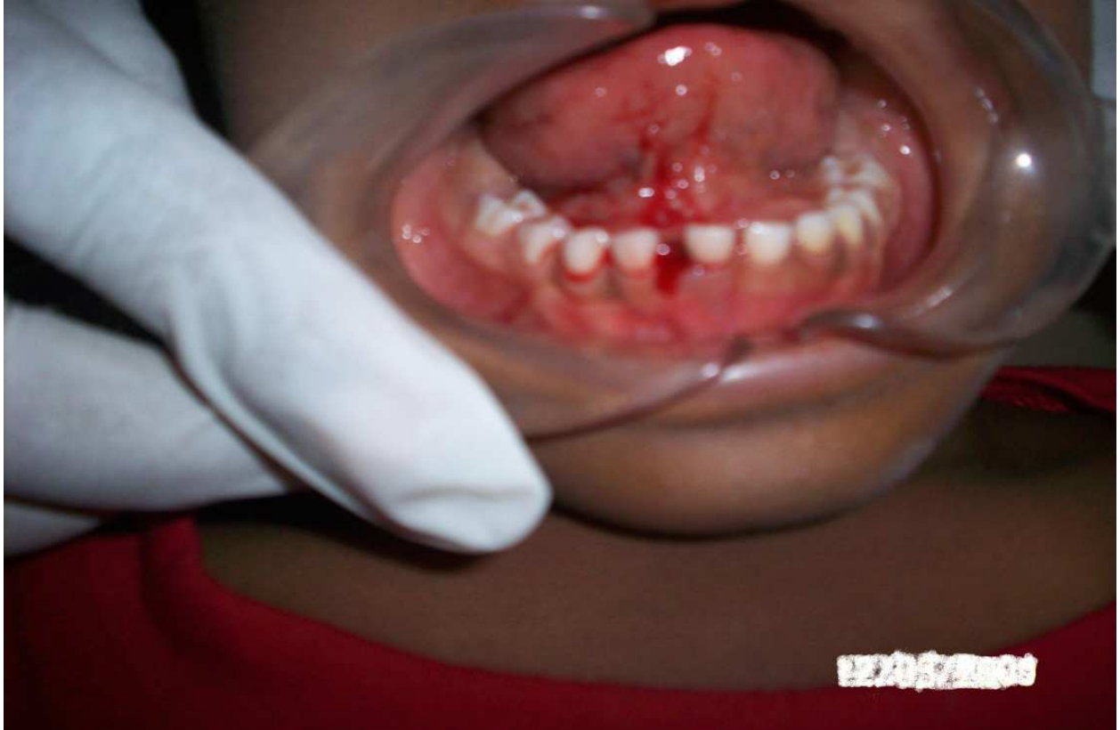
Fig. 8a. Gingival bleeding and gingivitis associated with plaque accumulation in a 3 year old haemophiliac ( Reproduced with permission from Nigerian Dental Journal, 2010, Vol.18,1 )

the first time during exfoliation of primary teeth and eruption of the first set of permanent teeth (Figs 8a & 8b).