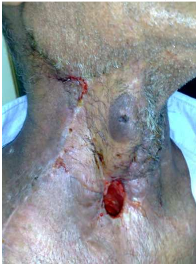
Fig. 2. Pectoralis major flap for coverage of exposed carotid artery

Complications involving the common carotid artery are the most feared sequelae of neck surgery. Acute postoperative carotid artery rupture, or "blow out" occurs in 3% to 4% of radical neck dissection and associated with a mortality rate of 50%. Factors associated with carotid artery hemorrhage include wound breakdown, necrosis, and infection, pharyngocutaneous fistula, prior radiation therapy, tumor involvement of the arterial wall. Tumor invasion of the carotid artery is a relatively uncommon event of advanced aggressive disease or revision surgery for a recurrent neck mass(4).when wound dehiscence results in the exposure of the carotid artery,it is more ominous, and its management more critical.(fig2)