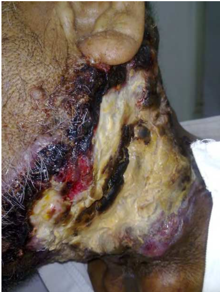
Fig. 1. Wound infection and necrosis

on the SCM during flap elevation, and the decision of whether to preserve it can be made later. Sacrifice of this nerve during neck dissection leads to a sensory deficit of the auricle that usually diminishes with time. Neuroma of divided greater auricular nerve can occur(10).