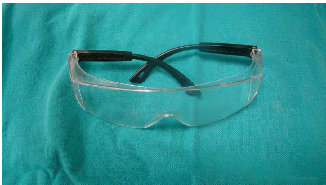
Fig. 2. Protective eyewear should be worn during the procedure

Contact of blood and saliva of patients with dentists' eyes and airways and contamination with aerosols formed during dental procedures is inevitable if proper precautions are not taken. A mask and a protective eyewear must be used during all applications (Figure 2, Figure 3).