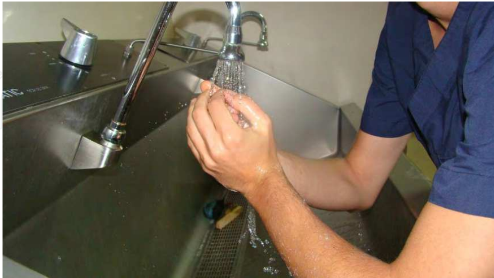
Fig. 1. Hands should be washed before and after all procedure.

publications hands must be washed with antimicrobial soaps before and after invasive procedures performed on patients. At times when washing hands is not an option, application of water-free antiseptics is recommended.