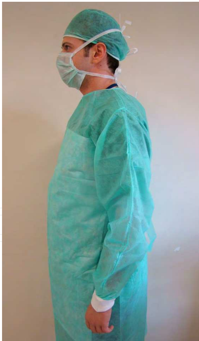
Fig. 4. Protective clothing should be utilized instead of daily clothing.

Protective clothing should be utilized instead of daily clothing (Figure 4). Whenever the clinician is to deal with patients with contagious diseases, he/she should prefer long-sleeved protective clothing. This way, contact of pathogens with skin can be avoided. In case the clothing gets wet, they should be changed immediately with new ones and should be taken off when the clinician is to leave the operation area.