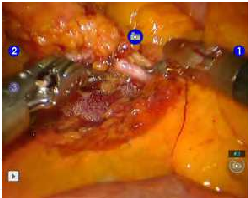
Fig. 2. Intraoperative view: Ileocolic vessels

The procedure begins by grasping upward and laterally the mesentery of the last ileal loop. This maneuver, performed with the forceps mounted on the fourth arm, enhances the prominence of the ileocolic vessels and provides stable and durable retraction. The peritoneal layer of the mesentery is incised just below this salience, and an accurate lymphadenectomy is performed along the superior mesenteric axis. Then, the ileocolic vessels are isolated and separately ligated and sectioned (fig. 2).