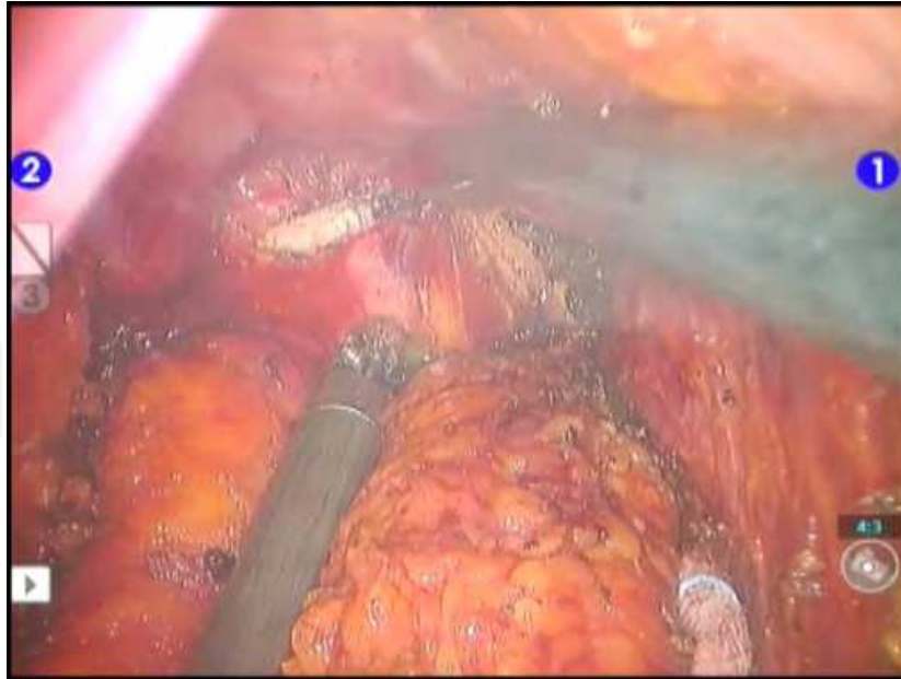
Fig. 5. Intraoperative view: Incision of Denonvillier's Fascia.

The dissection thus continues distal to the rectoprostatic (or rectovaginal) septum: the anterior mesorectal excision is completed, and the rectum is exposed anteriorly to the anorectal junction. A gentle traction of the rectum takes place laterally by a Cadieere on the arm #1, on either side, and the dissection is performed by the electrocautery hook until reaching the lateral ligaments of the rectum (LLR). At this level, the dissection is carried out close to the rectum, in order to avoid the injury of the inferior hypogastric plexus (IHP). The dissection must include only the rectal branches from the IHP and the small rectal branches from the middle rectal artery (MRA) (fig. 6).