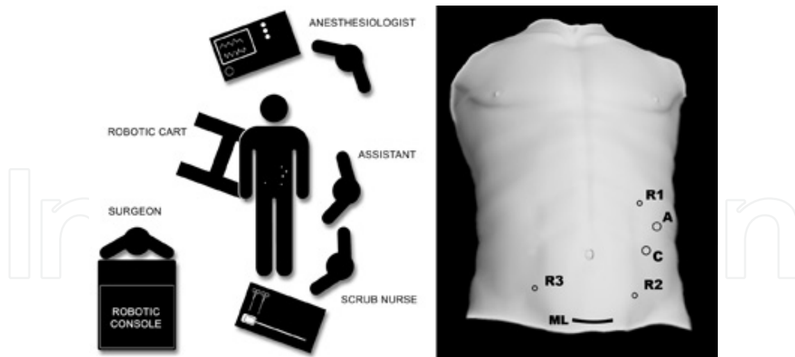
Fig. 1. Operating room setup and trocars position

Patient is placed in supine reverse Trendelenburg position ( 15^\circ to 20^\circ ), with 10^\circ to 15^\circ left lateral rotation and shoulder supports. The legs are secured at the thigh and calf with straps. The table is tilted to the left to allow the small intestine to fall off from the midline. The assistant surgeon stands on the patient's left side. The robotic cart is approached from the patient's right side. The operating room scheme is shown in fig. 1.