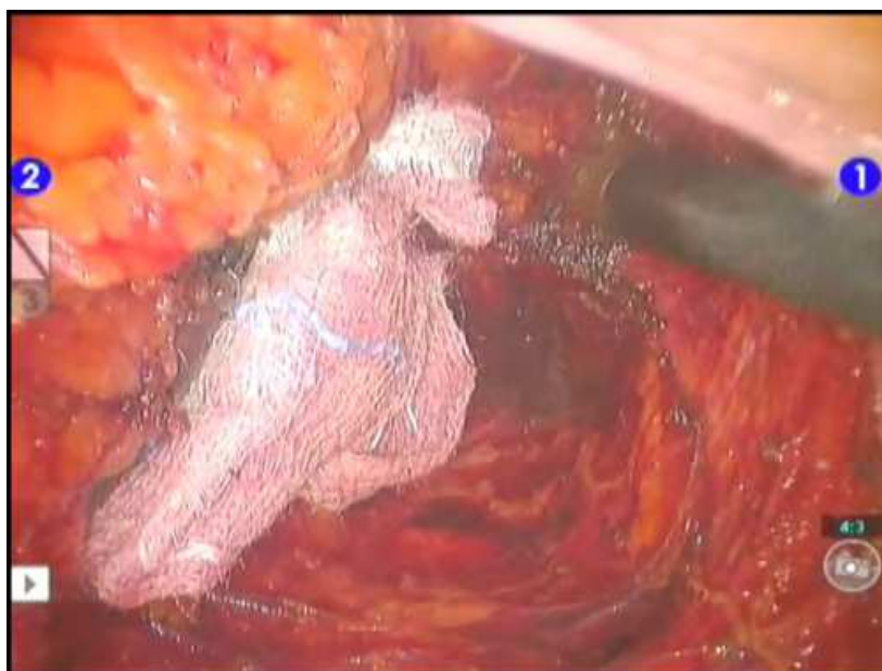
Fig. 6. Intraoperative view: lateral dissection of the rectum

The total mesorectal excision (TME) is finally completed and the rectum is sectioned at its distal end by linear stapler.