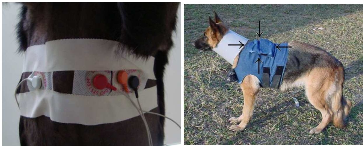
Fig. 1. Left side of the figure - Animal with electrodes attached to the chest for the conduct of examination by equipment with four electrodes (See the text for more details). Note the shaved area with the setting of adhesives and the coupling of electrodes. Right side of the figure - Dog using cervical collar and being subjected to examination. Note that the device is packed in the side pocket of its waistcoat (arrows).

In equipment with four electrodes (Cardioflash® or Cardiolight®: www.cardios.com.br ), the local standard ECG precordial examination can be adapted for CE as follows: position of red electrode in V2 place (sixth left intercostal space adjacent to the sternum), black in V4 (sixth left intercostal space in the costochondral junction location), orange electrode between black and red, and white electrode in the V1 position of conventional ECG (fifth right intercostal space near the sternum), as shown in figure 1.