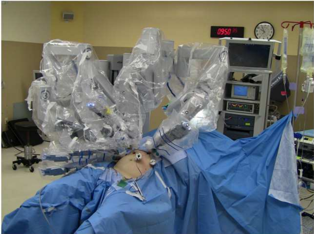
Fig. 2. Robotic platform docked off patient's right shoulder in 10 degree reverse Trendelenburg position, and 10 degree rotation to left.

It has been demonstrated that minimally invasive surgery is associated with less blood loss, shorter hospital stay, less post operative pain, improved cosmesis, and faster recovery compared to traditional approaches (32), (33). 10 cases were reported with an operative time of 207 minutes, blood loss of 355 cc and nodal yield of 27 (34). It was observed that the operative time in robotic radical hysterectomy was 241 minutes and blood loss of 71 cc, and no conversion to laparotomy reported (35).