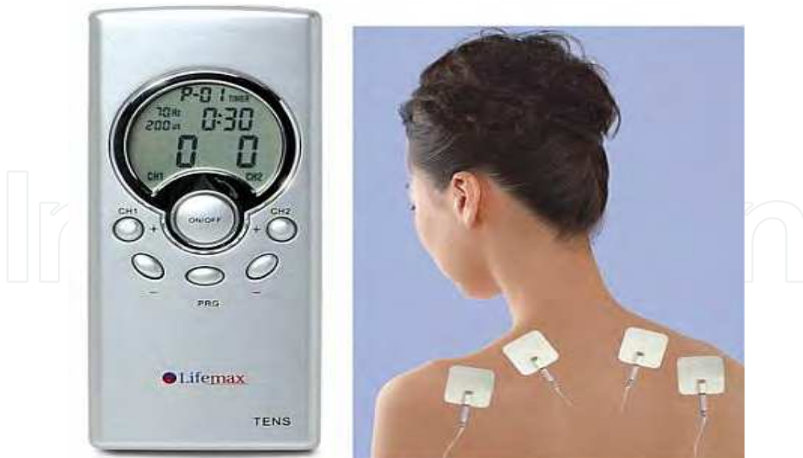
Fig. 1. TENS Machine with electrodes placement