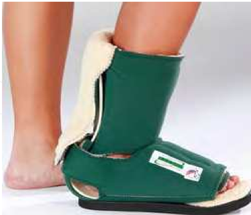
Fig. 4. Ankle Foot Orthosis

Orthotic devices are needed during early onset of sport injuries in order to provide rest and support for the damaged structures especially joints. The devices provide support, or correct deformities and improve the movement of joints, spine, or limbs. They also provide stability of joints by limiting abnormal or excessive joint mobility. Excessive movement can worsen the injured parts and increase the pain. Knee and Ankle joints are more prone to injury than any other joints in the body. Ankle foot orthosis is commonly used to protect the ankle joints at acute stage (Figure 4).