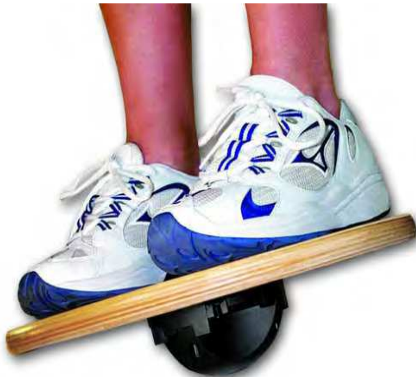
Fig. 3. Wobble Board

All these exercises have been found to bring about relief of pain with or without any other therapeutic analgesic modalities (Adedoyin et al, 2009).