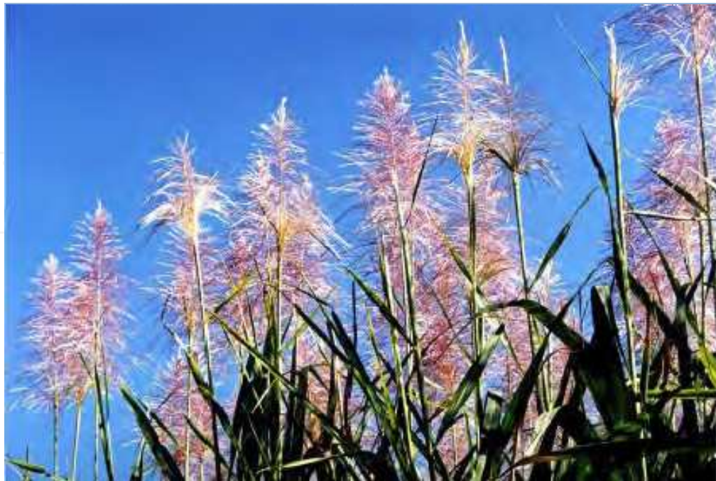
Fig. 1. Flowering of sugarcane.

Another aspect refers to the phenomenon of the pith process (Fig. 2) related to the flowering and ripening of sugarcane, which occurs in some varieties and is characterized by the drying of the interior of the stalk from the top. The pith process leads to a loss of moisture in the tissue, with a consequent reduction of the juice stock and an increase in the fiber content of the stalk. Thus, although the concentration of sucrose in the stalk is increased, it is difficult to extract and involves the loss of stalk weight and, consequently, a reduction in the final yield.