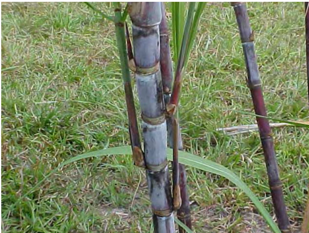
Fig. 5. Sugarcane stem with side shoots after application of glyphosate.

There are minor differences between the different formulations of glyphosate applied to sugarcane cultures; however, all formulations promoted increases in sucrose content and sugar production compared to controls (Villegas et al., 1993; Bennett & Montes, 2003; Viator et al., 2003).