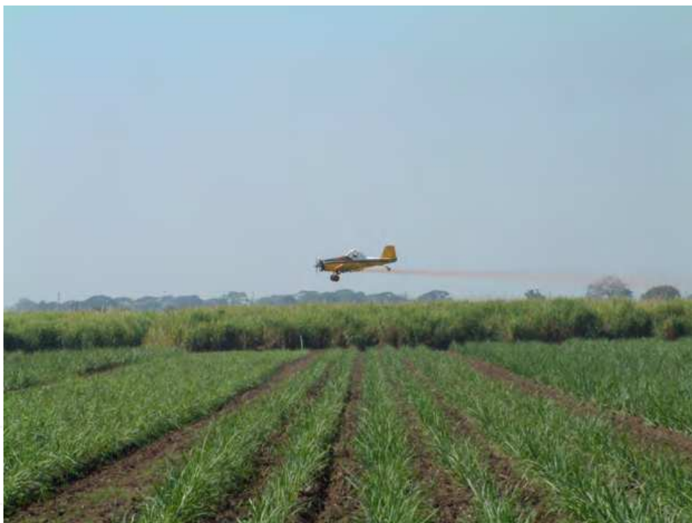
Fig. 3. Aerial application of ripener using an agricultural aircraft.

The physiology of sugarcane ripening has been studied for more than 30 years. Natural ripening in early harvest may be poor, even in early varieties. In this context, the use of chemical ripeners stands out as an important tool (Dalley & Richard Junior, 2010). Due to the areas cultivated with sugar cane are extensive, the application of these products is normally done with agricultural aircraft (Fig. 3), but helicopters can also be used for this purpose (Fig. 4).