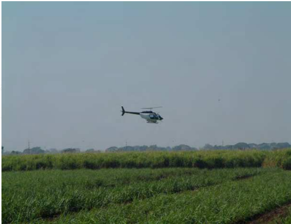
Fig. 4. Aerial application of ripener using a helicopter.