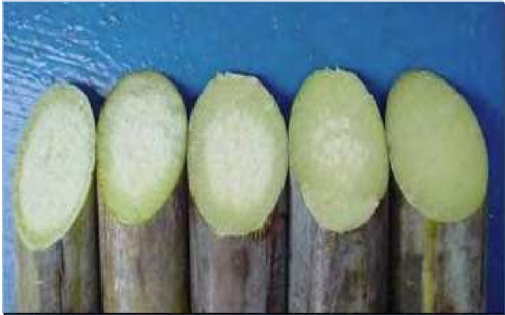
Fig. 2. Different grades of pith process in sugarcane. From the left to the right, intense pith to no pith.

Quantification of the degree of the pith process and the possible changes in the quality of the raw material may provide critical data to the design of the area to be planted for each variety and the best time periods for industrial use. The intensity of the flowering process and its consequences for the quality of raw materials vary with the variety and climate. Therefore, reducing the amount of juice is the main factor that is affected by flowering.