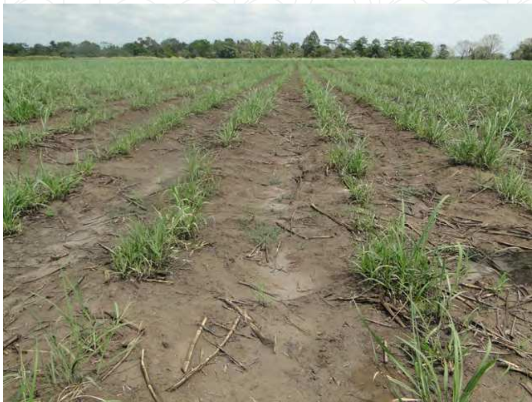
Fig. 6. Detrimental effect on sprouting ratoons after harvest from glyphosate treated areas.

harvest from treated areas, with a reduction of tillers per meter (Fig. 6), which would lead to lower productivity in the next harvest (Leite & Crusciol, 2008). For this reason, glyphosate has been widely used in areas that will be used for the implementation of a new cane field. However, there are also reports that glyphosate did not cause any detrimental effects on sugarcane quality and productivity (Viana et al., 2008). Due to the strong influences that factors such as dose, variety and climatic conditions have on the effectiveness of the product, this issue merits further study.