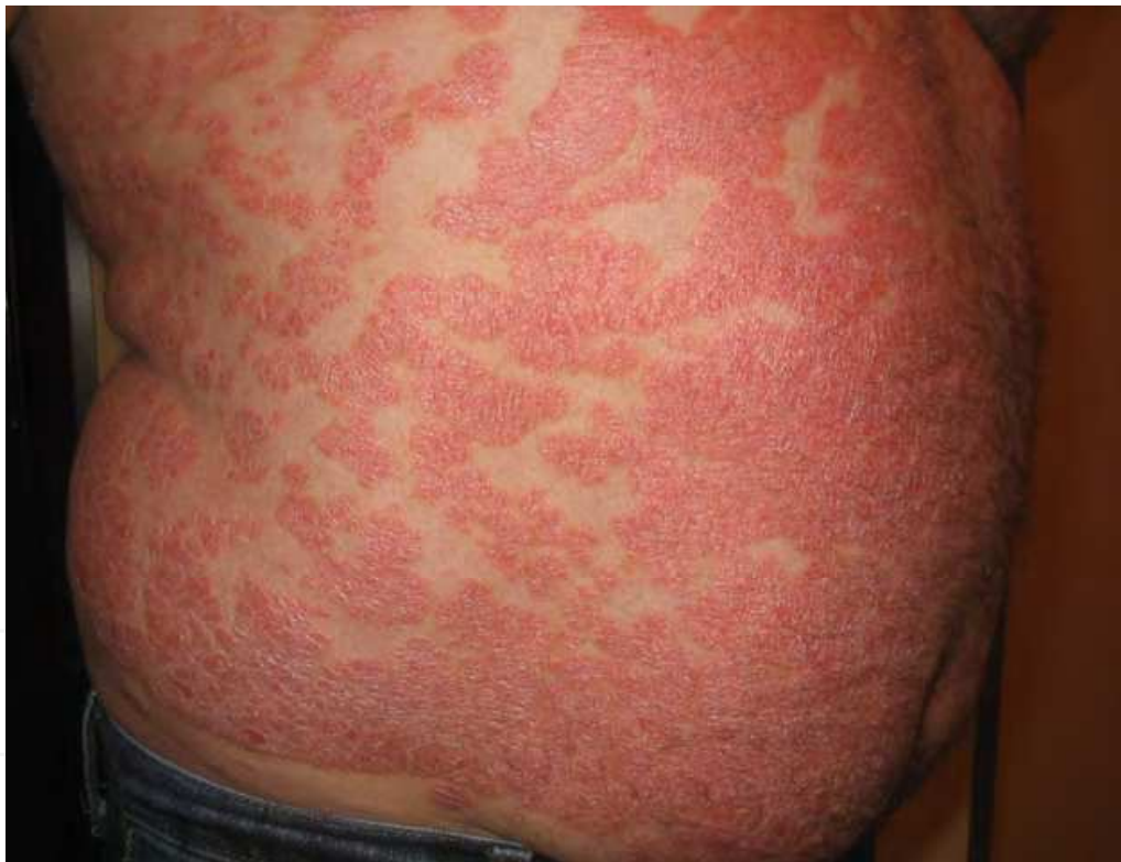
Fig. 2. W0, baseline

Clinical response is often excellent. Primary response must be distinguished from more long-term response. Primary response is immediate efficacy, generally deemed at 10 weeks for infliximab. The more long-term response is the persistence of efficacy, without relapse; there is no defined timeframe for measuring this. We will therefore talk about a 1-year or 2-year response, etc. For this study, we analyzed the long-term response according to the clinical practice at the time of file analysis, so 1 to 4 years after the beginning of treatment.