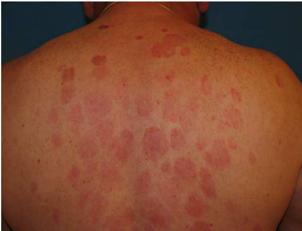
Fig. 5. W6, PASI75 response with erythematous sequelae

The major problem is to psychologically and medically manage losses of clinical response. But for patients with a sustained complete response, the dermatological quality of life is perfect.