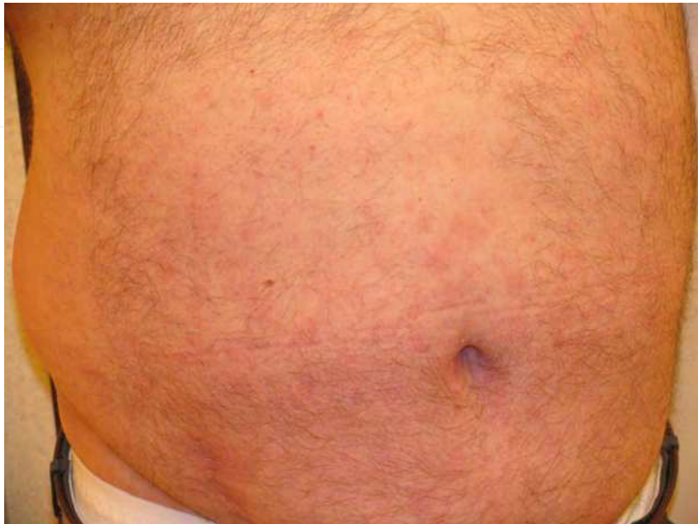
Fig. 3. W10, complete response

percentage between 75 and 89%. Just 4 remained with an improvement of 'only' between 50 and 74%. 6 patients are considered to have a primary resistance to treatment as they have never obtained a 50% reduction in their initial severity. These six patients cannot be distinguished from the others on the basis of age, sex, comorbidity, or prior treatments received. No characteristics predictive of response emerged from our series.