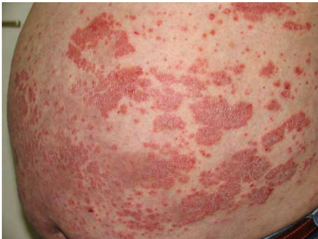
Fig. 4. W46, partial relapse