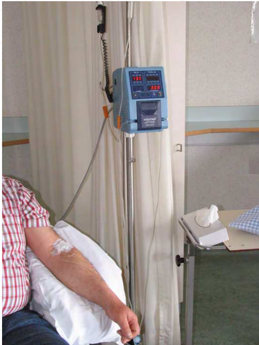
Fig. 1. Infusion in specialized unit

advantages and disadvantages. Many patients appreciate the simplicity of infliximab's dosage schedule: half a day in hospital every eight weeks seems much easier than more regular injections at home. Patients often say: "at least, with the drip, I can forget about psoriasis and its treatment completely for two whole months". Patients do not have to go to the pharmacy on a regular basis, keep boxes in the family refrigerator, or have a nurse repeatedly visit their house (figure 1).