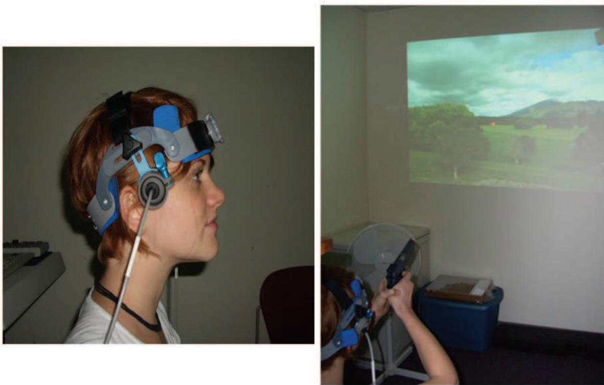
Fig. 1. Apparatus used in the Schultz et al. (2009) study. Left: The Transcranial Doppler Sonography transducers positioned at the right and left (not pictured) transtemporal window for recording changes in cerebral blood flow velocity through the middle cerebral artery of each hemisphere. The two 2-MHz transducers are connected to a Companion III TCD system (Nicolet/EME, Madison, WI), which uses Fast Fourier analysis to transform the signals and displays mean CBFv for each heartbeat-cycle envelope. Right: The participant uses a laser-modified handgun to respond to computer-generated stimuli projected on a wall. Shots were automatically detected and recorded (time, location) by LaserShot (Stafford, TX) hardware and software

The stability of the hemispheric difference in CBFv across the watchperiod provides one clue toward unpacking this curious result. In earlier TCD studies of vigilance (Helton et al., 2007; Hitchcock et al., 2003; Warm et al., 2009), the right-hemisphere advantage became evident as time-on-task increased. Early in the vigil, mean CBFv (relative to resting baseline) was comparable in the two hemispheres, but as the demands on sustaining attention increased over time, a cerebral asymmetry emerged reflecting activity in the right cerebral hemisphere. This consistent and intuitive finding is not what was observed in the TCD data of the Schultz and collaborators (2009) study. In our task, faster CBFv in the left hemisphere was observed even in the first quarter of the watchperiod. Indeed, in follow-up analyses we noted that the left-hemisphere advantage in CBFv is statistically significant within the very first minute of the task (Schultz, Phillips, & Washburn, 2010). This is presumably before vigilance would be required, or at least when the demands on sustained attention should be minimal. That this level of asymmetry was then stable throughout the vigil suggests that our left-hemisphere advantage for this task was not indicative of the lateralization of vigilance,