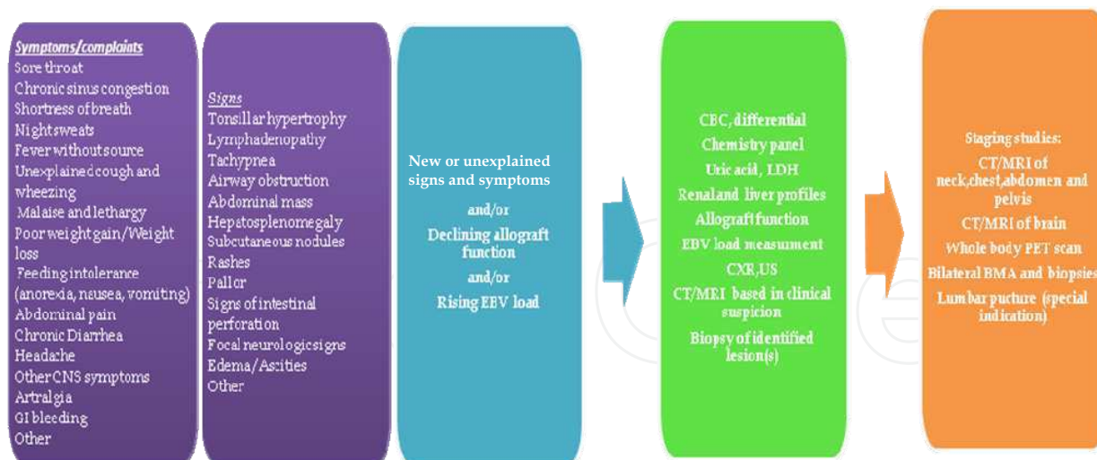
Fig. 2. Diagnostic and staging procedures for PTLD.