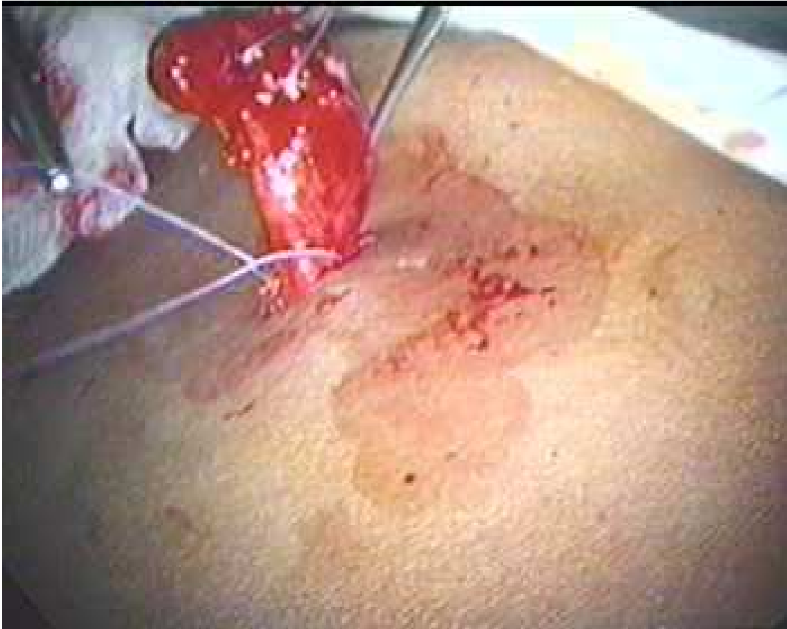
Fig. 2. Appendix drawn out on surface and meson-appendix legated.