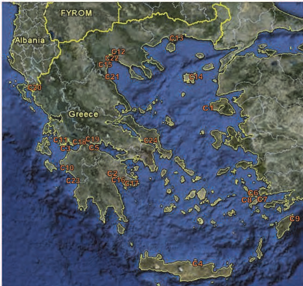
Fig. 3. Map of Greece displaying the 27 case studies (Google Earth).