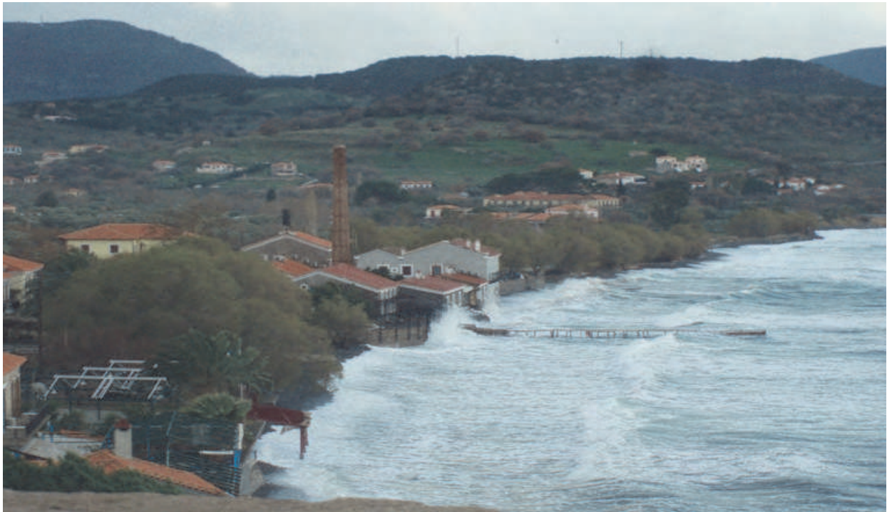
Fig. 1. Storm surge in Molyvos coast, Lesvos island, Greece, December 2009 (photo T. Karabas).

Greece, construction of summer residence occurs too close to the coast (Figure 1), increasing social vulnerability in the case of SLR. Construction near the coast happens due to the fact that tides in the Mediterranean do not exceed 40 cm. So, vulnerability rises due to the increased exposure of coastal constructions and the growing number of people colonizing the Mediterranean coasts.