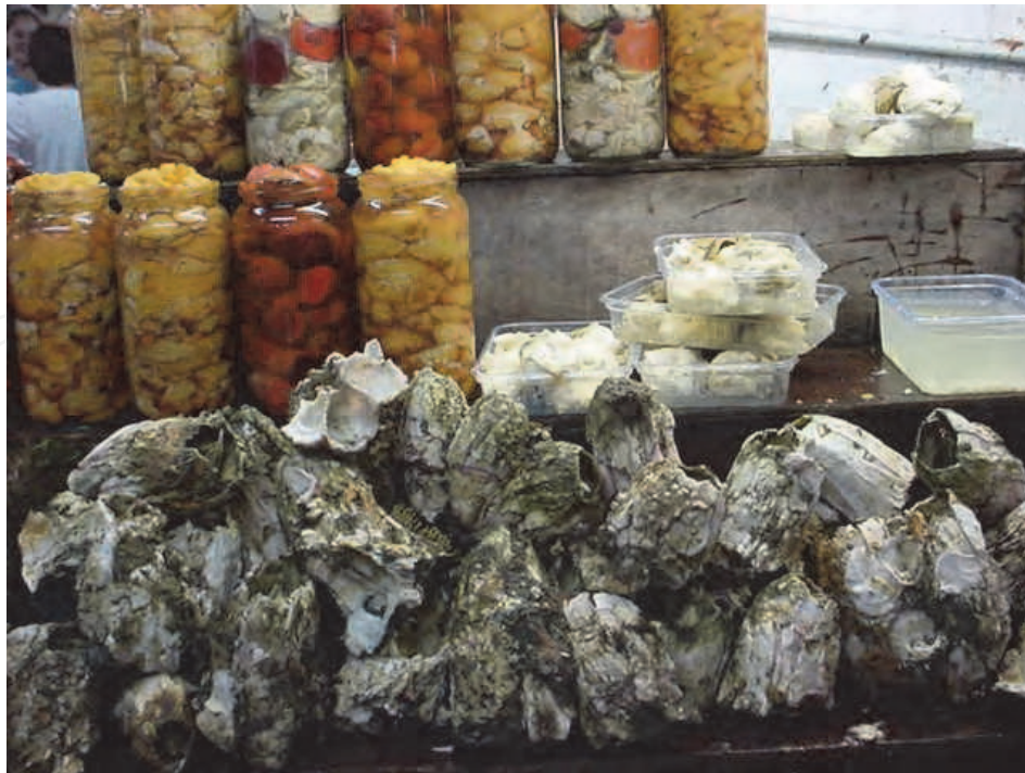
Fig. 2. "Giant barnacle" in a local market in Puerto Montt city, southern Chile.

juveniles in artificial floating substrates (Goldberg, 1984). Results have been scarce, mainly because, in this species, larval settlement is determined by the presence of conspecific adults (Molares et al., 1994; Cruz et al., 2010). Among balanomorph barnacles, similar experiments have been undertaken on Megabalanus azoricus in the Azores islands, where technologies have been designed for installing collectors in the water column. The results indicate that larval settlement occurs, although it is still not possible to ensure that levels are sufficient for industrial scale cultures (Pham et al., 2008; Pham & Silva, 2010; López et al., 2010). Thus, progress has been made, on an experimental level, with these two species, in the area of spat collection from the wild. The only species where studies have advanced from experimental to semi-industrial cultures, is the "giant barnacle", "picoroco", Austromegabalanus psittacus , on the Chilean coast. In this species, it has been shown that levels of spat collection from the wild will permit the development of commercial cultures. Similarly, the growth rates enable specimens of a commercial size to be obtained over a short period of time (López, 2008; López et al., 2010). Furthermore, low cost production technologies have been developed to obtain spat and to enhance growth. The yield and economic feasibility of various products have also been evaluated (Bedecarratz et al., 2011).