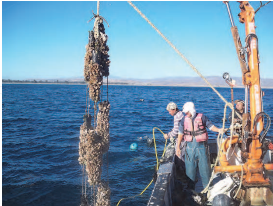
Fig. 4. “Giant barnacle” culture growth system in northern Chile.

Instantaneous growth rates decrease with age, fluctuating from 0.03 cm/day carino-rostral length at the beginning of growth, to 0.0005 cm/day carino-rostral length after 20 months.