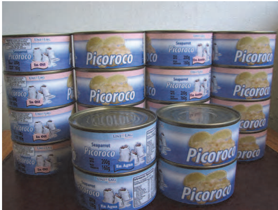
Fig. 5. Canned products of “giant barnacle”.

With regard to markets and prices, the “goose barnacles” can reach prices of between €15-25/Kg on the Iberian market. Of the “acorn barnacle” species, the “giant barnacle” is commercialized on the local Chilean market at prices that range between US$1.5/Kg and 20/Kg. The “mine fujit subo” reaches between US$12-15/Kg on the Japanese market and the “craca”, between €2.5-5/Kg on the local market of the Azores Islands, Portugal (López et al., 2010). Market studies of the “giant barnacle” in Japan indicate that some products can reach up to US$25/Kg. “Giant barnacle” cultures on the Chilean coast have generated an interest in its commercialization in the USA and on the Iberian market.