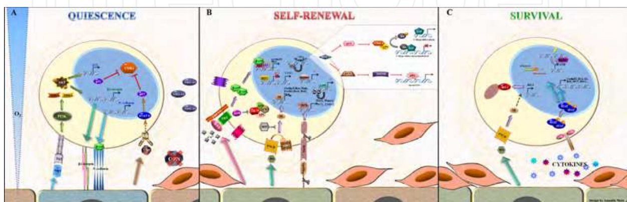
Fig. 1. Networks interaction model for: A) quiescence, B) self-renewal and C) survival.

In steady state conditions HSCs are in a slowly dividing state, termed relative quiescence, with a cell division cycle in the mouse in the range of 2–4 weeks, localized in close contact with stromal cells, including osteoblasts (Calvi et al., 2003; Zhang et al., 2003). This is in contrast to the rapidly cycling hematopoietic progenitor cells, which are more committed to differentiation than HSCs. The balance between quiescent and cycling stem cells was proposed to rely on the amount of soluble cytokines, which result in HSCs relocating from the osteoblastic to the vascular niche (Heissig et al., 2002). However new results indicate that it depends on a complex network of signals.