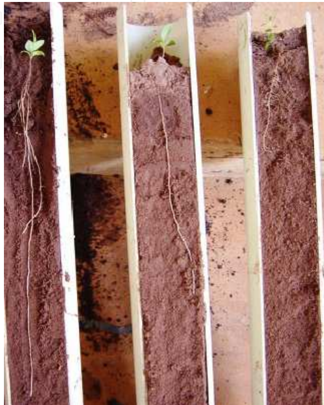
Fig. 3. Morphological details of the root system of plants of Styrax ferrugineus (on the left), S. camporum (in the middle), and S. pohlii (on the right) cultivated in rhizotrons (1 m long).

2009), and also that citrus plantations in São Paulo and (in the south of) Minas Gerais states are nowadays occupying lands that were previously occupied by the native cerrado vegetation, it would be valuable to investigate the plant biology, and to a further extent, the plant physiology of cerrado woody species. Indeed, Haridasan (2008) highlights the importance of understanding different aspects of plant biology of several species from the cerrado vegetation.