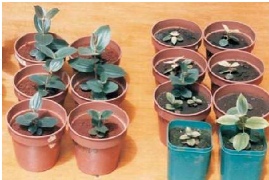
Fig. 5. Seedlings of Miconia albicans , growing in acid cerrado soil (left) (healthy green leaves) and alkaline calcareous soil (right) (chlorotic leaves and stunted growth) (picture originally published by Haridasan, M. in Braz. J. Plant Physiol, v. 20, p. 183-195, 2008).