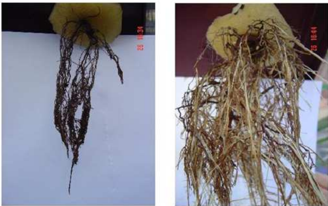
Fig. 6. Seedlings of Styrox camporum cultivated in a nutritive solution without aluminum showing dark necrotic roots (on the left) and with 20 \text{ mg L}^{-1} of aluminum showing normal development of roots (on the right) (Habermann, G. 2010).

Not only does toxic \text{Al}^{3+} in the soil negatively affect citrus crop production, but also a low soil pH may provoke serious problems to the nutritional plant balance. Most citrus groves in São Paulo and Minas Gerais states show soil pH around 5.0 (Table 1). Correcting soil pH can enhance production from 46 to 61 kg per 'Valência' sweet-orange tree (Anderson, 1987). Notwithstanding, soil pH corrections are very expensive and yearly-mandatory.