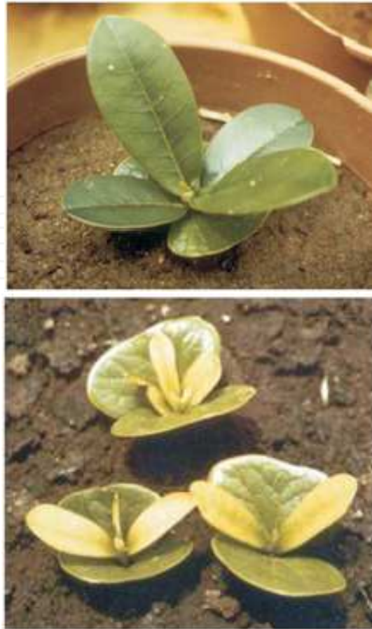
Fig. 4. Seedlings of Vochysia thyrsoidea growing in an acid and Al^{3+} -rich soil, showing healthy green leaves (top); and in a calcareous soil, showing chlorotic leaves (bottom) (pictures originally published by Haridasan, M. in Braz. J. Plant Physiol, v. 20, p. 183-195, 2008).