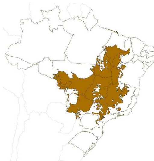
Fig. 1. Geographical distribution of the cerrado among Brazilian states.

The cerrado is a mosaic of biomes (Batalha, 2011) that occupies approximately 21% of the Brazilian territory (Figure 1). The cerrado is considered to be one of the last agricultural frontiers in the world (Borlaug, 2002). In the cerrado areas, a warm and rainy season is observed from October to March and a dry and cold season from April to September. It rains approximately 1500mm per year in the cerrado, and air temperatures may range between 22 and 27°C (Klink & Machado, 2005).