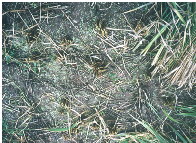
Fig. 4. Straw decay and soil surface conditions after rice harvest