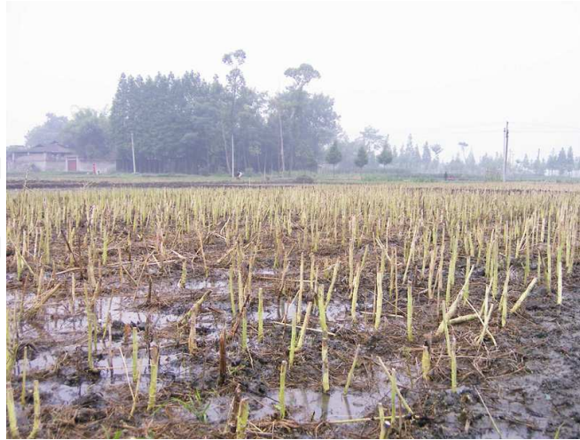
Fig. 1. Field covered with high standing-stubble from the previous rape crop

and give some evidence in the introduction – what type of yields can be achieved with the broadcast-transplanting method in a no-tillage field?