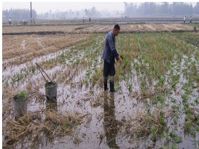
Fig. 2. Broadcasting rice seedlings into high standing-stubble