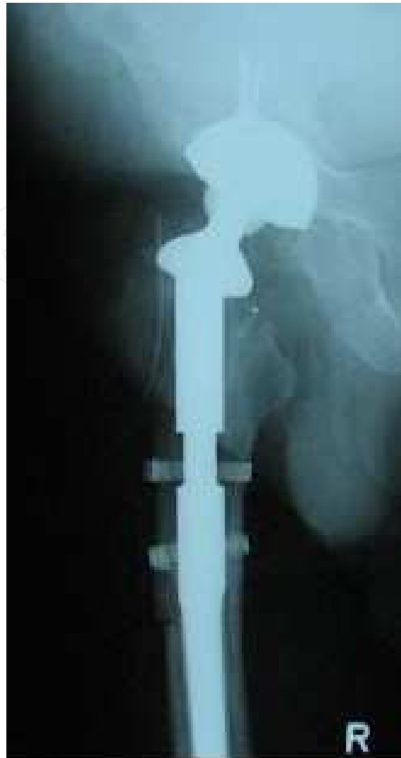
Fig. 5. Radiograph of the revised right hip with the cementless revision modular prosthesis in place.