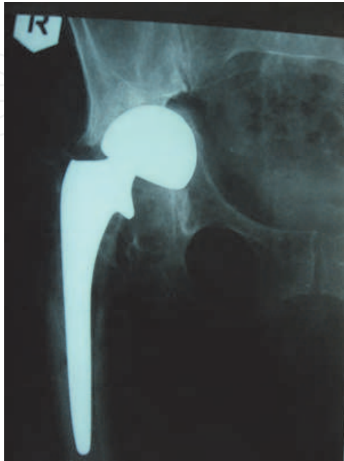
Fig. 2A. Acetabular fracture in a 64-year old patient 5 years after bipolar hemiarthroplasty for right femoral neck fracture.

While hemiarthroplasty avoids the known risks of internal fixation, it brings other risks of its own: infection, stem loosening, dislocation, and groin pain as an effect of acetabular protrusion (Figure 2) or cartilage erosion (the so-called endoprosthetic arthritis).