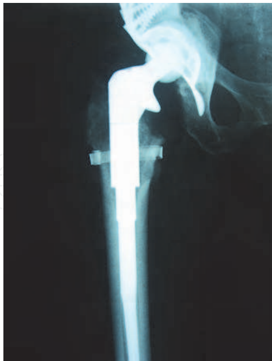
Fig. 3C. The same patient after revision THA with modular femoral stem and a Bursch-Schneider acetabular supportive ring.