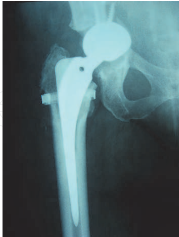
Fig. 3B. Acetabular fracture and intrapelvic cup (press-fit type) migration noted 6 weeks after primary uncemented THA in the same patient. Note that intraoperative femoral shaft fracture also occurred and was treated with a cerclage belt.