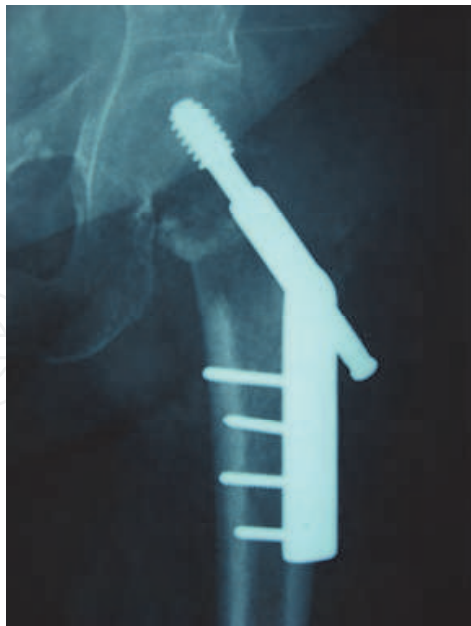
Fig. 1B. No signs of bony healing 6 months after open reduction and internal fixation with a dynamic hip screw (DHS) device. The patient is unable to walk.

In case we do not decide for preservation of the femoral head the remaining treatment options are unipolar hemiarthroplasty, bipolar hemiarthroplasty and THA.