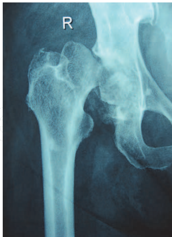
Fig. 3A. Subcapital fracture in a 71-year old female patient with osteoporosis.

Total hip arthroplasty is a durable treatment option for femoral neck fractures in the elderly and gives a good functional outcome, but comes with the price of a higher complication rate, such as dislocation or postoperative delirium (Gallo et al., 2010). Surgical technique adapted to osteoporotic bone and careful implant selection regarding fixation influence the success of treatment for femoral neck fractures (Figure 3). The risk of dislocation depends on the surgical approach, the reconstruction of hip biomechanics, the head size and offset, the quality of capsular closure, and the experience of the surgeon (Ames et al., 2010; Leighton et al., 2007; Rutz et al., 2010).