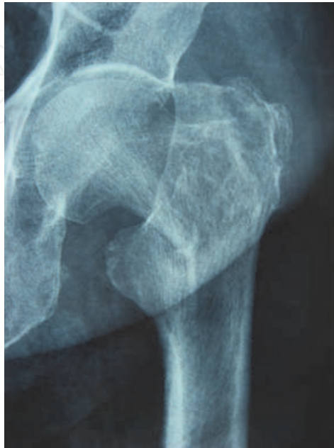
Fig. 1A. Proximal femoral fracture in a 74-year old female osteoporotic patient.

certainly be lowered by fast diagnostic procedures and a shorter time in bed waiting for the surgery. Internal fixation with femoral head preservation should be performed in the first 6 hours after the injury or only exceptionally in the first 24 hours. In older injuries hip arthroplasty should be performed (Sendtner et al., 2010). The bone healing potential is especially low in older patients (Figure 1).