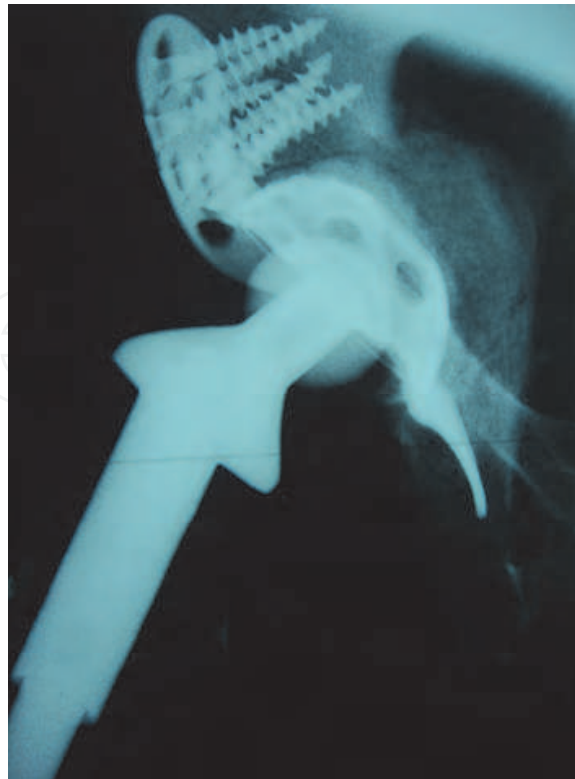
Fig. 3D. The same patient after revision THA on lateral radiograph. Note massive autologous bone grafts under the Bursch-Schneider ring.