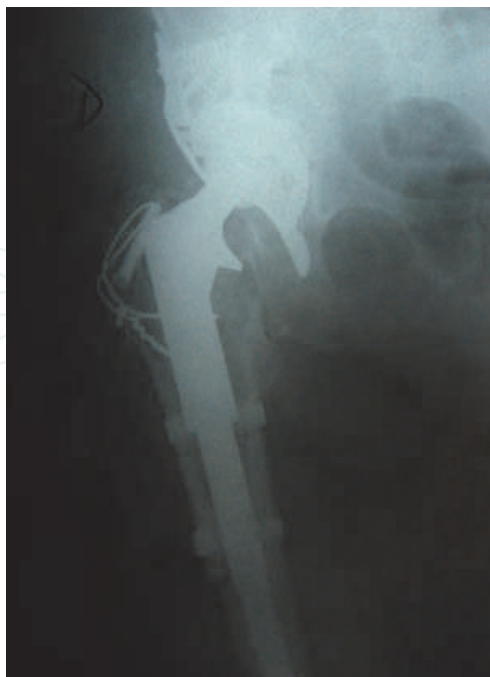
Fig. 2B. The same patient after revision total hip arthroplasty with insertion of a Burch-Schneider acetabular supportive ring.