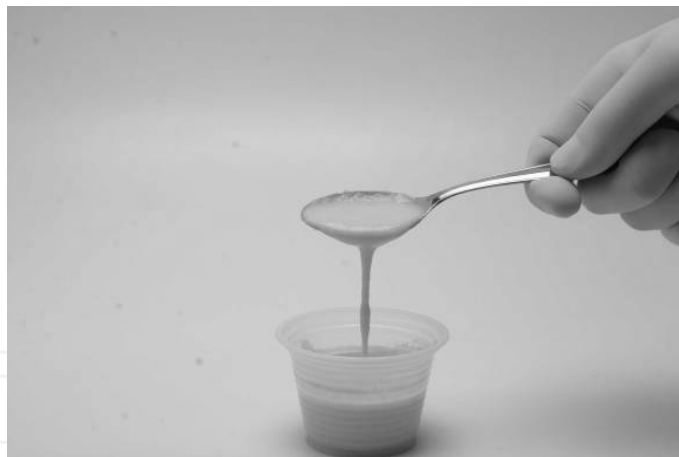
Fig. 3. Photographic representation of a preparation (heart of palm cream) with nectar consistency. pH = 3.71; viscosity = 240 cP; amount of water for dilution in 100 mL of the recipe with pudding viscosity = 42.88 mL

In the photographic representation of the nectar consistency (Figure 3), there is a formation of continuous filament thinner than the previous one, without a characteristic "V" at the base of the spoon.