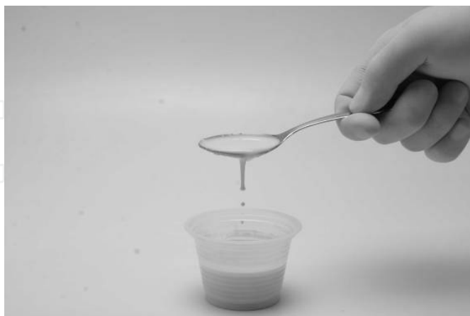
Fig. 4. Photographic representation of a preparation (heart of palm cream) with thin consistency. pH = 5.36; viscosity = 46 cP; amount of water for dilution in 100 mL of the recipe with pudding viscosity = 107.14 mL

life and reduction of potential complications, through education/health promotion programs, including specialized procedures and orientation programs for caregivers (Santoro, 2008)