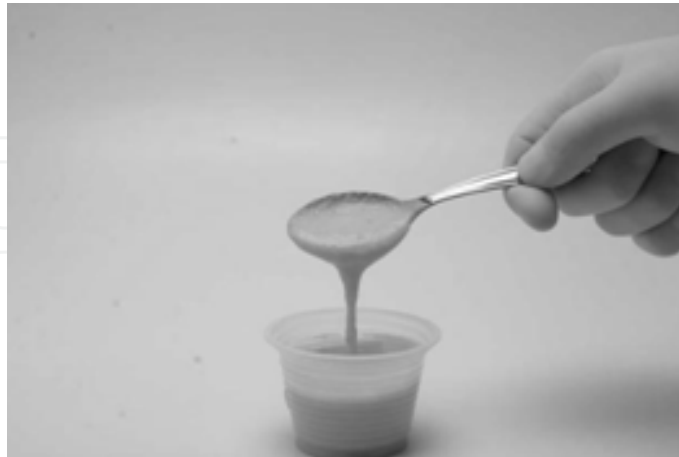
Fig. 2. Photographic representation of a preparation (heart of palm cream) with honey consistency. pH = 3.69; viscosity = 1080 cP; amount of water for dilution in 100 mL of the recipe with pudding viscosity = 14.23 mL

Figure 2 shows a photographic representation of the same preparation with the consistency of honey, in which there is a formation of continuous filament with the base of the spoon forming a characteristic "V".