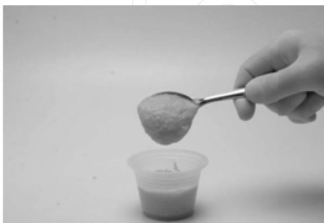
Fig. 1. Photographic representation of a preparation (heart of palm cream) with pudding consistency. pH = 3.73; viscosity = 2000 cP; amount of water for dilution = 0 mL

The poor knowledge of the fundamental physical characteristics of the consistency of the preparations is considered a limiting factor to adjust the viscosity, which does not ensure a safe intake. Figure 1 shows a photographic representation of a preparation of heart of palm cream with the consistency of pudding. Its main characteristic is the formation of a heavy cake, in which there is low adherence on the spoon surface, forming no continuous filaments.