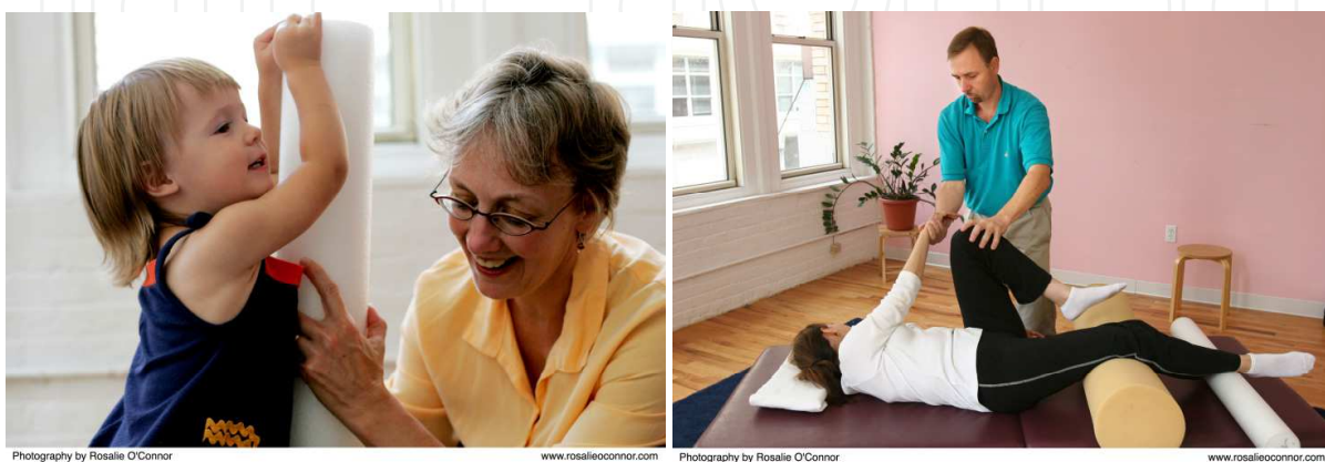
Fig. 1. Examples of Functional Integration lessons.

Functional Integration lessons (see Fig. 1) use manual contact between teacher and student to guide the student to better understand current patterns of behavior and inform the student in a manner that facilitates self-organization of alternative, improved behavior (Feldenkrais, 1972, 1981, 2010). Students are comfortably clothed during lessons that usually last 30-60 minutes. Teachers use supportive, non-invasive touch that can be informative to both students and teachers. Teachers individualize lessons to target functional goals expressed by students, while using principles and techniques common to the Feldenkrais Method . Some of these include: creating a sense of safety with respectful touch and support of body parts; moving limbs through pathways of minimal resistance to suggest more optimal movement trajectories; clarifying existing habitual patterns of positioning and organization to facilitate reorganization; compressing, lengthening, or guiding other movements with emphasis on contact that is as if it were skeleton-to-skeleton; and positioning parts so as to shorten muscles, facilitate decreased contractile activity, and allow more lengthening without stretching (Feldenkrais, 1972, 1981, 2010; Ginsburg, 2010).