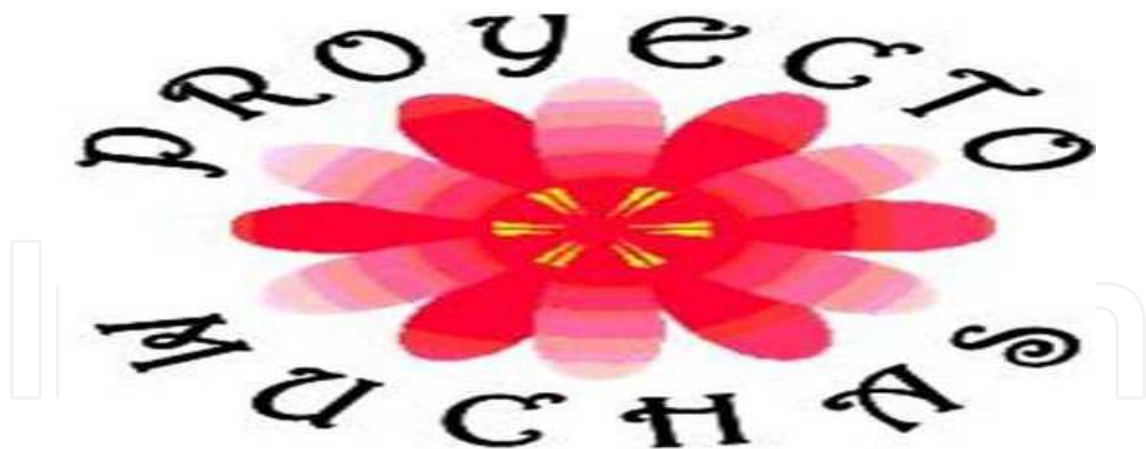
Fig. 1. Proyecto MUCHAS Logo

http://www.psm.edu/MUCHAS/index.htm . Lastly, the project colors are pink (both light and dark) and the logo embossed onto t-shirts, which are worn by the research team housing on the days that HIV/STI testing is being conducted.