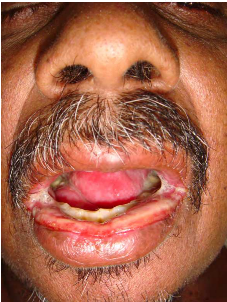
Fig. 2. Oral mucositis in a patient.

statistically significant differences in mucositis; however, the sucralfate group reported less oral pain, and other topical and systemic analgesics were started later in the course of radiation [20]. A prospective double-blind study compared the effectiveness of sucralfate suspension versus diphenhydramine syrup plus kaolin-pectin on radiotherapy-induced mucositis. Data were collected daily, including perceived pain, helpfulness of mouth rinses, weekly mucositis grade, weight change, and interruption of therapy. Analysis of the two groups revealed no statistically significant differences between the two groups. In a retrospective review, 15 patients who had not used daily oral rinses were compared with the two groups, and the results suggested that the use of a daily oral rinse with a mouth-coating agent may result in less pain, reduce weight loss, and help prevent interruption of radiation because of severe mucositis[21].