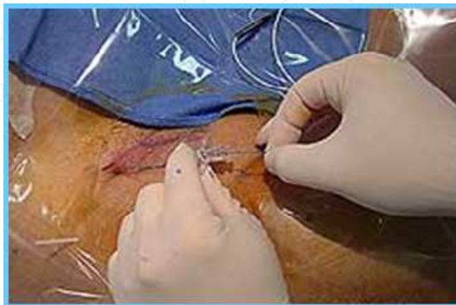
Fig. 2. Catheter placement

When stimulating catheter is being used, the catheter has to be connected to the PNS without changing the current output. The catheter is advanced 5 to 15 cm past the needle tip, and its position is adjusted until quadriceps femoris contractions are still elicited at a current output between 0.4 to 0.5 mA. At this point, the needle is withdrawn and quadriceps contractions are elicited via the catheter again to confirm the final perineural position of the catheter. (Dauri et al., 2007)