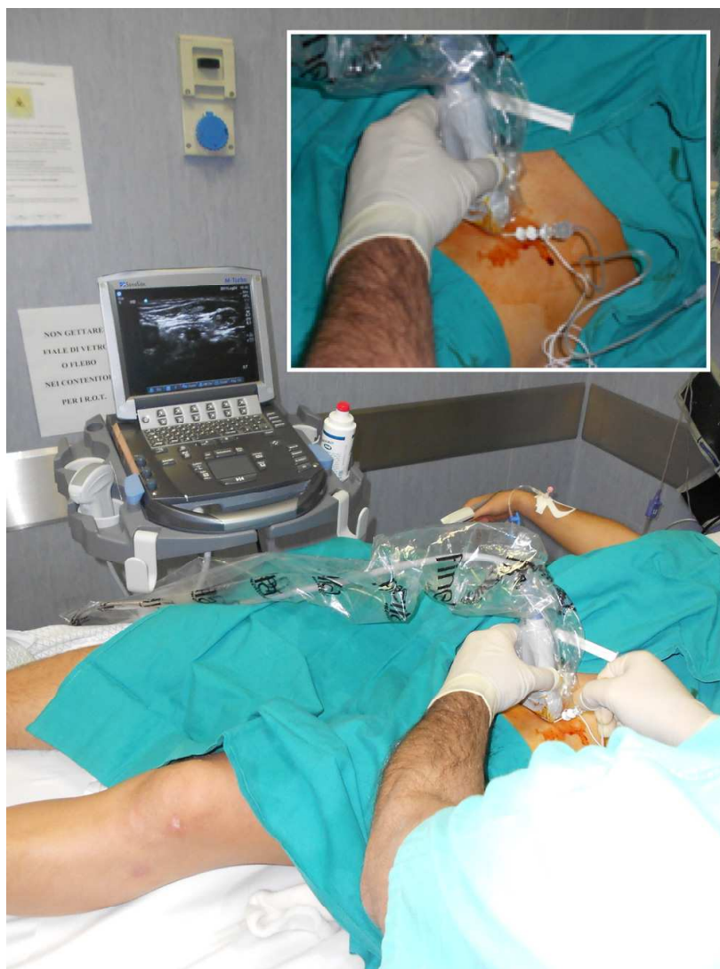
Fig. 3. Ultrasound-guided femoral nerve block: in plane approach

An alternative for assisting with correct catheter placement is ultrasonographic guidance (Fig. 3- 4- 5).