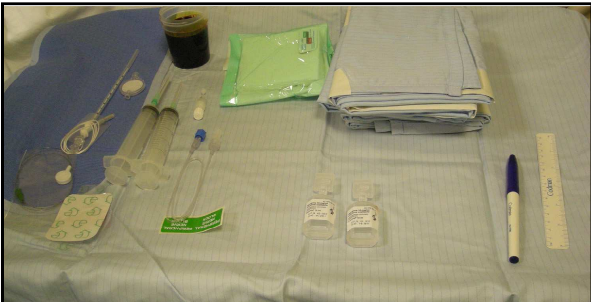
Fig. 1. Equipment

The patient should be in the supine position with legs spread slightly apart. After aseptic skin disinfection and sterile draping of the inguinal region, a local anesthetic is injected superficially. The stimulating needle insertion site is immediately below the inguinal crease, 1 to 2 cm lateral to the femoral artery pulsation. A 50-mm 18-gauge insulated stimulating needle is then connected to the peripheral nerve stimulator (PNS) with an initial current output of 1 mA (2 Hz, 0.1 ms). The stimulating needle has to be inserted with a 45° angle and advanced in a cephalad direction until quadriceps femoris muscle contractions were elicited (as evidenced by cephalad patellar movements). The needle position has to be adjusted until quadriceps femoris contractions are still elicited at a current of 0.5 mA or less. At this point, a 20-gauge catheter is introduced through the needle. The catheter is then advanced for 10 to 15 cm beyond the needle tip, needle is withdrawn and the catheter has to be secured in place. The local anesthetic of choice, has to be injected slowly through the catheter.