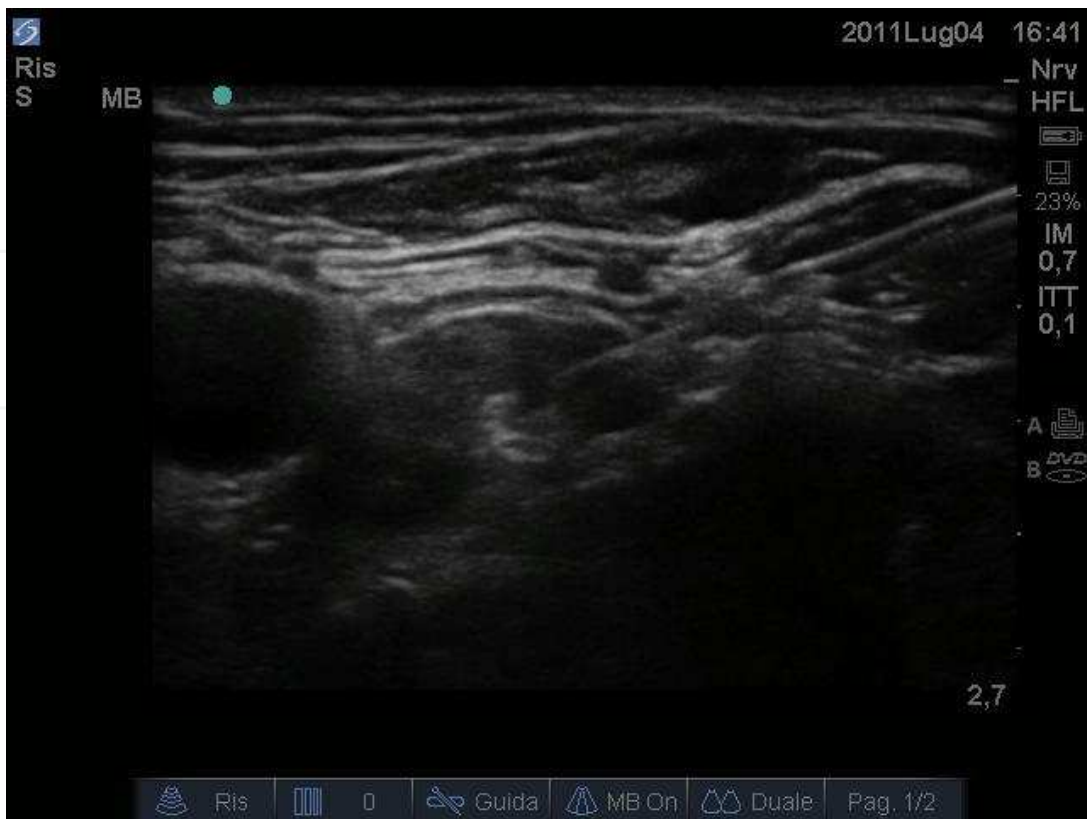
Fig. 4. Ultrasound guided femoral nerve block: needle insertion