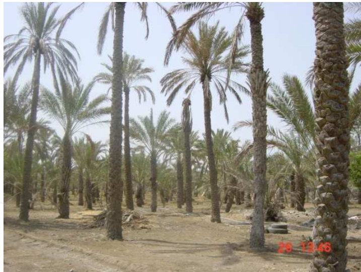
Plate 1. Deterioration of date palm trees due to high level of salinity.