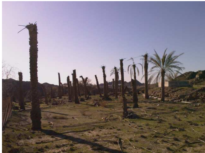
Plate 2. Date palm field neglected due to the salinity.

The aim of this paper is to pool the various aspects of responses of date palm to salinity tolerance and to review the existing knowledge in relation to biodiversity useful to researchers and developmental agencies, engaged in date palm. The review also facilitates interdisciplinary studies to assess the ecological significance of salt stress in relation to date palm cultivation.