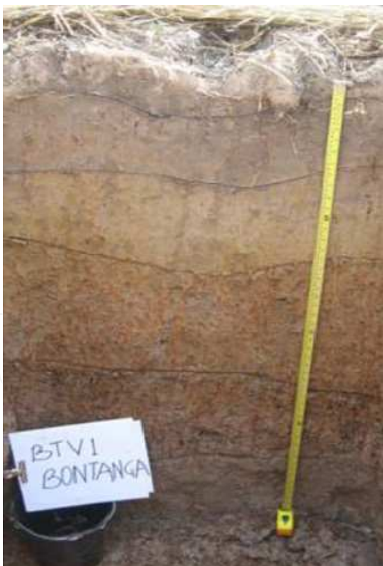
Fig. 2.a. Typical profile of Volta soil series (FAO/WRB: Eutric Gleysol )