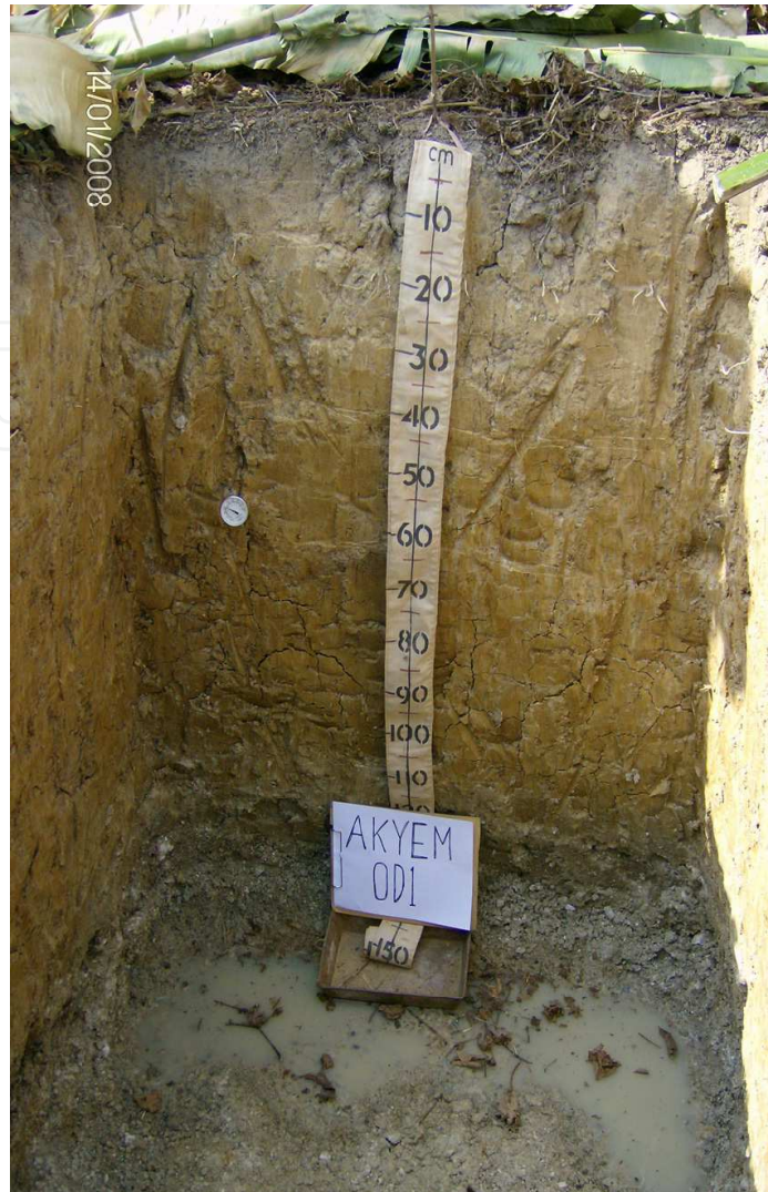
Fig. 4. Typical profile of Oda soil series (FAO/WRB: Eutric-Gleysol )