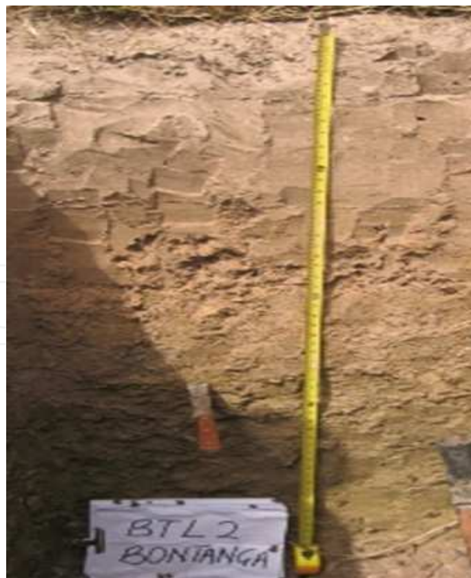
Fig. 1.a. Typical profile of Lima soil series (FAO/WRB: Endogleyi-Ferric Planosol )