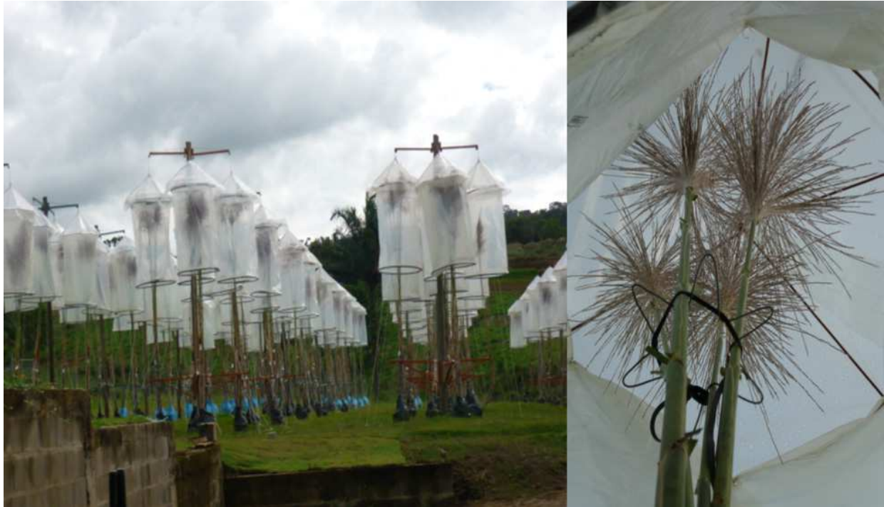
Fig. 2. Sugarcane crossing being carried out under lanterns .

value of its corresponding family (Falconer & Mackay, 1996). Family selection is only more efficient than individual selection when the heritability based on family means is higher than the heritability of the individual plants. According to McRae et al. (1993) and to Cox et al. (1996), association of family selection with individual selection is more efficient than selection based only on families for sugarcane. Cox & Hogarth (1993) stated that family selection with repetition of each clone, followed by individual selection within the best family is the most efficient way to select sugarcane.