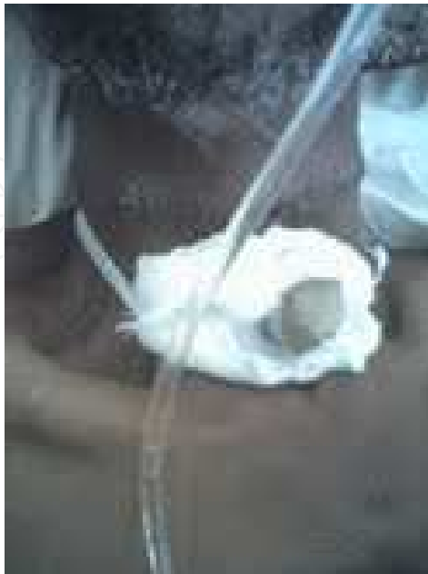
Fig. 2. Repaired cut throat injury.

Some authors are of the opinion that self-harm attempts can be grouped into 'serious suicide attempts' and more impulsive forms of deliberate self-harm. The former is typically associated with severe mental illness, high intended lethality and attempts by the suicide attempter to avoid rescue. The latter is considered a manifestation of personality disorder or acute crisis, where there are impulsive, poorly planned attempts at self harm. This rule of thumb may be misleading, regardless of the potential for death or serious injury in the deliberate self harm category, the rates of completed suicide years after a seemingly minor episode of so called 'deliberate self harm' are significant. This fact is highlighted in a study done in Australia in which 223 patients were followed from 1975 onwards. Of those who had made an attempt at deliberate self harm in the mid 1970's, 4% had completed suicide at 4 years, 4.5% at ten years and 6-7% by 18 years.