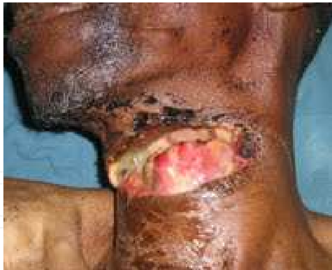
Fig. 1. Infected suicidal cut throat injury at presentation.

In some environment, late presentation is a common feature due to factors like ignorance and of course poverty which may also invariably be the triggering factor for the suicidal attempt. In the event of late presentation, debridement of infected tissues is also done prior to suturing (Figure 1). Debridement may also mean loss of substantial amounts of tissue to effect simple and proper closure. Ideally, pharyngeal, hypopharyngeal and laryngeal mucosal lacerations should be repaired early because the time elapsed before repair of laryngeal mucosal lacerations has an effect on both airway stenosis and on voice restoration 30 . Soft laryngeal stent may be needed for severely macerated mucosa.