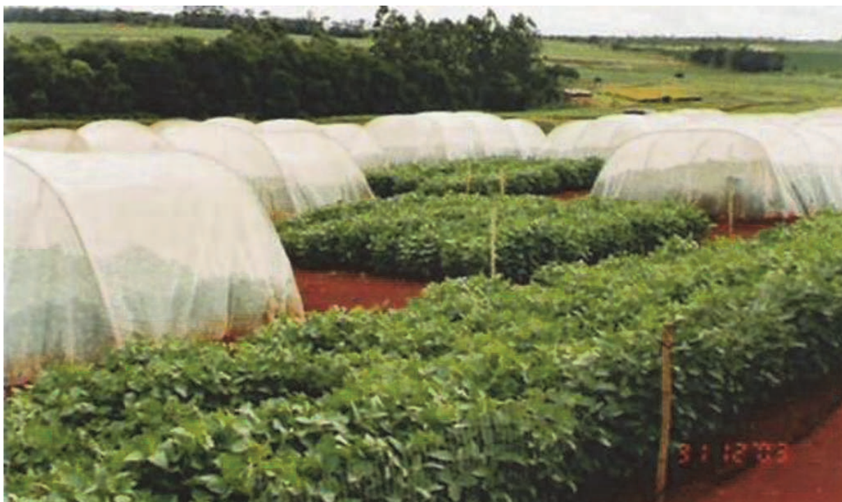
Fig. 3. Pollination cage model used in the assays. Measures: 4m x 2m x 6m.

seedling, it was applied glyphosate (Figure 4). The evaluation and quantification of seedlings that survived after the pulverization with glyphosate was recorded after a week.