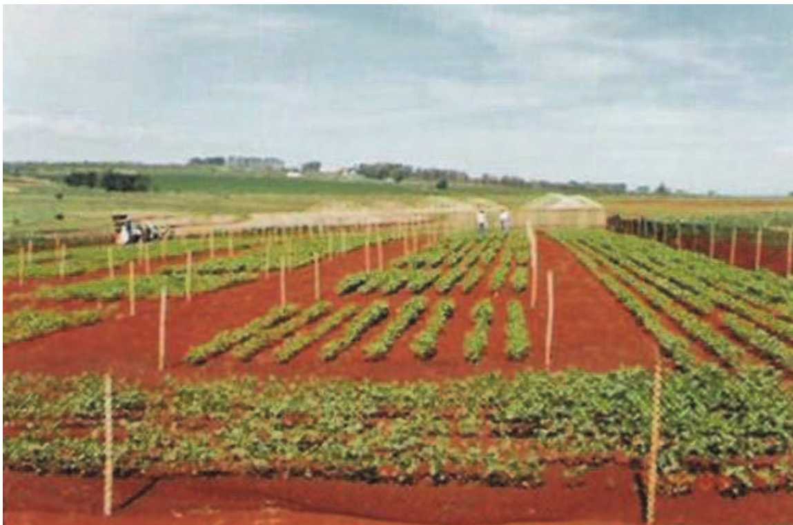
Fig. 2. Planting of transgenic and conventional soybean in alternate lines.