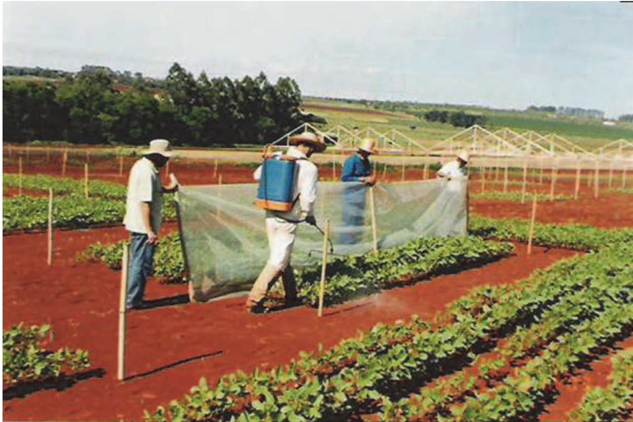
Fig. 4. The application of glyphosate in transgenic and conventional soybean plants.