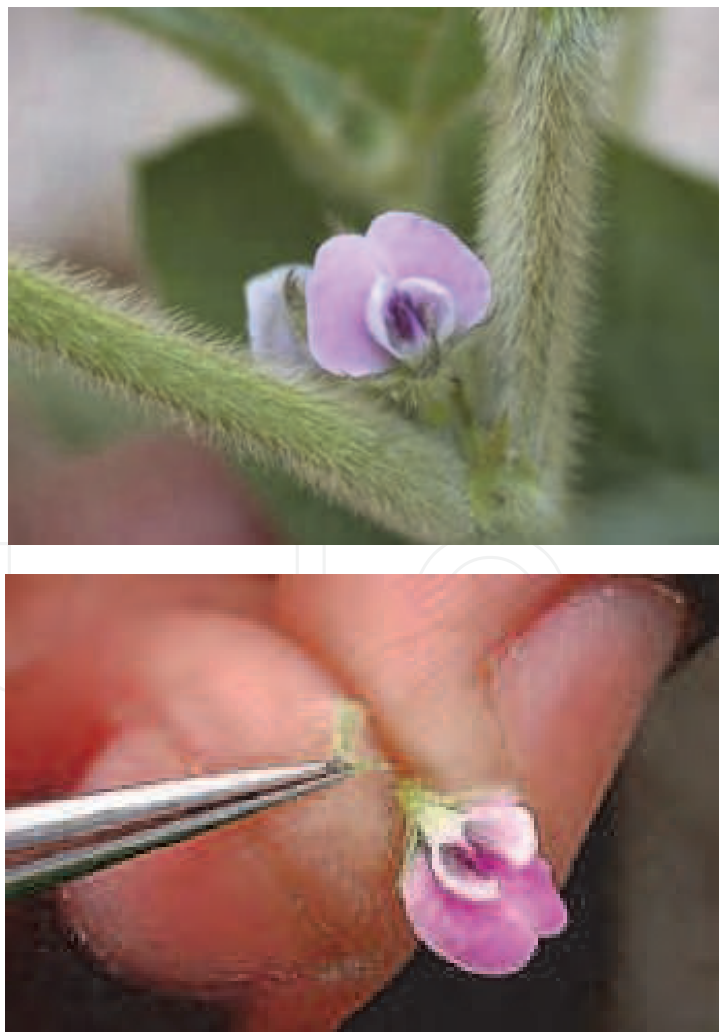
Fig. 5. Flowers of conventional soybean plants – var. BRS 133.

Figures 5 and 6 are the flowers of conventional (BRS 133) and transgenic (BRS 245 RR) soybean plants.