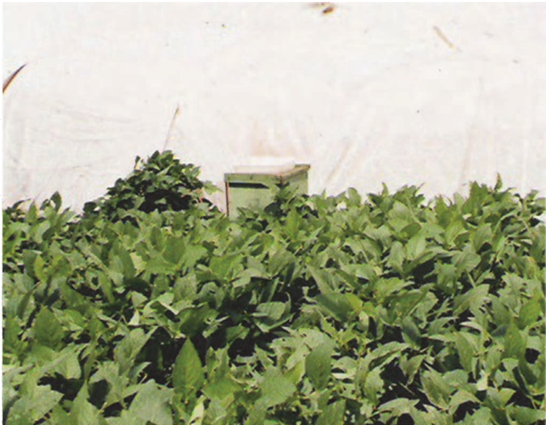
Fig. 1. A honeybee colony inside the pollination cage.