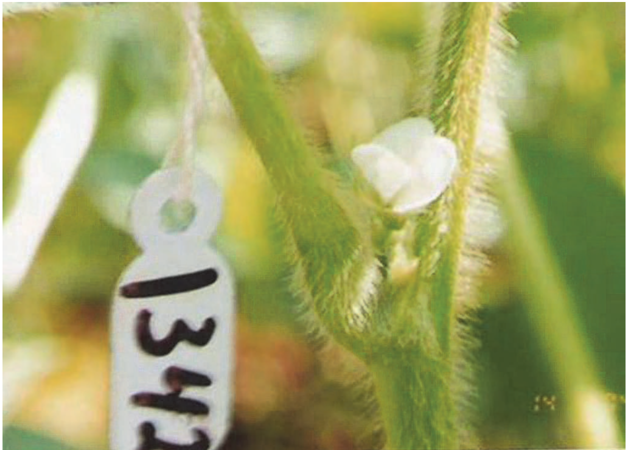
Fig. 6. Flower of transgenic soybean plants var. BRS 245 RR.

The cross-pollination rate was 0.04% in Wisconsin with different varieties of soybean in adjacent rows, in different places (Woodworth, 1922), 0.70% and 0.18% in Virginia, in successive years (Garber & Odland, 1926), and less than 1% in Iowa and Maryland (Weber & Hanson, 1961). In honeybee colony near transgenic canola crops, it was detected that transgene was incorporated to intestinal bacteria chromosomes of the honeybee (Lean et al., 2000).