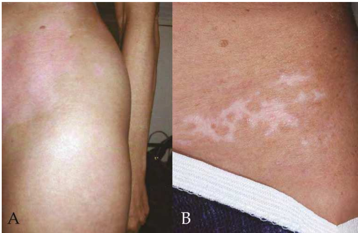
Fig. 4. A. Extensive vitiligo of the lower abdomen and hips. B. Repigmentation of vitiligo patches after 24 months of NB-UVB treatment.

Home UVB therapy may be a valuable and convenient option for select patients. Patient-reported outcomes for home NB-UVB therapy and outpatient NB-UVB therapy revealed that they show similar clinical efficacy and safety profiles (Wind, Kroon et al., 2010). Home NB-UVB is convenient and can be cost-effective in certain situations. However, more reliable long-term follow-up data is needed to further justify home UVB therapy.