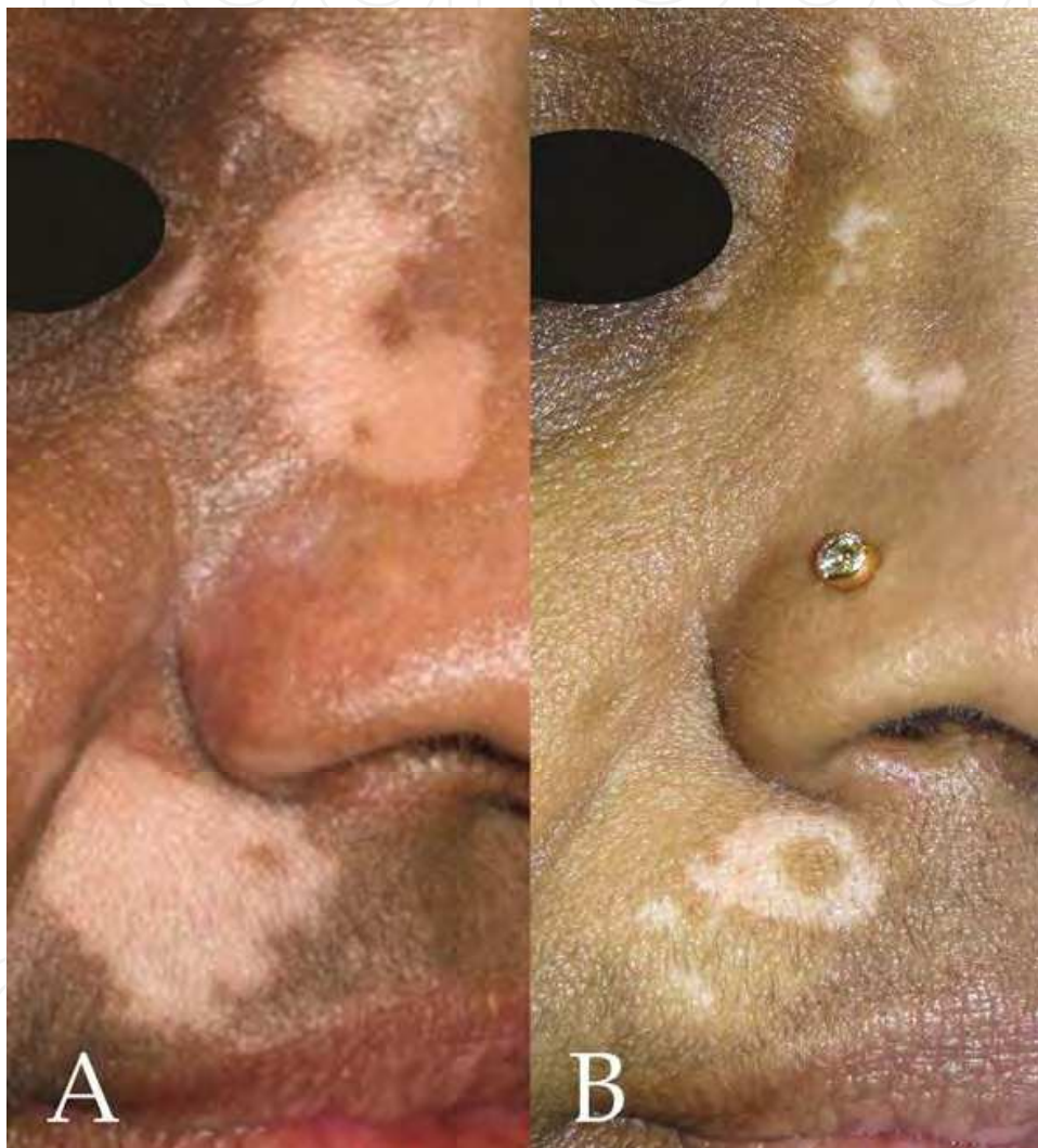
Fig. 3. A patient with facial vitiligo was treated with NB-UVB phototherapy three times weekly. A. The patient prior to initiating treatment. The patient was then started at 200 mJ based on standard protocol for Fitzpatrick skin type III. B. The patient with notable repigmentation after treatment 56 at a dose of 1001 mJ.

NB-UVB for vitiligo is most effective on the face and neck, followed by the trunk, and then upper extremities (Figure 3). Acral regions including the lower extremities, palms, and soles are more resistant to treatment. The reason has yet to be elucidated, but the regional density of hair follicles, which are reservoirs for melanocytes, are thought to play a role (Stinco, Piccirillo et al., 2009). In general, the repigmentation patterns in patients treated with NB-UVB are, in descending order, perifollicular (51.3%), then marginal, diffuse, and combined (Yang, Cho et al., 2010). However, the marginal pattern was observed to be the most common when >75% repigmentation occurred by 12 weeks of treatment (Yang, Cho et al., 2010).