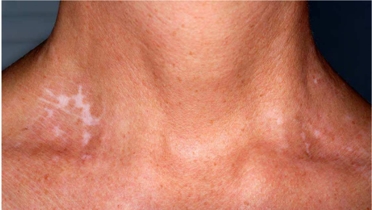
Fig. 2. Near complete repigmentation of vitiligo patches with NB-UVB treatment.