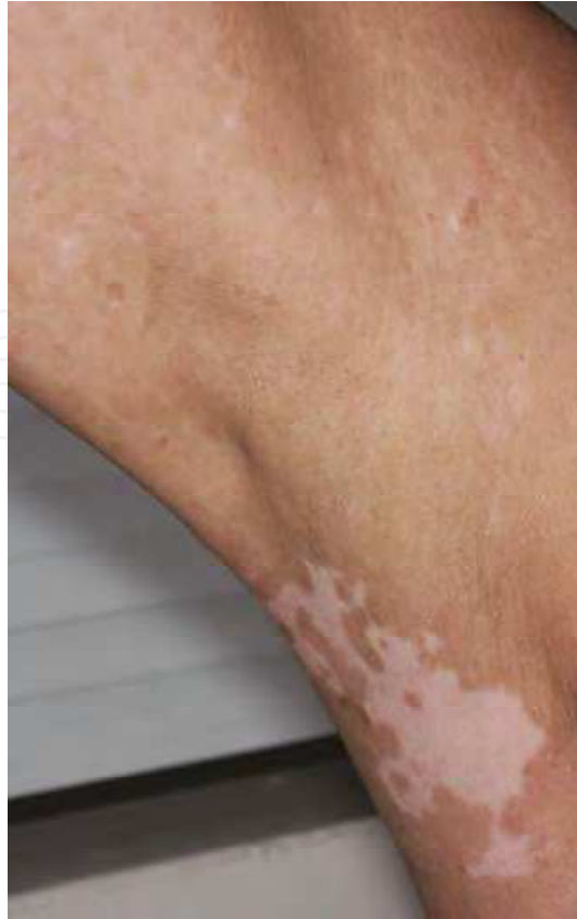
Fig. 5. Amelanotic patches of vitiligo in flexural areas undergoing involution NB-UVB therapy.