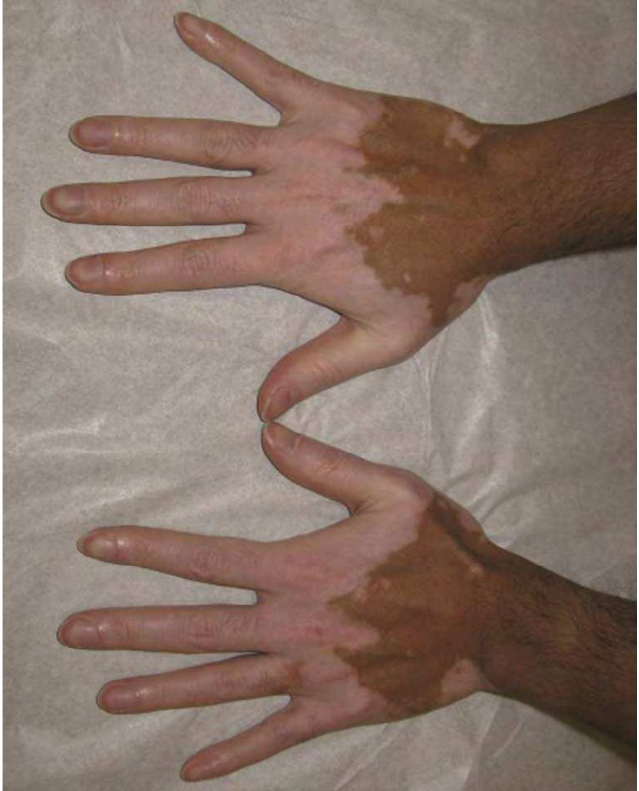
Fig. 1. Vitiligo of the hands.

commonplace, and new technologic developments in UVB therapy are continuously underway. The use of MEL with the excimer laser was first described in 1997 (Bonis, Kemeny et al., 1997).