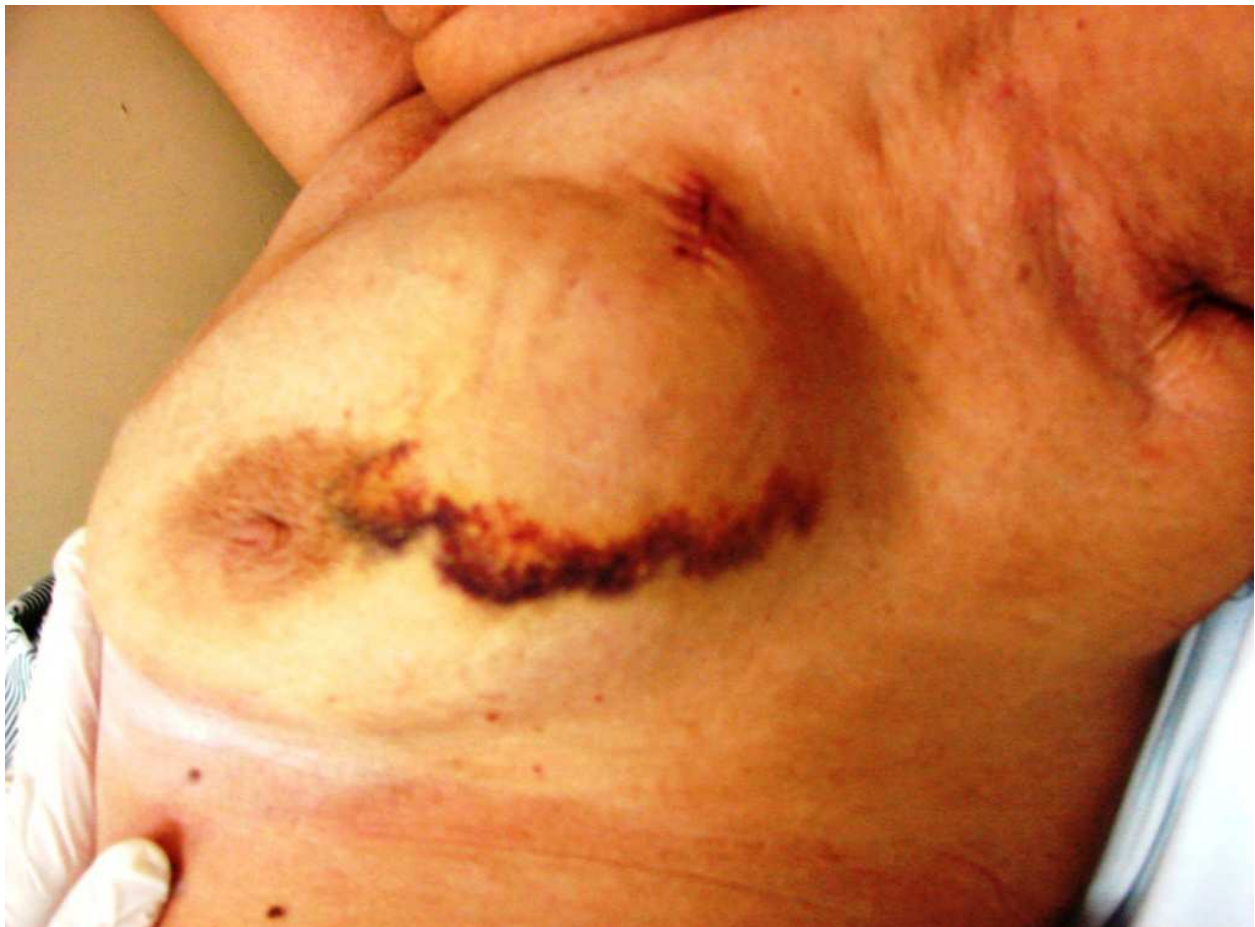
Photo 1. Skin mapped as a lymphatic duct in direction to the axilla

During the management of two patients submitted to breast biopsy in our service, we observed their skin mapped as the lymphatic ducts draining to axillary lymph nodes (Photo 1).