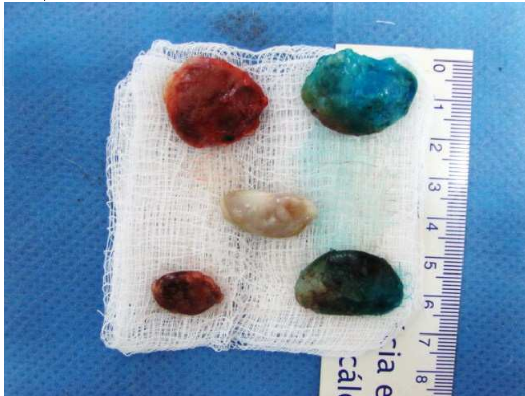
Photo 2. Sentinel lymph nodes marked with hemosiderin at left and with patent blue at right. Non-sentinel lymph node in the middle.

In bid to replicate what was seen in patients, we developed an experimental protocol for obtaining a marker derived from blood and tested in a model of experimental surgery in dogs (Photo 2).