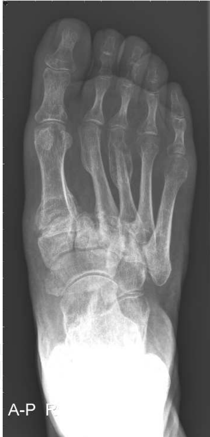
Fig. 2. Dislocation in tarsometatarsal joints: Lisfranc's dislocation

Therefore has a plain X-ray an important role in diagnosis and follow up of CN.