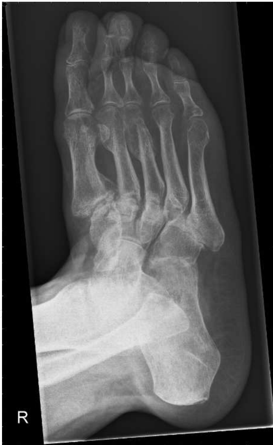
Fig. 3. Dislocation in Lisfranc, talonavicular joint (Chopart) and ankle fork

tomography (CT) is not well investigated. The five D's as mentioned above can be adapted to CT images. Bone scintigraphy (technetium) is the most often used nuclear method. Focal hyperperfusion and or focal bony uptake are seen on the scintigraphy but are not specific for CN. Also in osteomyelitis these characteristics are seen.