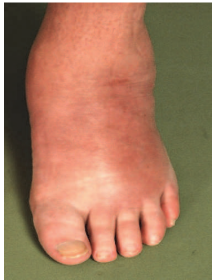
Fig. 1. Red hot swollen foot.

The differential diagnosis of a red, hot swollen foot is: severe infection (osteomyelitis) in case of a concurrent foot ulcer, cellulitis, bone fracture, gout or septic arthritis. Most difficult is to differentiate between an acute CN and osteomyelitis if a foot ulcer is present. Clinical directions in favour for osteomyelitis are a positive probe to the bone test and radiological abnormalities in relation to the ulcer, that is mostly located on pressure points like metatarsal heads or rocker-bottom. Radiological abnormalities in favour of CN are radiological abnormalities in the mid foot. The chronic not active Charcot foot is characterized with joint deformity, and or (sub) luxation of the metatarsals leading to rocker-bottom. These deformities cause elevated plantar pressure leading to abundant callus formation and an increased risk for foot ulcers.