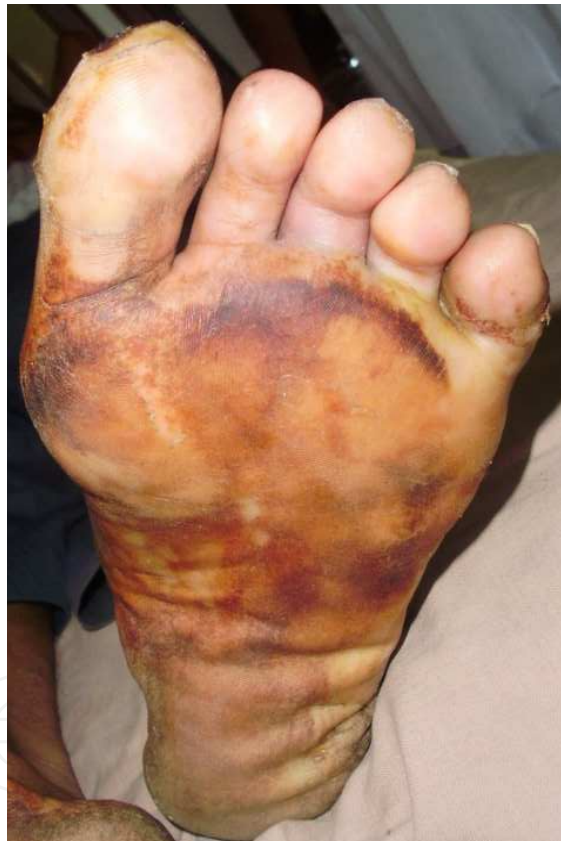
Fig. 4. Showing thermal injury on the plantar area of right foot.

Indians are known for sitting cross legged for long hours at work and during worship. Repeated and prolonged pressure over lateral malleolar areas lead to formation of bursae. Such bursae over lateral malleoli are dark and hypertrophied but are usually harmless in non neuropathic individuals. In diabetics with neuropathy, these bursae get ulcerated and often secondarily infected, creating a surgical emergency. Indian women wear metal (silver being commonest) toe rings in one or more toes of both feet, which is part of tradition. In neuropathic feet with deformities of toes, these toe rings often cause strangulation in presence of swelling of the feet. In tropical climate due to excessive sweating, fungal infection quickly sets-in, in web spaces. In diabetics with neuropathy these macerated ulceration often gets secondarily infected and find their way, quickly, to deep plantar compartments creating a limb threatening situation. (Pendsey 2010).