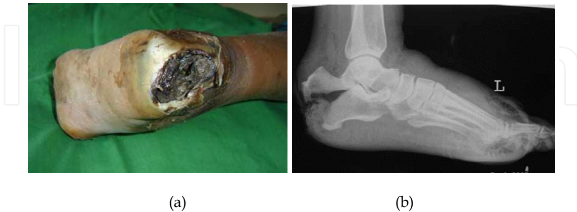
Fig. 2. (a). Infected heel with necrosis of the soft tissue (b). Radiograph showing osteomyelitis of calcaneum, soft tissue swelling with gas shadow in the area of forefoot.

Severely infected foot is the hallmark of Indian diabetic foot. It is not uncommon to see a patient with foul smelling, oedematous and severely infected foot with moribund general condition. Such patients have life threatening infection and therefore invariably require primary limb amputation. (Pendsey 2010).