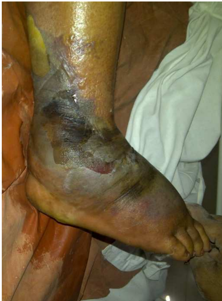
Fig. 1. Severely infected foot

Peripheral vascular disease (PVD) has been reported to be low among Asians (Pendsey 1998) ranging between 3 - 6% as against 25 - 45% in Western world. (Marinelli et al.,1979; Migdalis et al., 1992; Walters et al., 1992). The prevalence of PVD increases with advancing age and is 3.2% below 50 years of age and rises to 55% in those above 80 years of age. Similarly it also increases with increased duration of diabetes, 15% at 10 years and 45% after 40 years (Janka,et al., 1980). In India the number of diabetic patients above the age of 80 years or with the duration of diabetes of more than 30 years is extremely low, thus explaining the low prevalence of PVD in Indian diabetics. (Pendsey 1998).