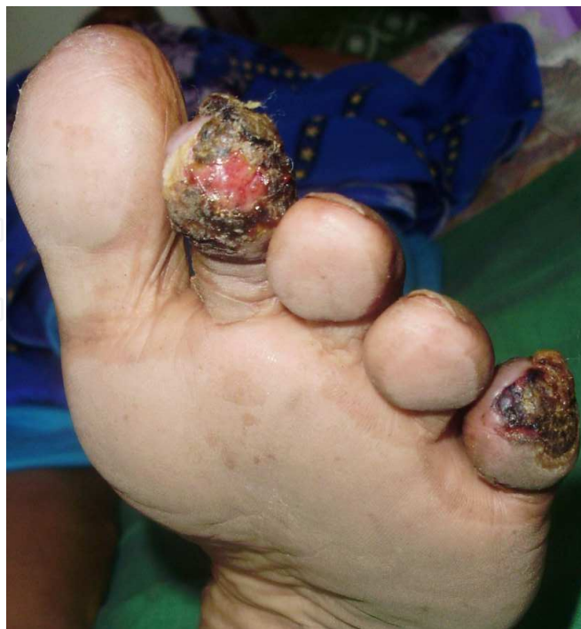
Fig. 3. Showing ulcers on second and fifth toes due to rat bite

Certain atypical presentations are seen because of socio economic and cultural factors prevalent in India. Patients with neuropathy and consequent loss of protective sensations, who sleep on the floor are invariably bitten by house rats who nibble toes creating deep foot ulcerations. Patients notice the ulcers on waking up to find blood stained bed linen, in the morning. Patients notice the ulcers on waking up to find blood stained bed linen, in the morning.