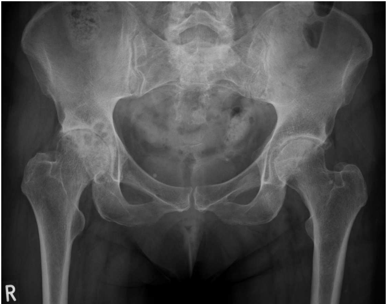
Fig. 1. Anteroposterior radiograph of the pelvis showing, right hip osteoarthritis with a triad of joint space narrowing, subchondral cysts and osteophyte formation.